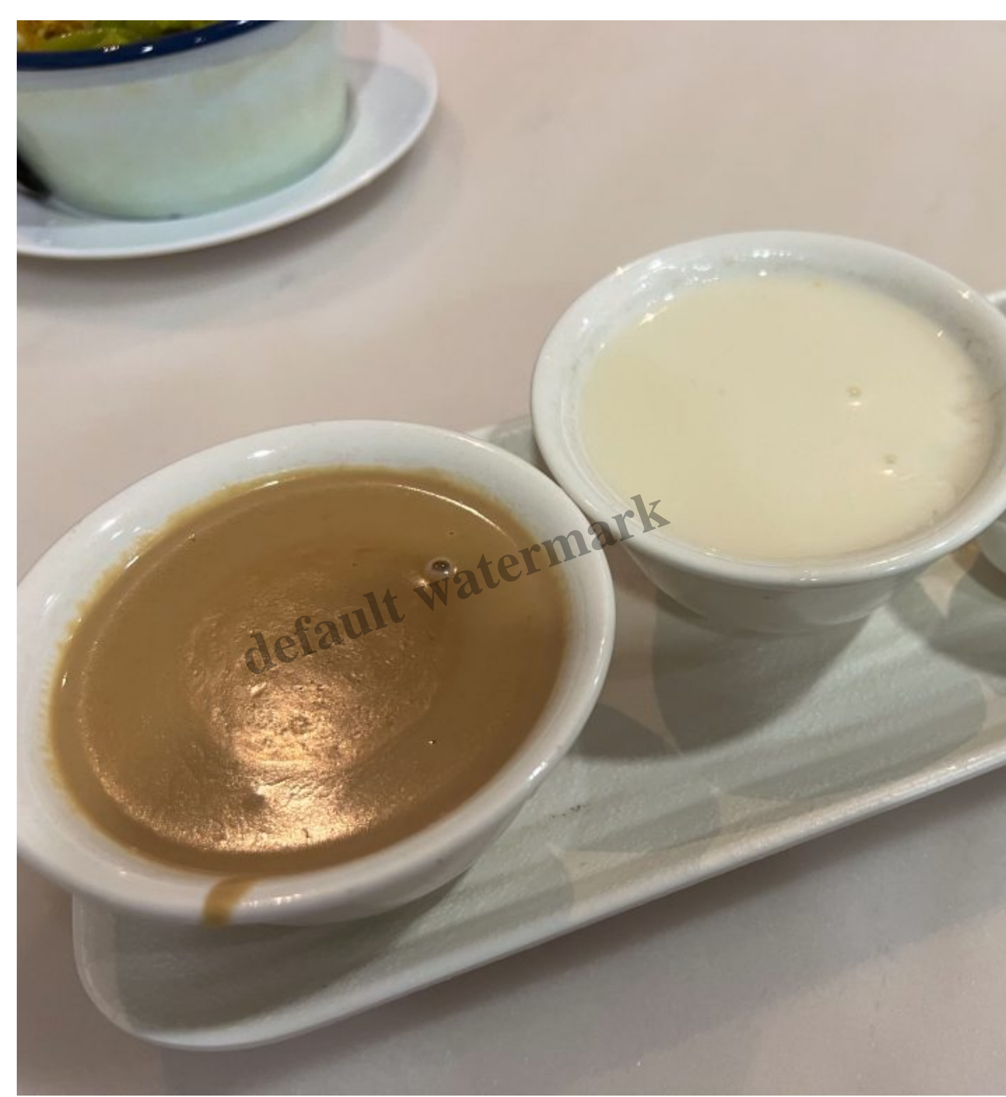
Mini Soup Set of 3 (You can select three options from those listed with the + icon next to them)