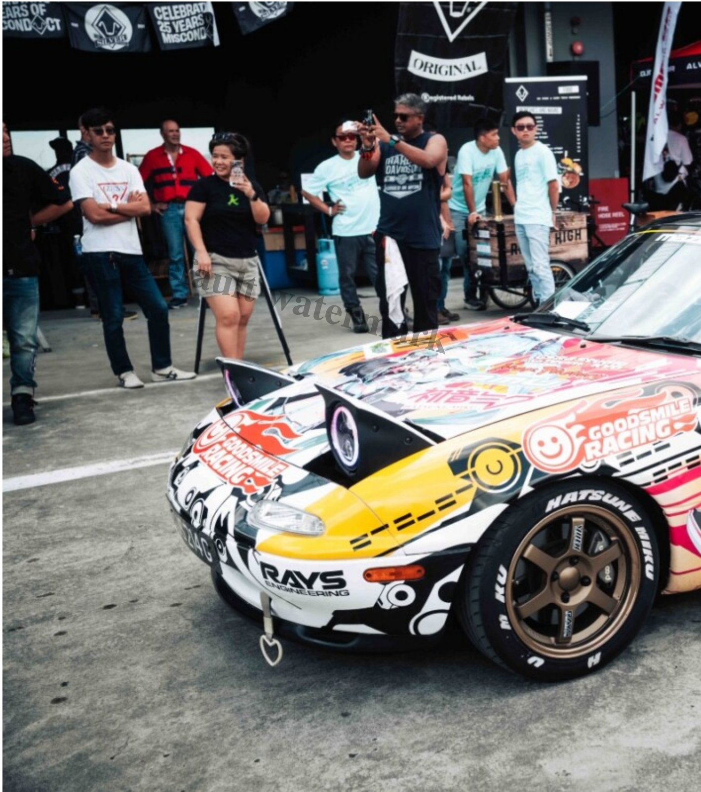
This car looks like it came out from an anime comic book

I would say the automobile display last year has more to show for, but with beauty like this Lamborghini, you definitely want to stop and look.