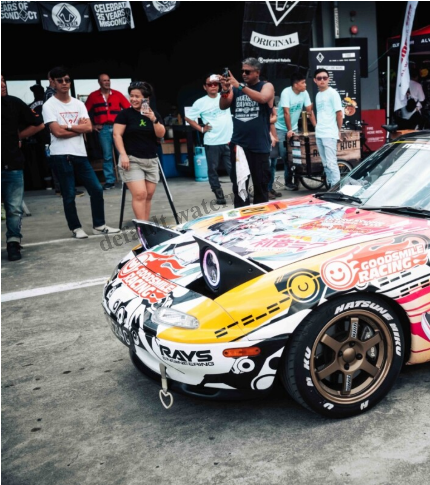
This car looks like it came out from an anime comic book

I would say the automobile display last year has more to show for, but with beauty like this Lamborghini, you definitely want to stop and look.