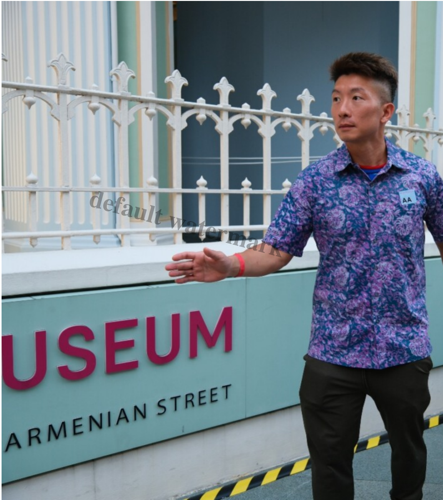
Come, let me bring you to explore the bazaar