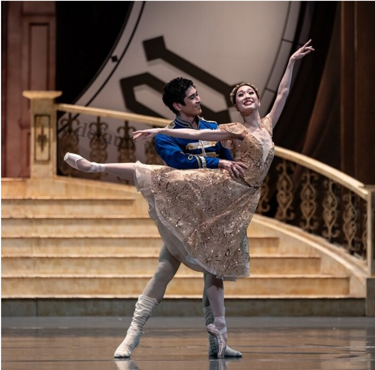
Singapore Ballet's Danses de R ve at Alliance Fran aise.

anonymous labour. Part of Singapore International Festival of Arts (SIFA) 2026 . Various timings at Singtel Waterfront Theatre at Esplanade . Tickets from S$48 . Advisory 16 (mature content and coarse language).