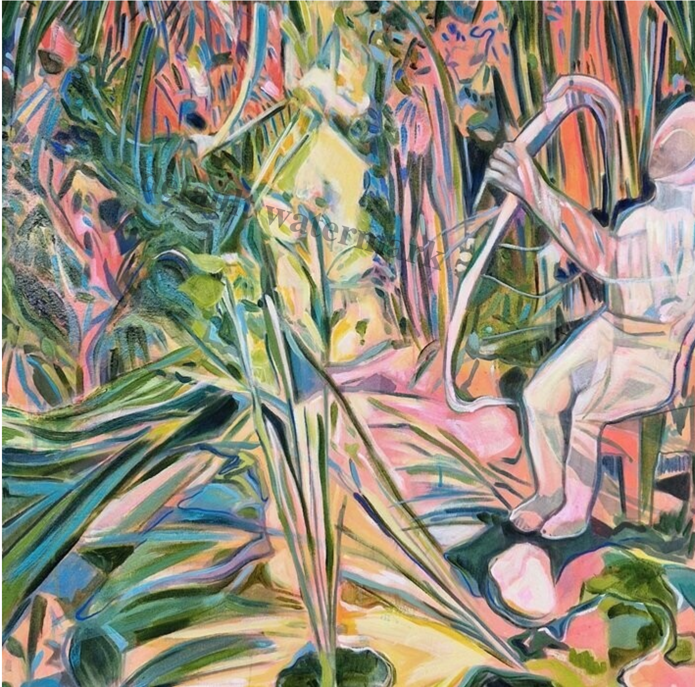
Le Grand Tour at JW Projects, work by Emi Avora. Image: Emi Avora / vOilah! 2026

Ugo Li's still-life paintings approach the genre as an "after" tables once meals have ended, vases when flowers are gone. The work is observed with restraint, neither idealised nor sentimentalised. Catch the closing days at Richard Koh Fine Art , open Tuesdays to Saturdays, 11am-7pm. Free admission.