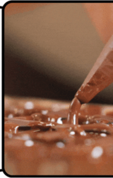
Image: voco Orchard Singapore by IHG