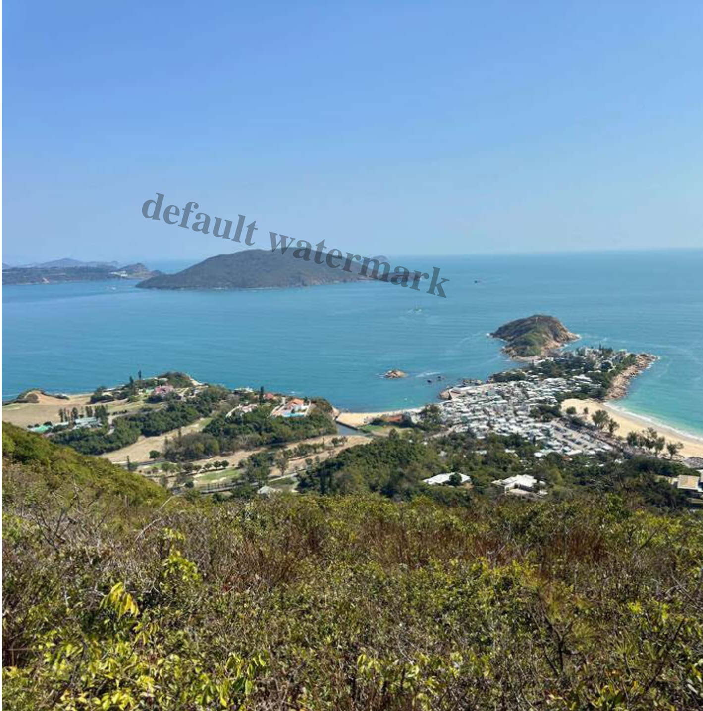
Hong Kong Island's Dragon's Back Trail affords sweeping vistas