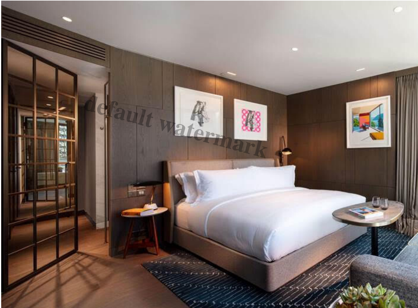
The Hari Hong Kong's stylish rooms are a refined base for longer explorations

To support longer stays, The Hari Hong Kong is offering tailored packages designed to reward time spent in the city. Its Stay Longer With Us offer provides exclusive rates for extended visits, while A Night on Us offers 25% off a four-night stay to inspire a more unhurried approach to travel.