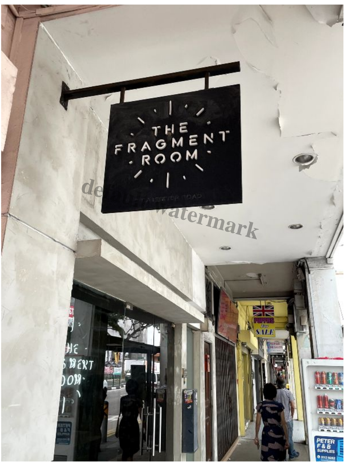
The Fragment Room

It was a relaxing day, putting work aside, so I was feeling less angry than usual ( LOL ). Still, how can smashing things up not be fun right?