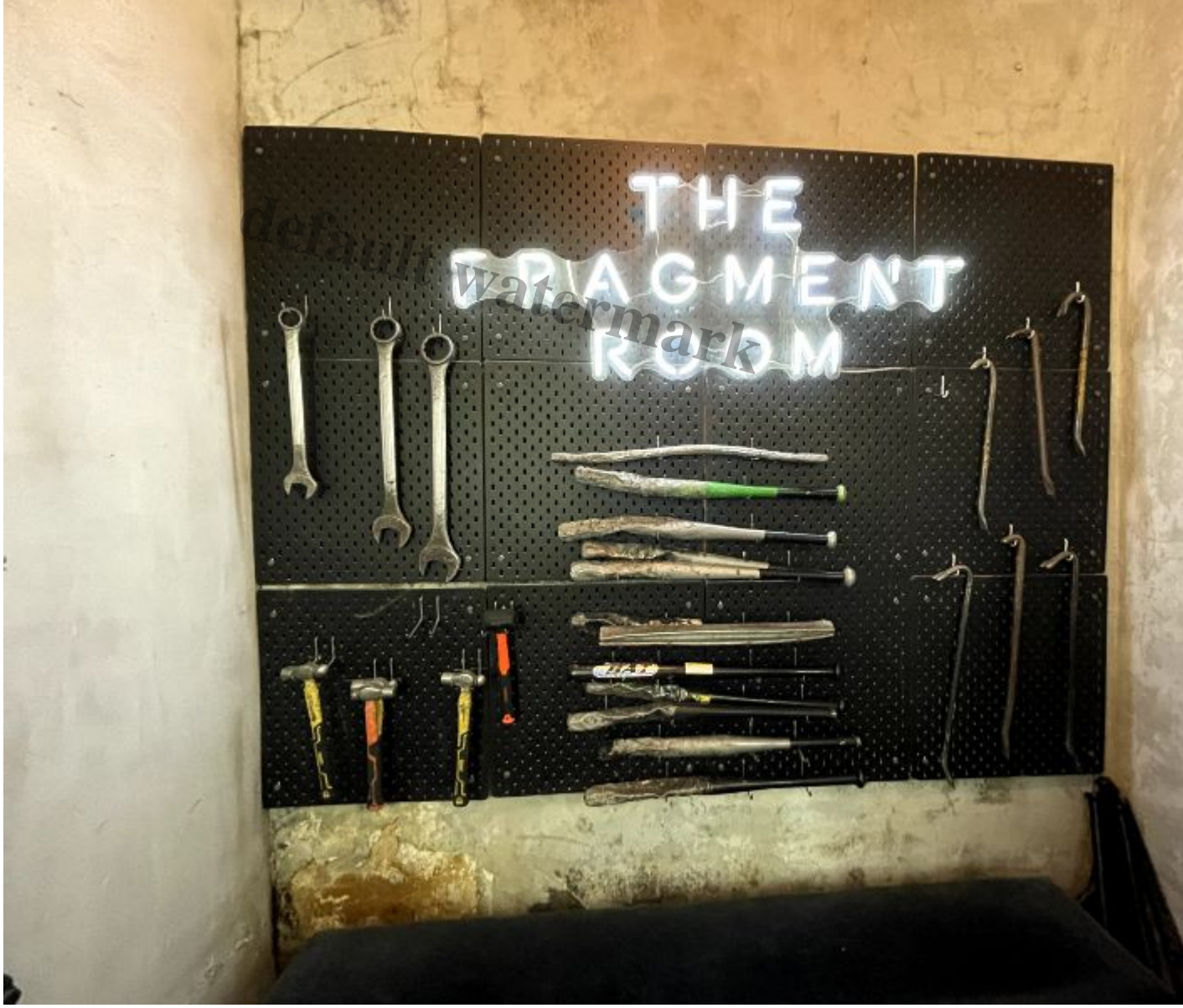
Very handy in a zombie apocalypse

The tools reminded me of the movie â??Hostelâ?• where wealthy customers pay to torture kidnapped tourists in a foreign land. These customers have a whole array of torture devices to inflict on their victims. In our case, we are just â??torturingâ?• glass bottles hehe.