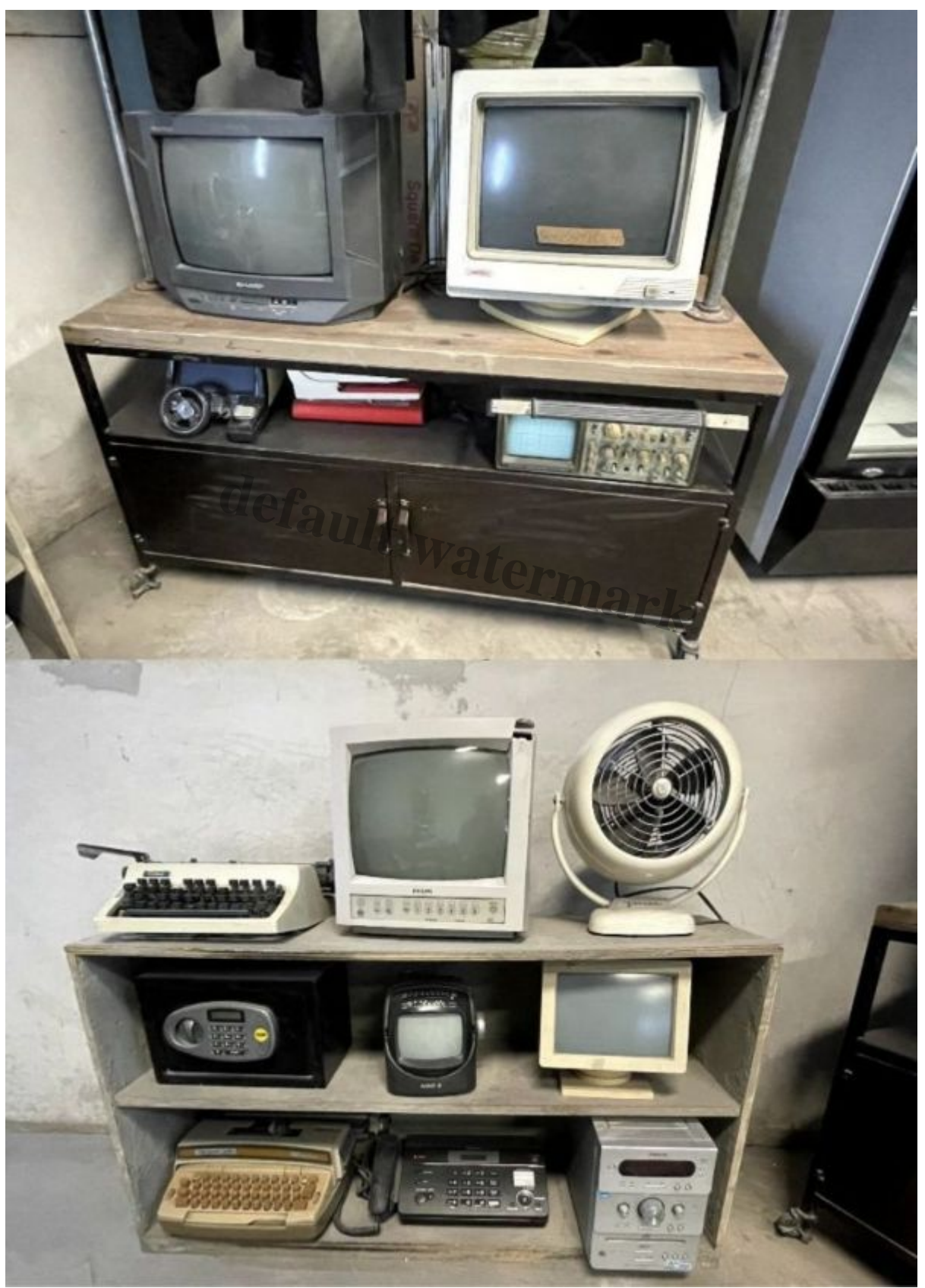
Karung Guni will be happy with these

Do note add-on items are separately chargeable depending on the item type.