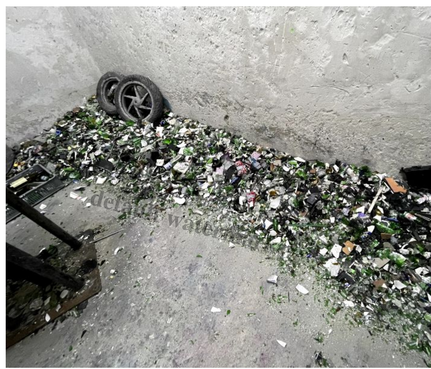
The shattered remains of my subjects

The session was physically exhilarating and exhausting to some extent. I was sweating a little towards the end even though the room was fully air-conditioned. Do come in light clothing as the coveralls are pretty thick and you will be fully covered from head to toe.