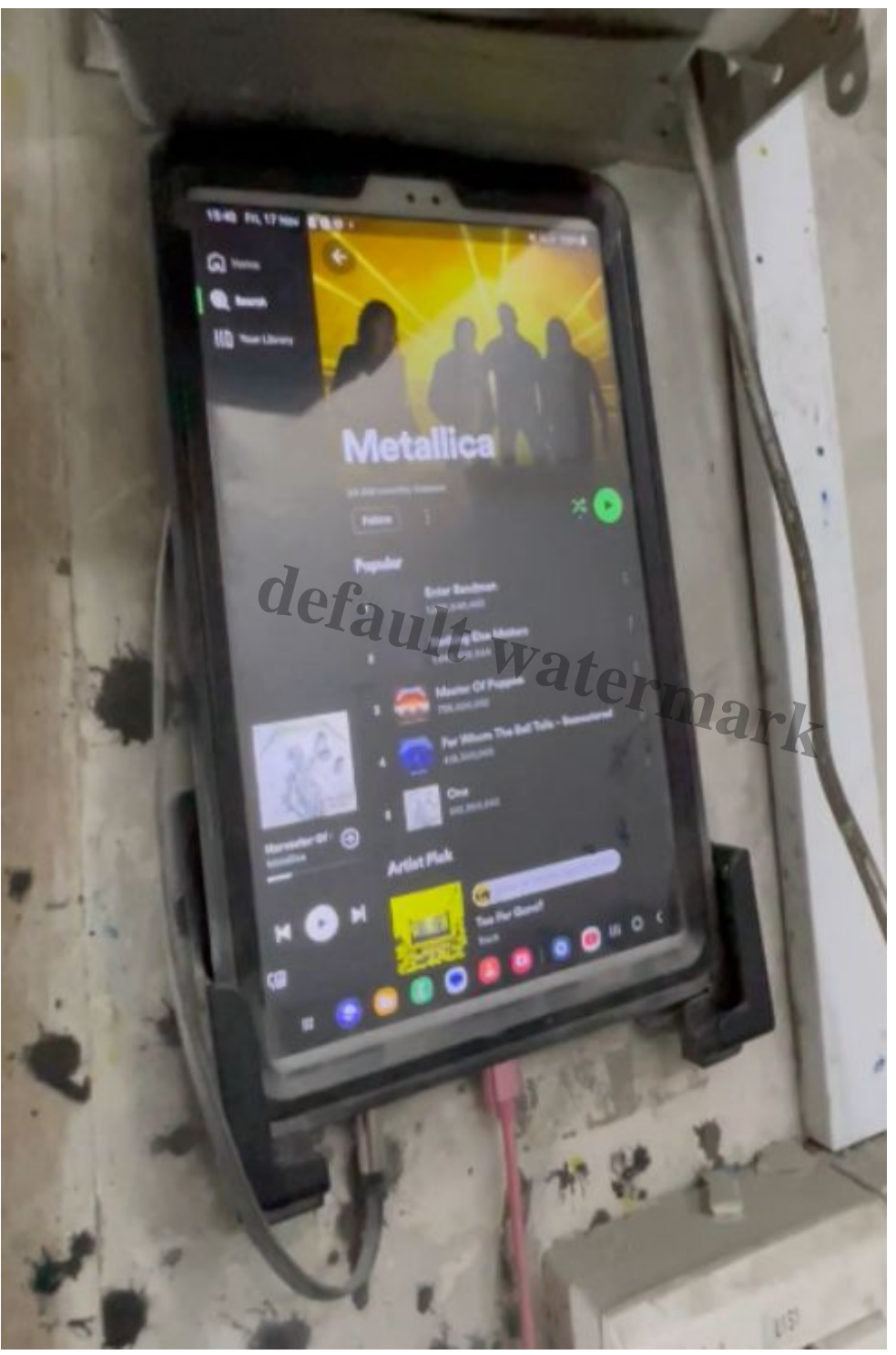
Heavy metal music for an enhanced experience

A pleasant surprise feature is the sound system within the room itself. There is an iPad for you to play your preferred heavy metal music or Pavarottiâ??s masterpiece. As I said, it is your personal torture room.