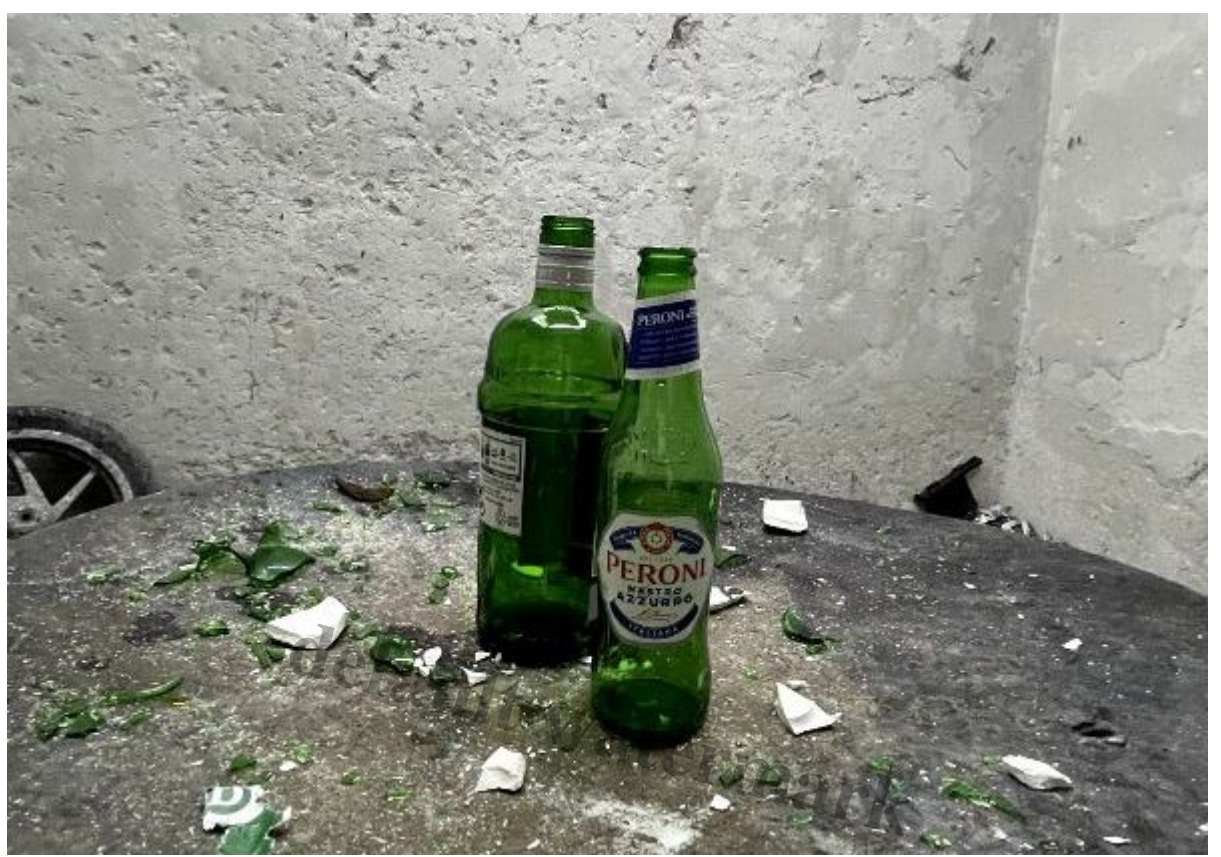
Smash them by throwing against the wall