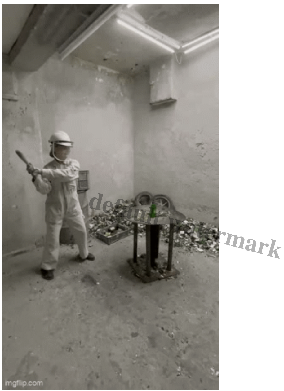
Looks like she has done this a thousand timesâ?!..

Oddly, we were getting happier with every smash. There is a quirky sense of power and satisfaction when we hit the bottles cleanly with one strike. Then we started throwing the bottles in the air to try to hit them. Somehow, it became a baseball training session. :p