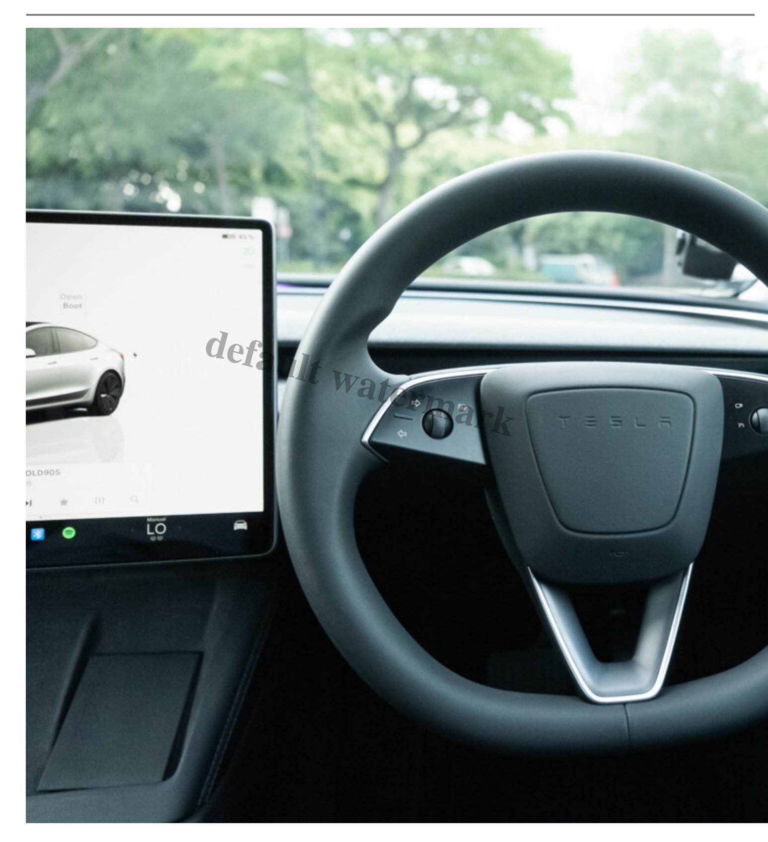
Controls driving modes, climate, navigation, games, streaming. Gear selection via screen swipes (with backup buttons on the overhead console).