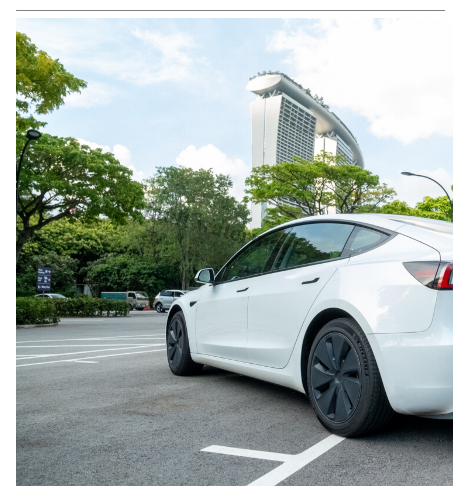
New Headlights and Taillights: