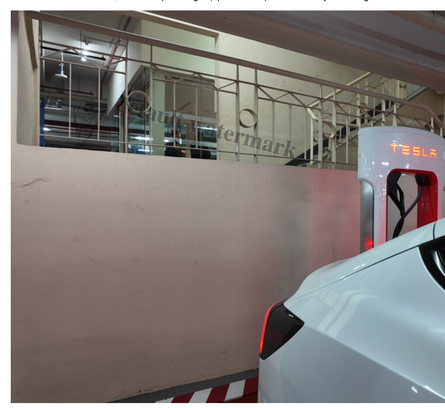
Driving Experience: Is The Cat A Model Engaging?

Access to Teslaâ??s fast, reliable supercharger (up to 250kW) remains a key advantage.