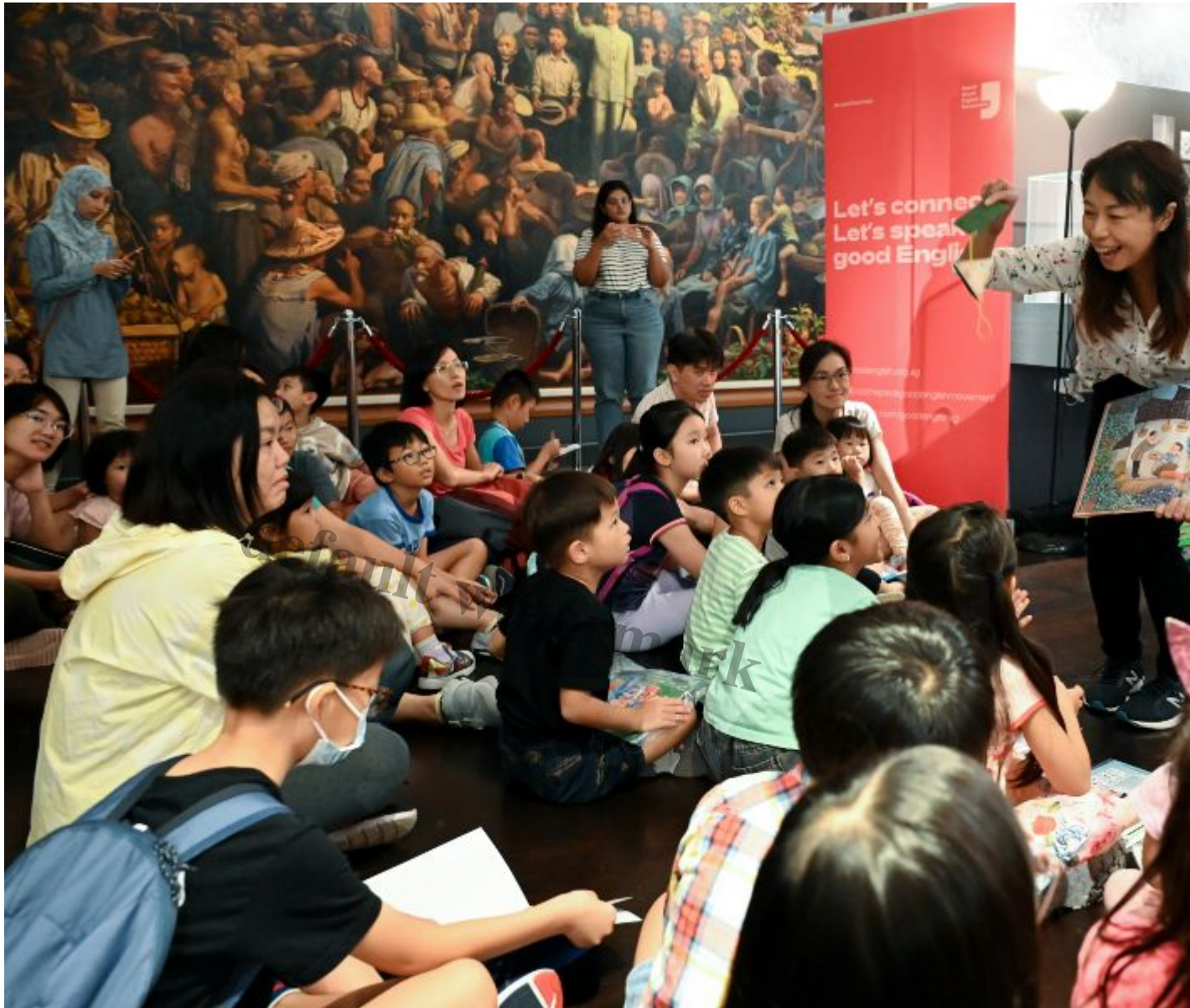
Storytelling Session – Tales of Dragon Boat Festival

Be swept away with enthralling tales in our popular storytelling sessions! Discover the legends and myths behind well-loved Chinese stories as local authors and veteran storytellers bring you on a literary adventure.