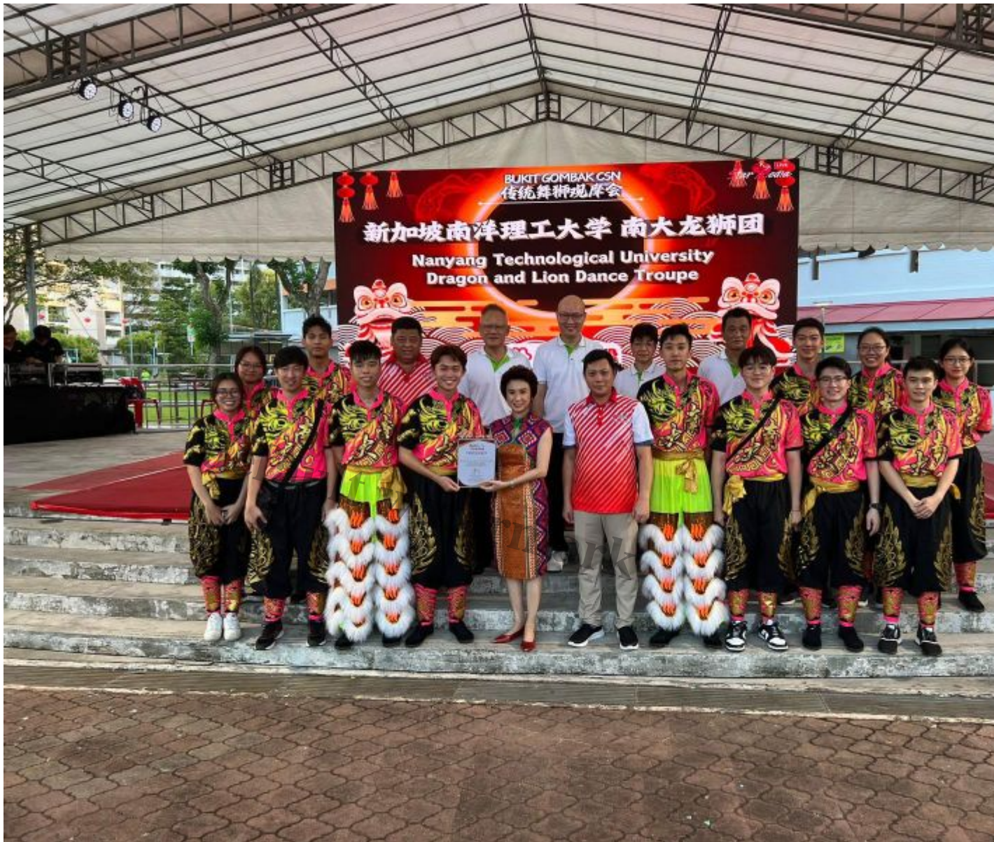
(Supported by NTU Dragon & Lion Dance Troupe)

Be enchanted by the ever-popular lion and dragon dance at Wan Qing Dragon Boat Festival 2024. Don't blink an eye as the performers showcase their agility and coordination in this crowd-puller act by the NTU Dragon & Lion Dance Troupe.