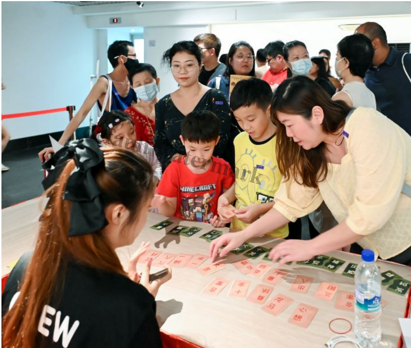
Drop-in Activity Station – Duanwu Mini Games

Explore the rich traditions of the Dragon Boat Festival at our mini-game booths! Engage in interactive games that educate and entertain, offering insights into the festival’s history and customs.