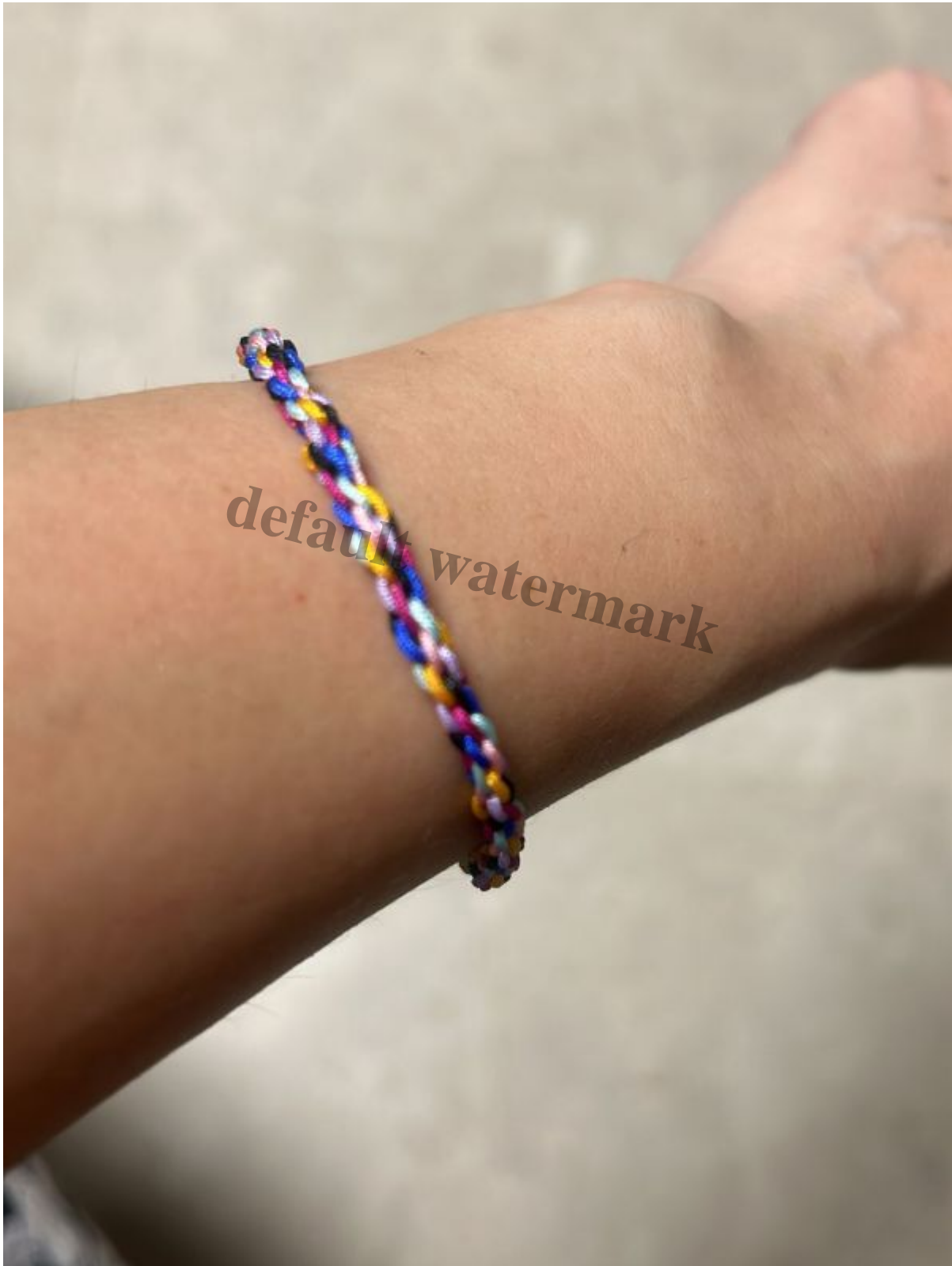
Drop-in Craft Station â?? DIY Duanwu Five-colour Bracelet

The five different coloured threads in a five-colour bracelet are said to represent the elements of wood, fire, earth, metal and water. According to Chinese folklore, it is believed that wearing a five-colour bracelet can help children ward off evil spirits and diseases during the