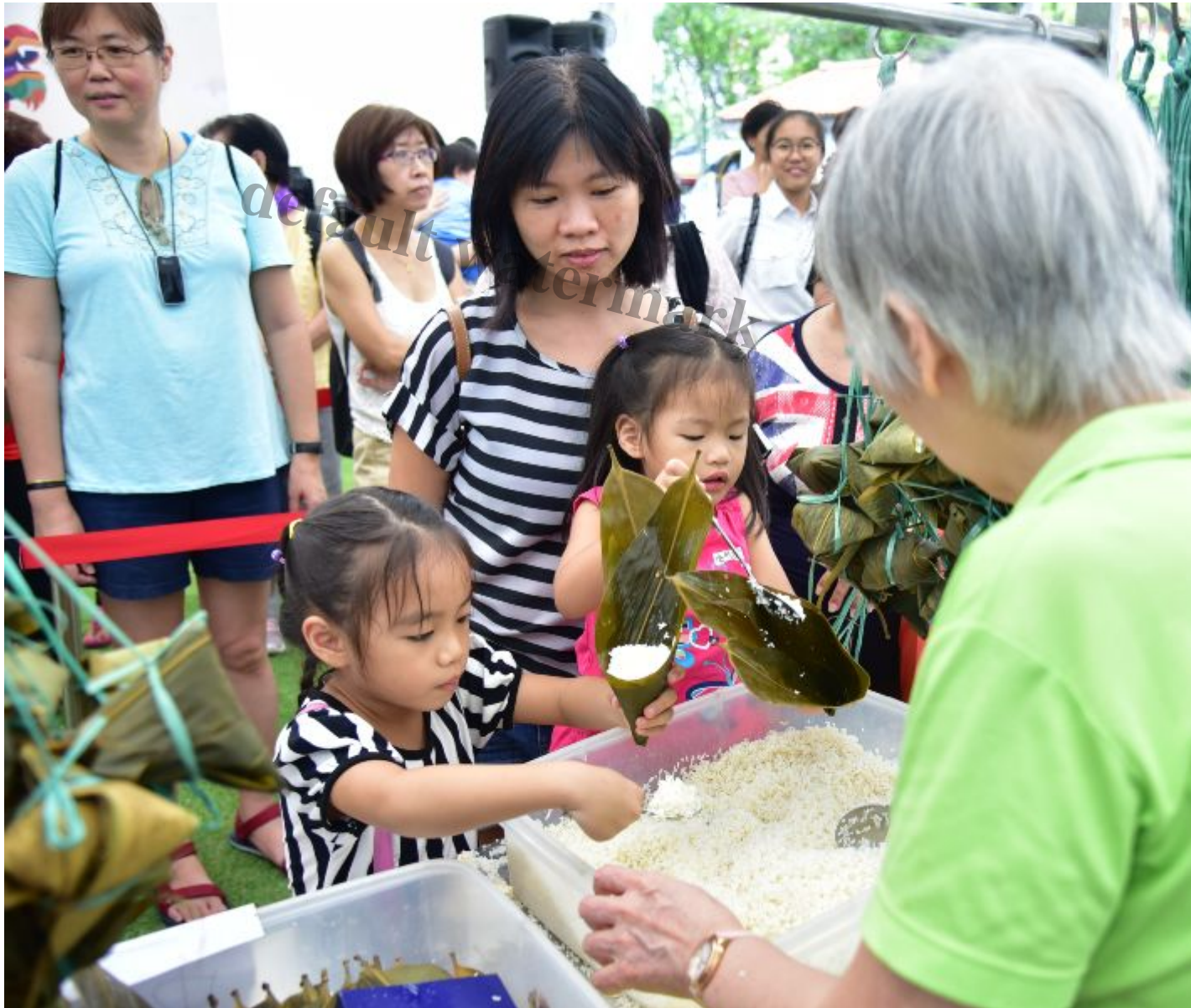
Drop-in Activity Station - Rice Dumpling Wrapping Station

From the folding of leaves, filling the rice and wrapping the rice dumpling on a string, this is the perfect opportunity to learn how to wrap a rice dumpling at our Rice Dumpling Wrapping Station.