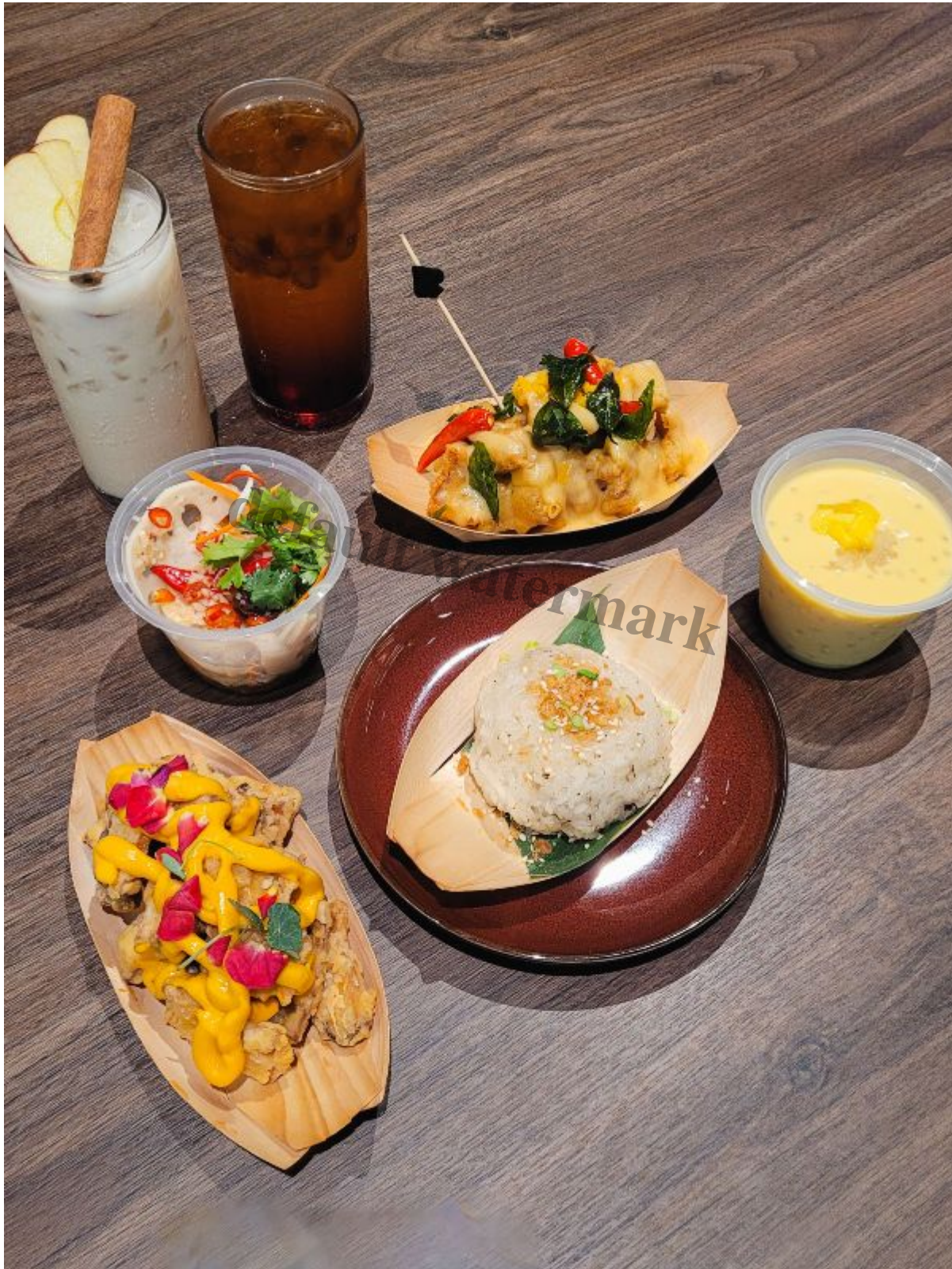
Festive Snacks Pop-up Booth by Yue @ Aloft

Experience the flavours of Yue @ Aloft at the Festive Snacks Pop-up Booth! Sample yummy snacks such as Mushroom with Yue's Signature Creamy Milk and Salted Egg Lime Sauce or indulge in other light bites such as the Popcorn Chicken and Glutinous Rice Ball with Truffle Chicken. Spice things up with Chilled Sze Chuan Mala Lotus Root and lastly, savour the sweetness of Mango Sago or enjoy