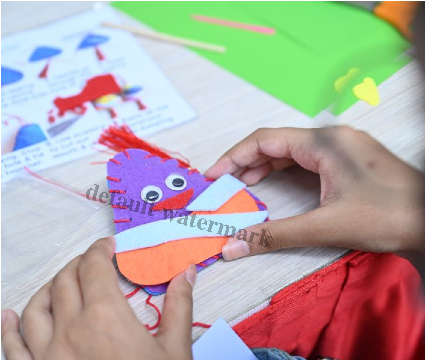
Drop-in Craft Station â?? DIY Duanwu Scented Sachets

In ancient times, it was common for people to carry with them sachets filled with Chinese mugwort during the Dragon Boat Festival to protect against venomous animals due to the herbâ??s natural repellent properties. Come make your scented sachets at our drop-in craft station to experience this traditional practice.