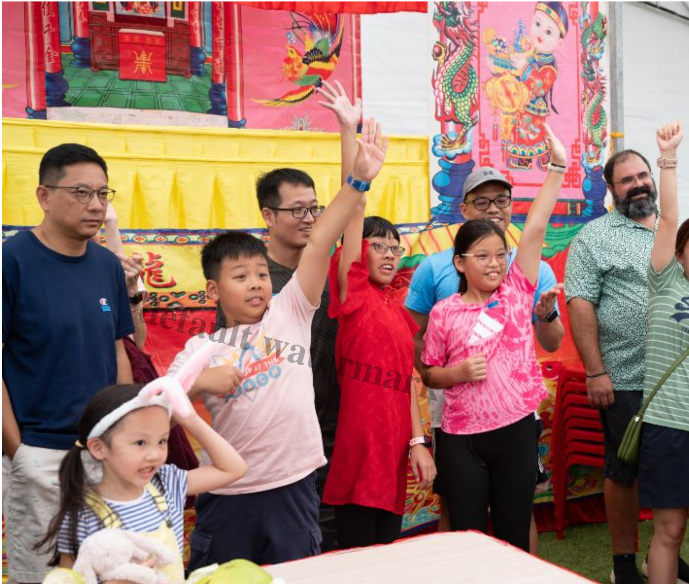
Live on the Lawn â?? Dragon Boat Festival Family Fun Contest

Gather your family for a Dragon Boat Festival Family Fun Contest on stage! Engage in friendly rivalry as you join other families in exciting Dragon Boat Festival-themed games. Itâ??s a session of bonding and fun! Limited spots are available, register your interest on the day to reserve your spot.