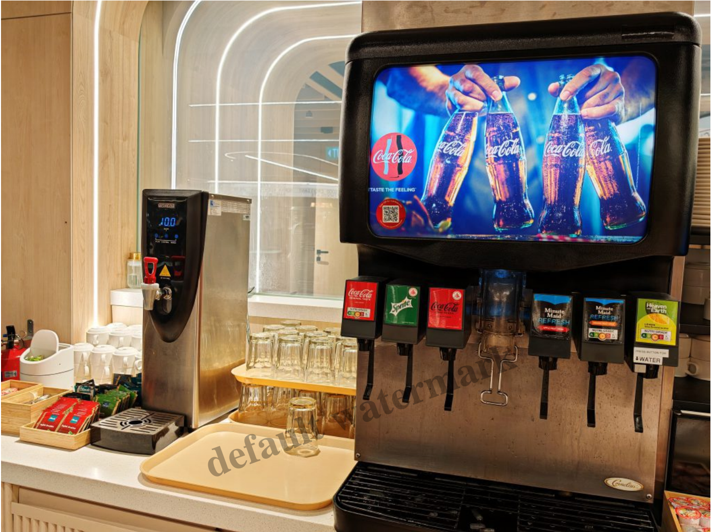
HONOR Magic6 Pro