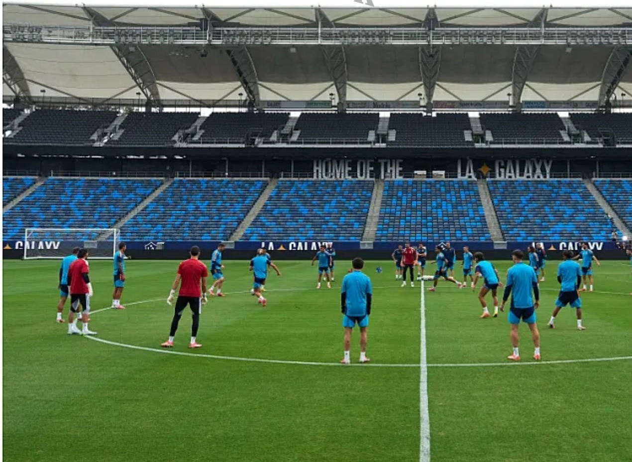
Spain trained in Los Angeles on 1 July ahead of their Round of 32 clash.