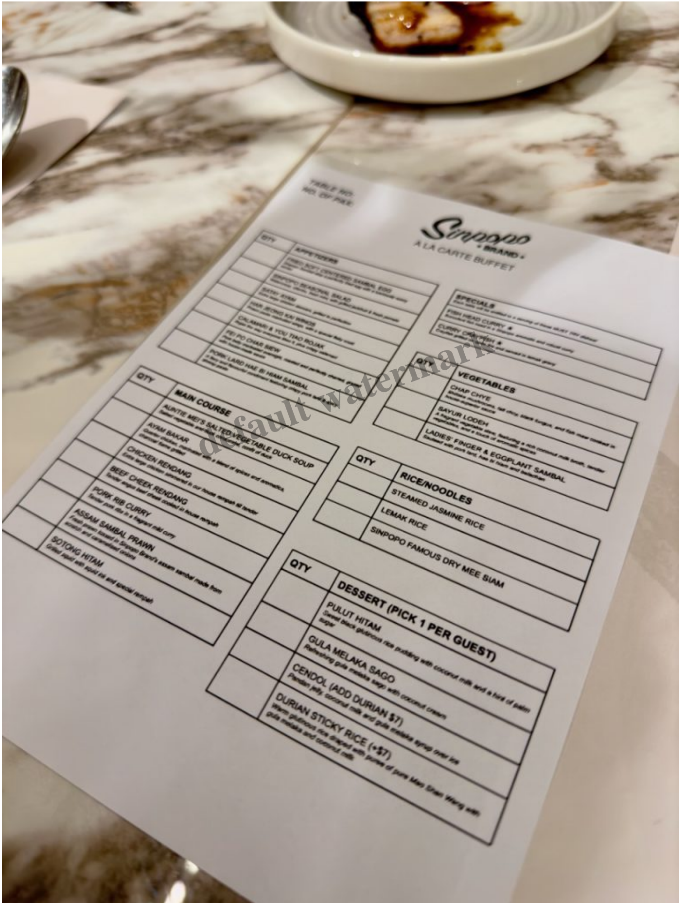
TABLE NO: NO. OF PAX: