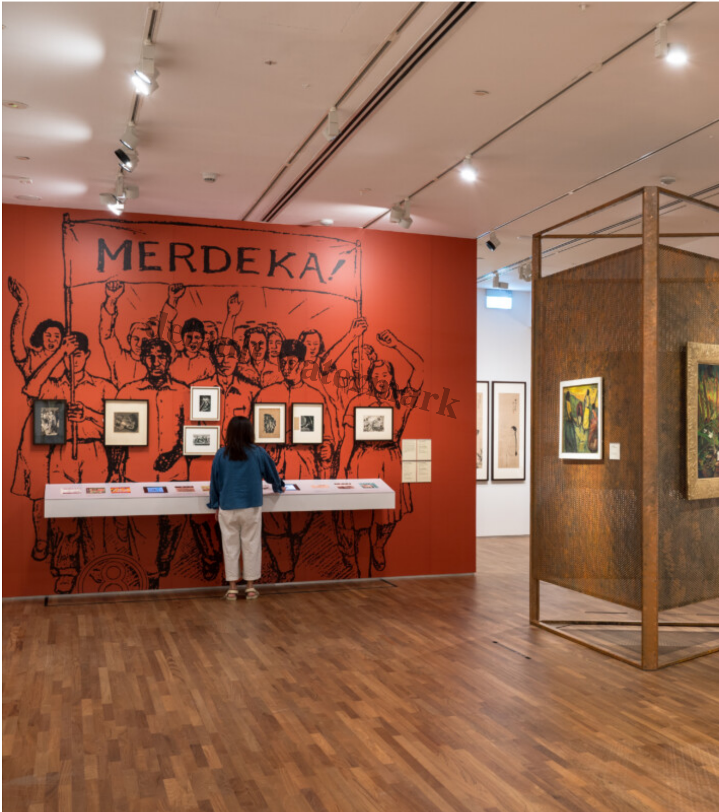
Installation views show how the long-term exhibition has been reconfigured.