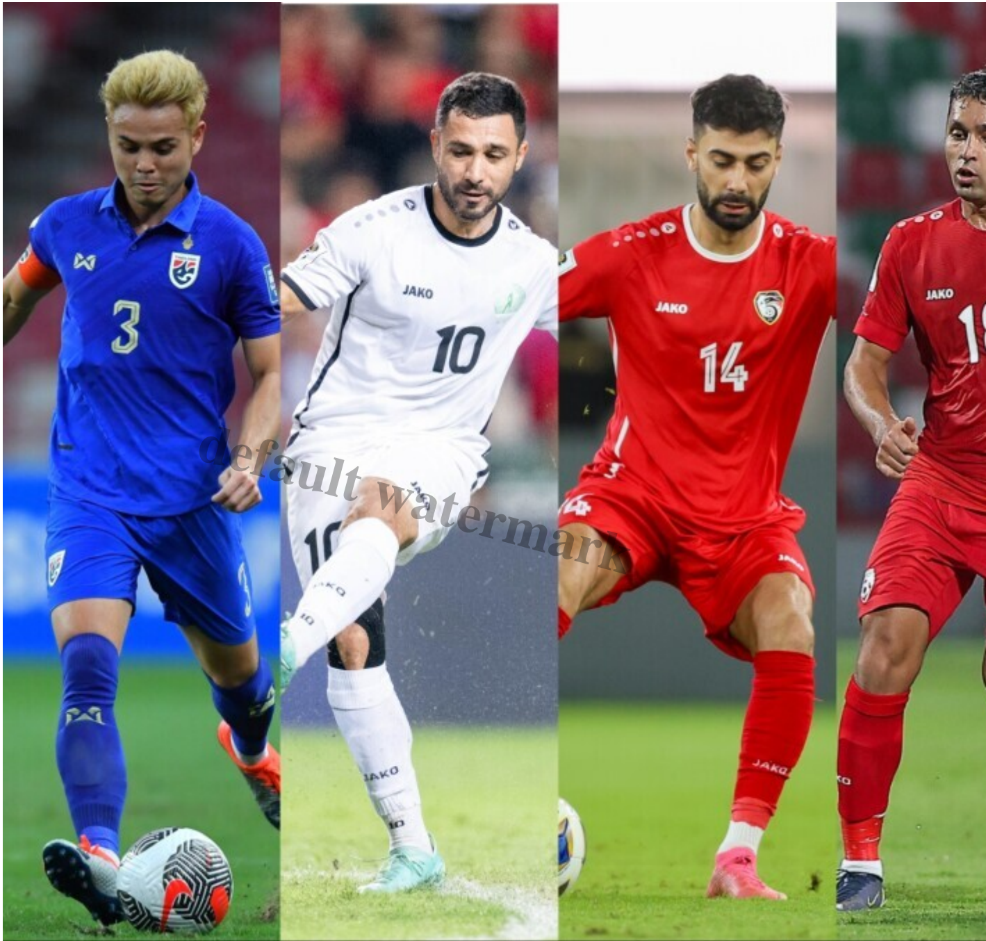
Group D at the AFC Asian Cup 2027: Singapore face Australia, Iraq, and Tajikistan Source: AFC Official

Singapore's group stage fixtures are as follows: versus Australia on 9 January; versus Iraq on 14 January; versus Tajikistan on 19 January. All three matches will take place at venues across Saudi Arabia. The top two teams in each group advance automatically to the round of sixteen, with four of the best third-placed finishers also progressing.