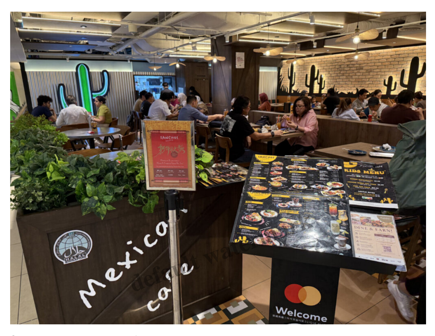
Sopas means soup I assume?