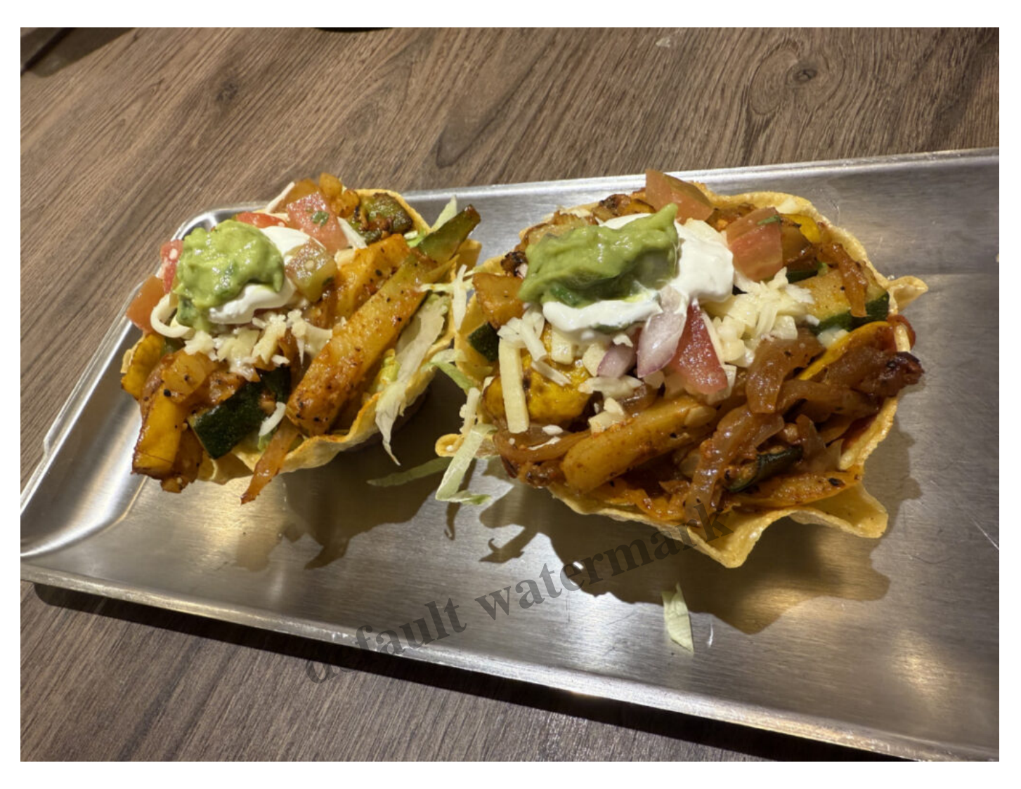
This was the Bang Bang Prawn Tacos