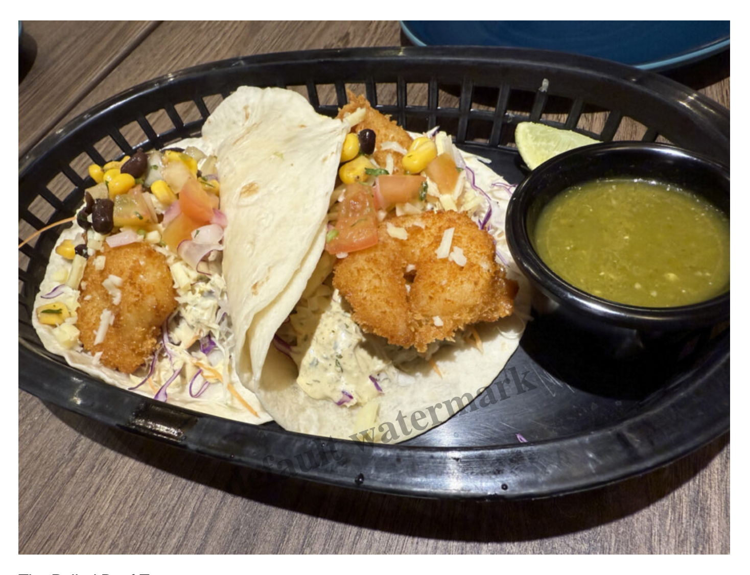
The Pulled Beef Torta