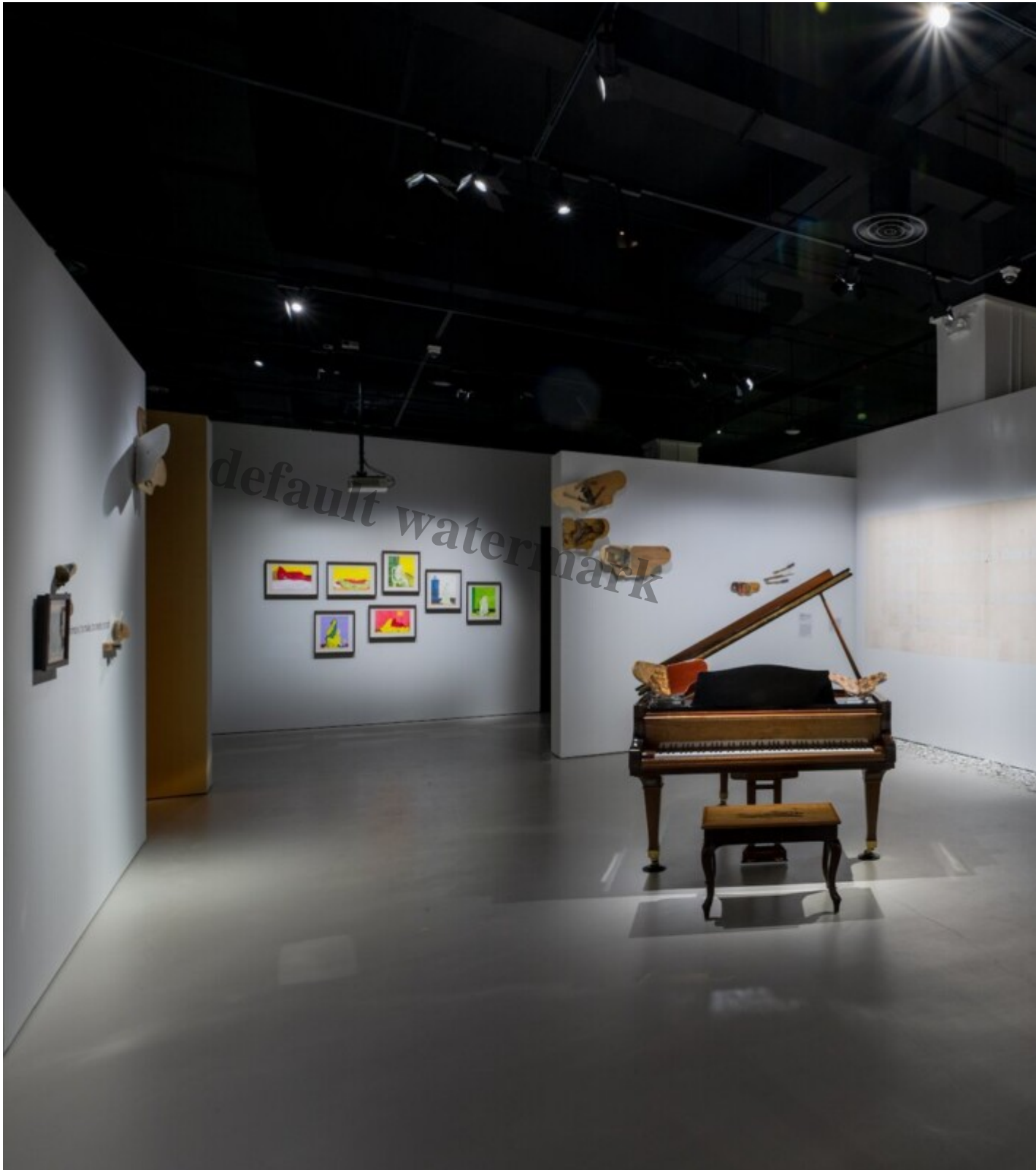
The galleries at SAM are currently home to Talking Objects and The Living Room , both closing 2 August.