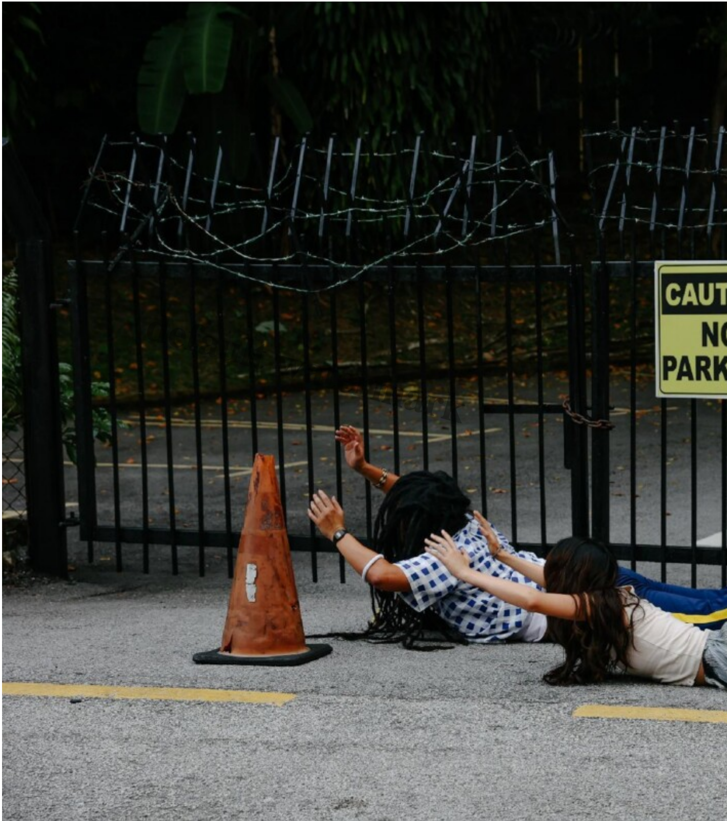
Two Who Remember the Sea - an evening programme at Wessex Estate on 18 July.