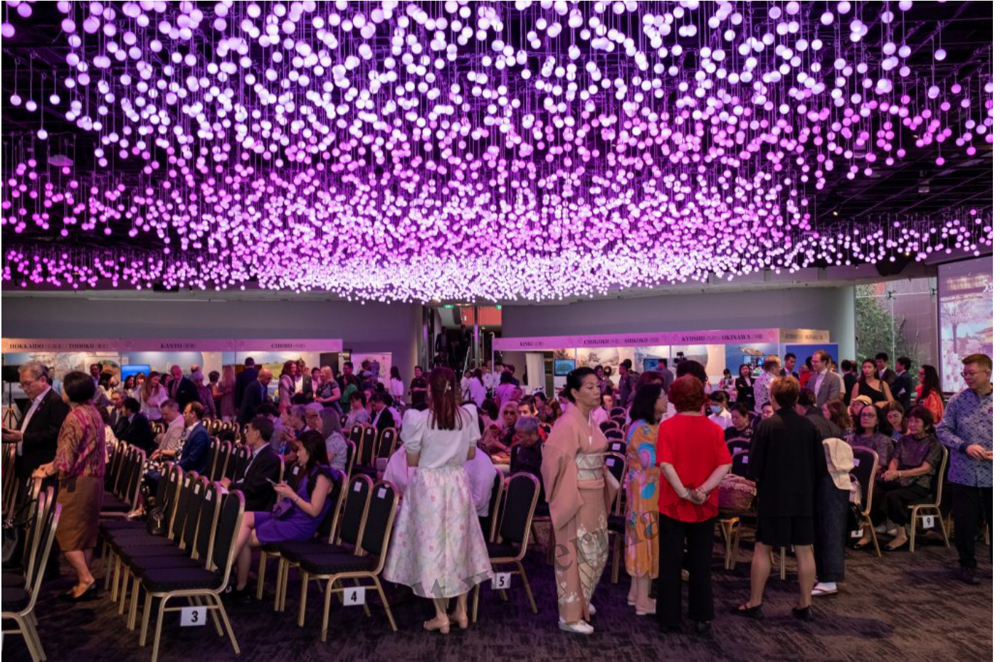
VIPs were in the house. Hopefully the Japanese did feel like this display of sakuras matched up to those back in Japan.