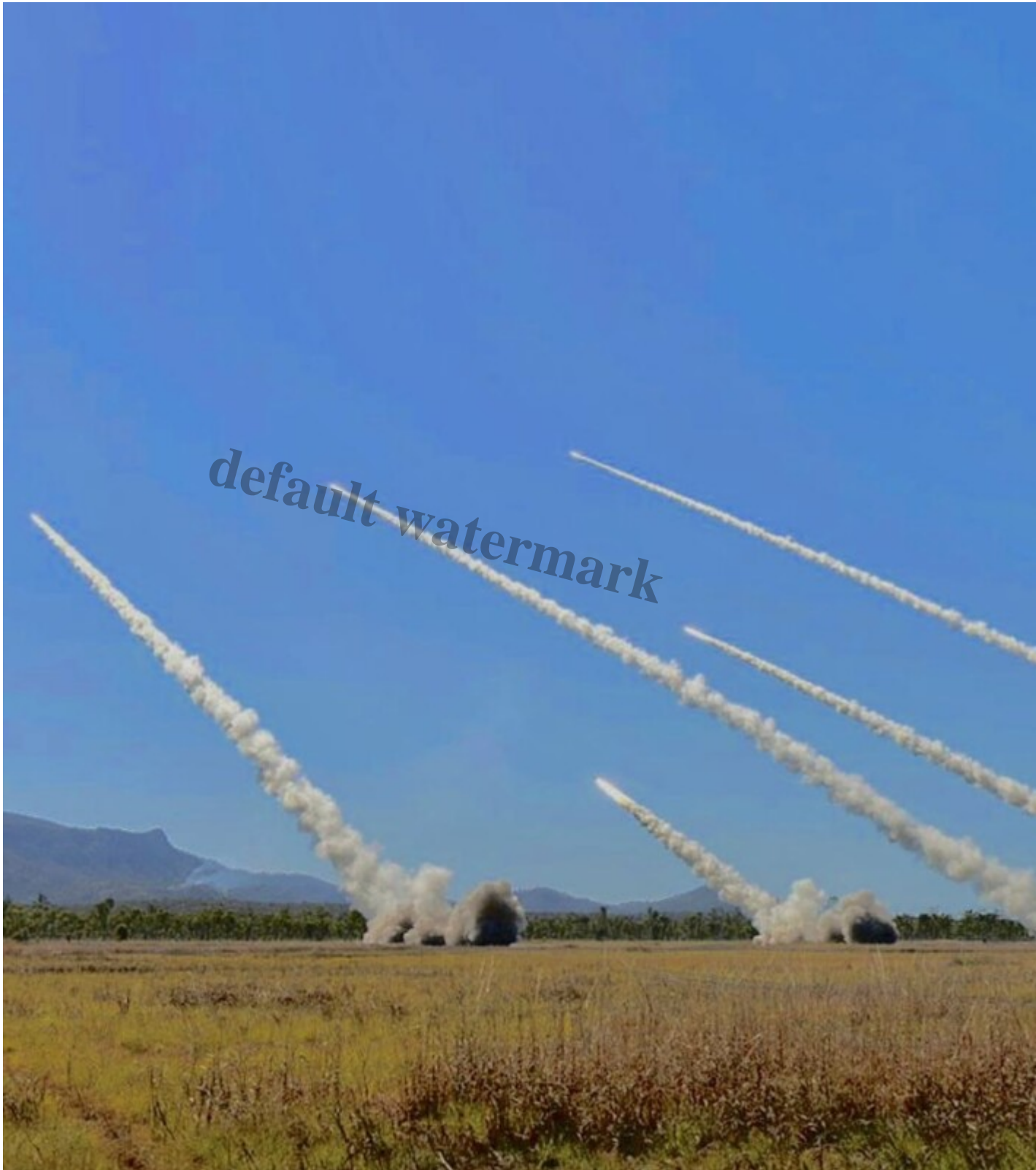
MINDEF photo of the Singapore Army HIMARS participating in a combined joint live-firing exercise.

If you hear blanks, thunderflashes, aircraft activity or distant live-firing sounds this week, the key point from MINDEF is not to be alarmed. The advisory exists precisely because these exercises can be audible outside training grounds, especially when weather and wind carry sound further than expected.