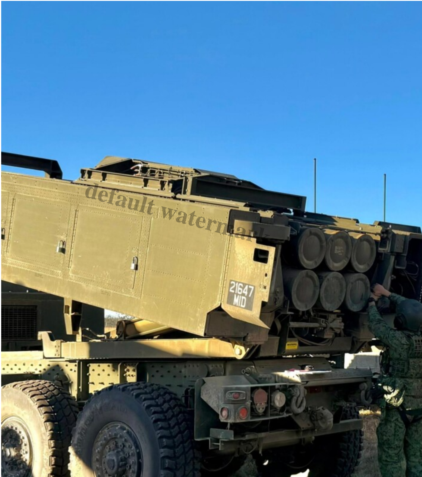
MINDEF photo of Singapore Army personnel preparing a HIMARS before live-firing during Exercise Talisman Sabre 2025.

For Singapore readers, the useful question is not simply whether the SAF live-firing exercises is happening, but how it changes the next decision you have to make. MINDEF says Pulau Sudong, Pulau Senang, Pulau Pawai and their surrounding waters are proclaimed live-firing areas during the