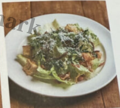
Caesar Salad Cos Lettuce, Smoked Bacon, Fried Parsley, Anchovy, Parmesan