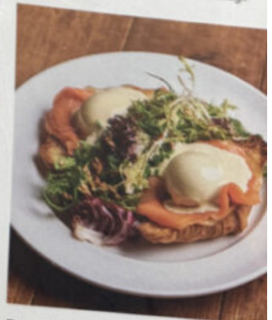
Eggs Benedict Toasted Croissant, Smoked Cheese, Mixed Greens with Balsamic Honey Almond Dressing. Meat of Choice: Smoked Salmon or Paris Ham