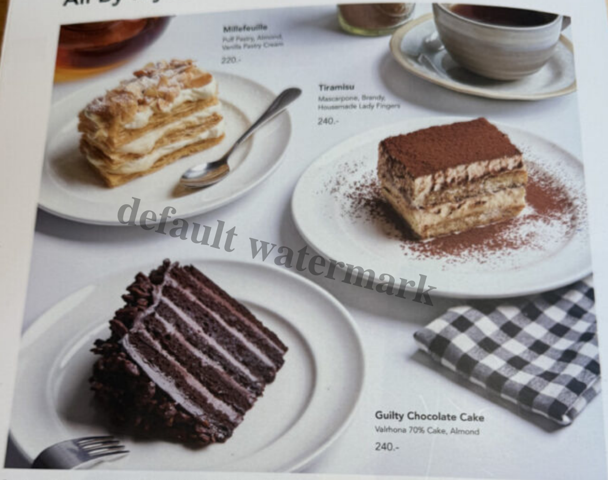
Millefeuille Full Pastry, Almond, Vanilla Pastry Cream 220.-