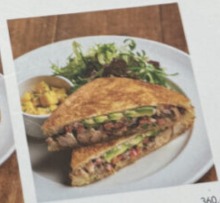
Jerk Chicken Jerk Spice, Salsa Criolla, Swiss Cheese, Chipotle Mayonnaise, Mango Salsa