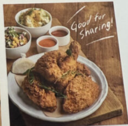
Fried Chicken (Half) Herbs, Garlic, Housemade Hot Sauce, Hot Honey, Red Cabbage Corn Slaw *Please allow 25 minutes for preparation