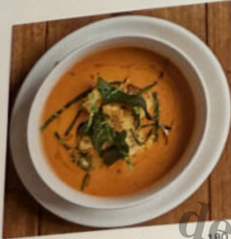
Roasted Tomato Soup (V) Oven Roasted Tomato, Garlic, Crouton, Basil