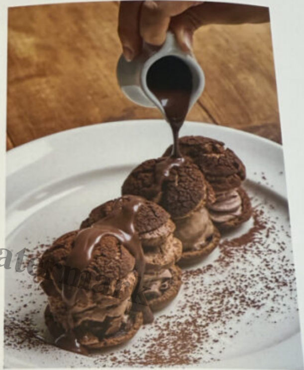
Chocolate Profiteroles Chocolate Ice Cream, Chocolate Cream, Fudge Sauce