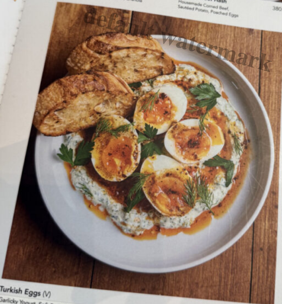
Turkish Eggs (V) Garlicky Yogurt, Soft Boiled Eggs, Chili Oil, Dill, Mint, Grilled Sourdough