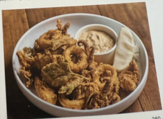
Calamari Zucchini, Caper Berry, Herbs, Harissa Mayonnaise