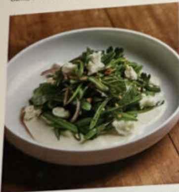
Snap Pea Salad (V) Buttermilk, Almond Vinaigrette, Ricotta Cheese, Almond