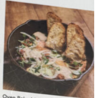
Oven Baked Eggs Tomato Sauce, Pork Patty, Harissa Greek Yogurt, Basil, Oregano, Fennel Salad, Grilled Sourdough