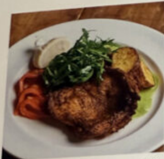
Peruvian Chicken Aji Verde, Roasted Potato, Marinated Bell Pepper