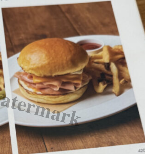
Fried Bologna Dijonnaise, American Cheese, Pickles