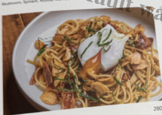
Bacon Garlic Spaghetti, Garlic, Basil, Dried Chili, Poached Egg