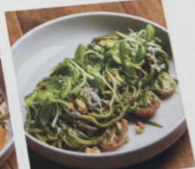
340.- Zucchini Pesto (V) Spaghetti, Walnut Basil Pesto, Walnut, Cherry Tomato, Sun Flower Sprout