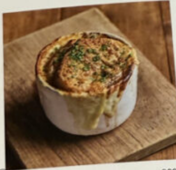
French Onion Soup Slow Caramelized Onion, Brown Chicken Stock, Port Wine, Gruyere, Mozzarella, Swiss Cheese