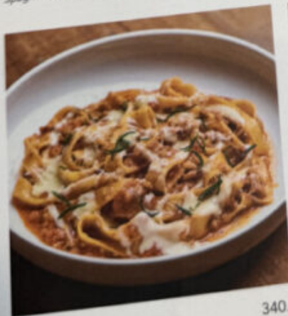
Bolognese Fresh Fettuccine, Fontina Fondue, Pork Belly & Shoulder, Pecorino