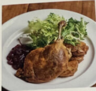
Duck Confit Potato Lyonnaise, Sour Cream, Cranberry Sauce