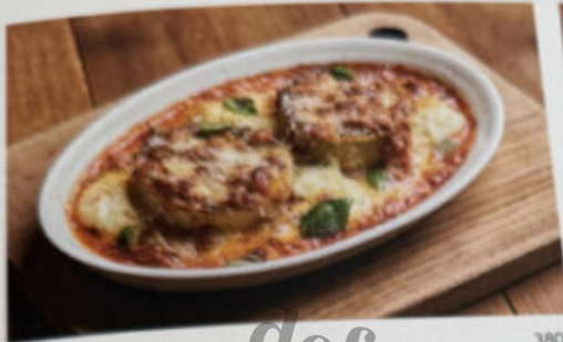
Rotolo (V) Mushroom, Spinach, Ricotta, Marinara