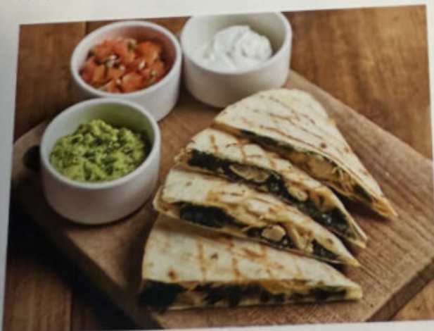
Quesadilla Chicken & Spinach, Cheddar Cheese, Guacamole, Sour Cream, Tomato Salsa