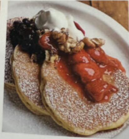
Berries Buttermilk Pancake Blueberry, Strawberry Compote, Vanilla Whipped Cream, Walnut