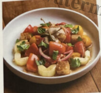
Panzanella Mixed Seasonal Tomato, Red Wine Vinaigrette, Cucumber, Roasted Bell Pepper, Anchovy Mayo