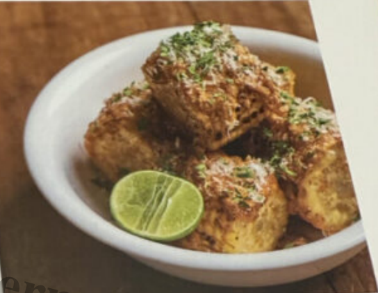
Grilled Corn (V) Chili Mayonnaise, Parmesan, Cilantro, Lime