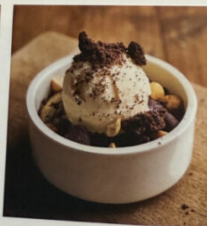
Half-Baked Malted Cookie Dough, Macadamia, Brownie, Vanilla Ice Cream