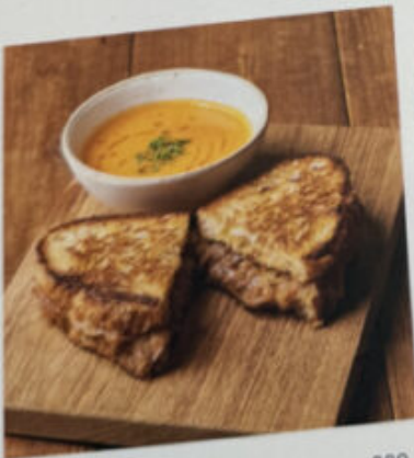
French Onion Grilled Cheese (V) Swiss, Gruyere, Mozzarella, Port Wine, Sourdough Served with a Side of Tomato Soup