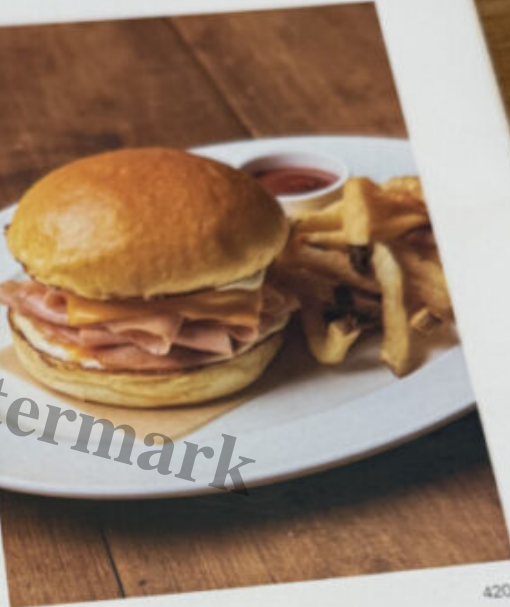
Fried Bologna Dijonnaise, American Cheese, Pickles