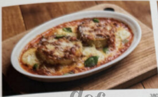
Rotolo (V) Mushroom, Spinach, Ricotta, Marinara