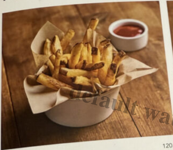
The OG House Fries (V)