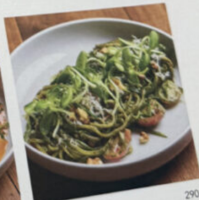
Zucchini Pesto (V) Spaghetti, Walnut Basil Pesto, Walnut, Cherry Tomato, Sun Flower Sprout