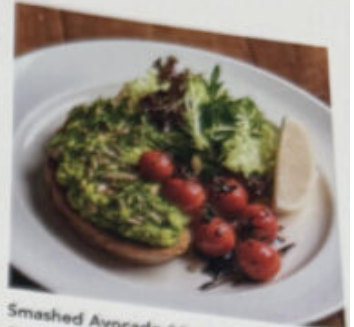
Smashed Avocado (V) Country Rye Bread, Seeds, Balsamic Roasted Tomato