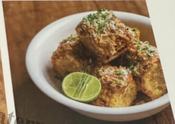
120.- Grilled Corn (V) Chili Mayonnaise, Parmesan, Cilantro, Lime