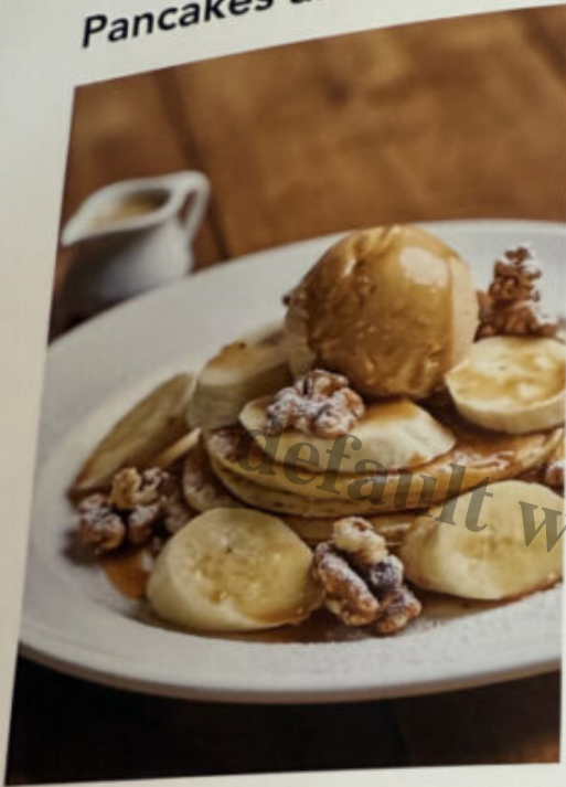
Banana Pancake Peanut Butter Ice Cream, Walnut, Butterscotch