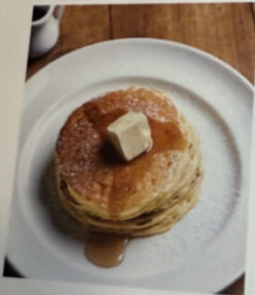
Classic Buttermilk Pancake Served with Butter & Syrup Add Bacon (+60.-)