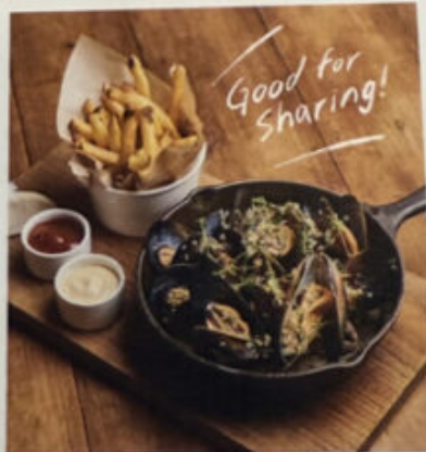
Mussel Pot White Wine or Cream Sauce, Served with the OG Fries, Garlic Aioli *Please allow 25 minutes for preparation