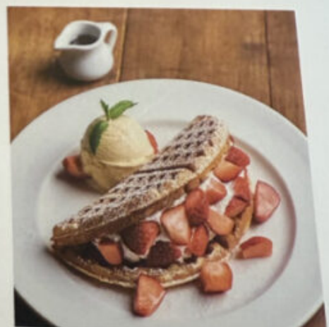
Strawberry Waffle Whipped Cream, Vanilla Ice Cream