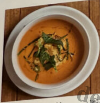
Roasted Tomato Soup (V) Oven Roasted Tomato, Garlic, Crouton, Basil