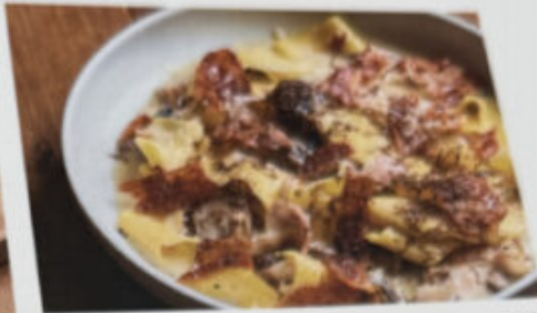
380.- Truffle Alfredo Fresh Tagliatelle, Crispy Bacon, Mushroom, Parmesan