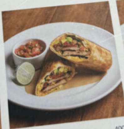
Burrito Fajitas Pork, Mexican Rice, Avocado Salsa, Pepperonata, Cheddar, Sour Cream