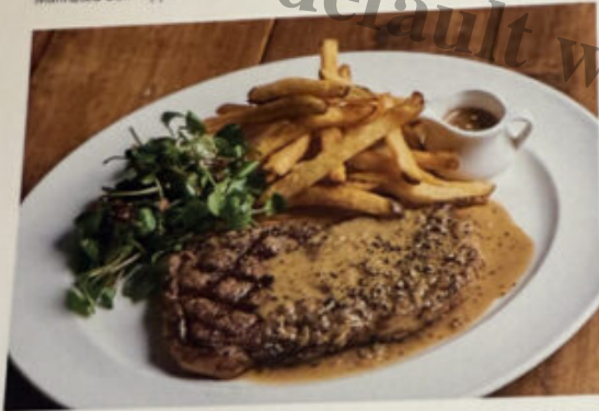
Steak Frites Sauce Au Poivre, Watercress