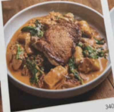
340.- Gnocchi Chicken Pan Roasted Chicken, Kale, Sun Dried Tomato, Parmesan