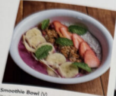
Smoothie Bowl (V) Chia Seed Pudding, Berries & Banana Smoothie, Peanut Butter Yogurt, Granola