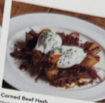
Corned Beef Hash Housemade Corned Beef, Sautéed Potato, Poached Eggs