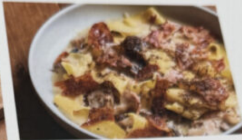
Truffle Alfredo Fresh Tagliatelle, Crispy Bacon, Mushroom, Parmesan