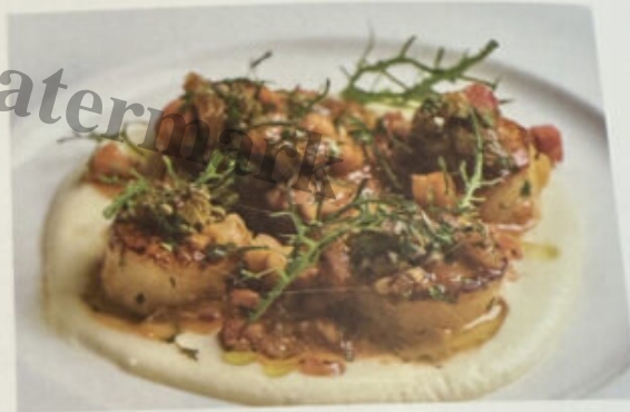
Pan Roasted Scallops Honey Bacon Vinaigrette, Cauliflower Purée, Golden Raisin Salsa Verde, Mustard Green