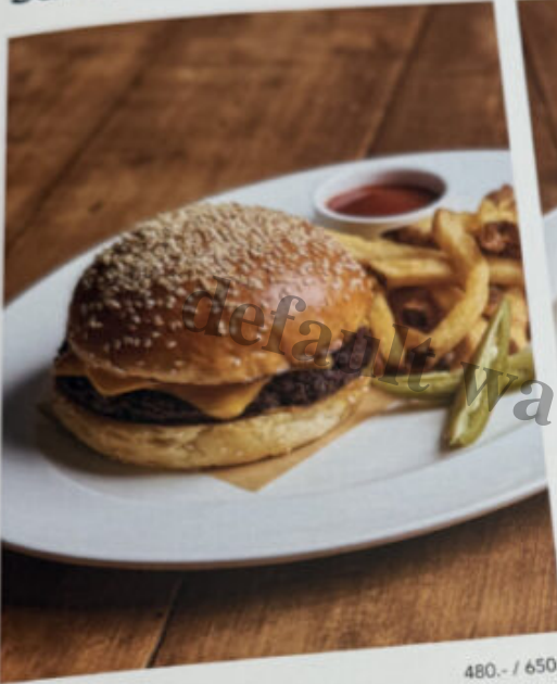
Roast Burger Single Cheese Burger / Double Cheese Burger Add Fried Egg (+40.-) Add Crispy Bacon (+60.-)