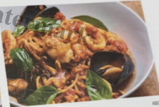
Vodka Arrabiata Spaghetti, Market Seafood, Vodka, Tomato Sauce, Dried Chili