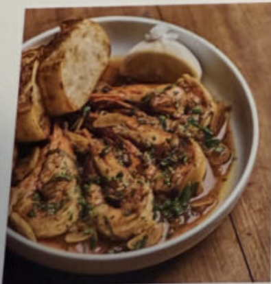
Garlic Prawns Paprika, Garlic, Chili Flakes, Herbs