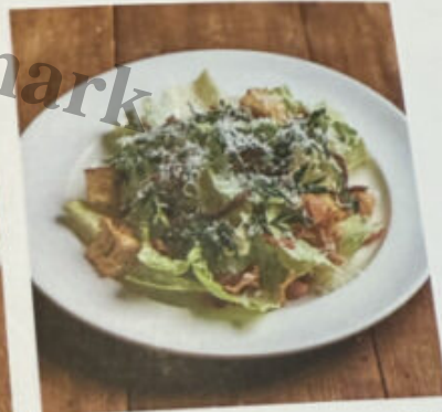
Caesar Salad Cos Lettuce, Smoked Bacon, Fried Parsley, Anchovy, Parmesan