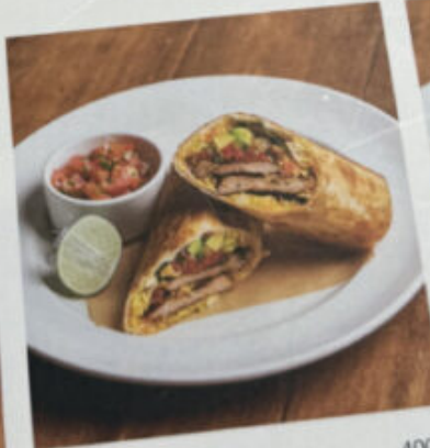
Burrito Fajitas Pork, Mexican Rice, Avocado Salsa, Pepperonata, Cheddar, Sour Cream