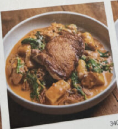
Gnocchi Chicken Pan Roasted Chicken, Kale, Sun Dried Tomato, Parmesan