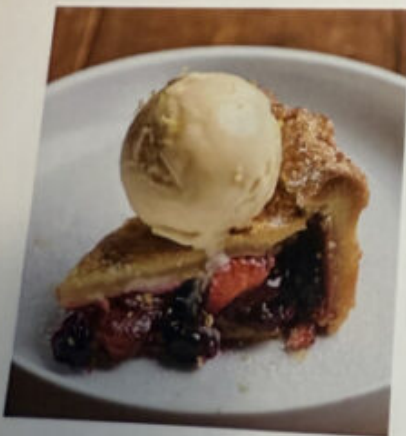
Berry Pie Strawberry, Raspberry, Mascarpone Ice Cream