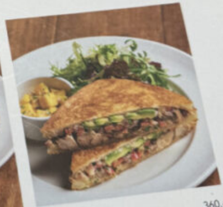
Jerk Chicken Jerk Spice, Salsa Criolla, Swiss Cheese, Chipotle Mayonnaise, Mango Salsa