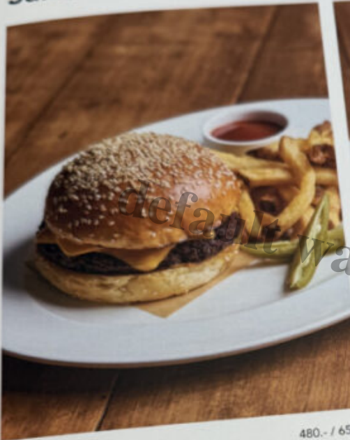
Roast Burger Single Cheese Burger / Double Cheese Burger Add Fried Egg (+40.-) Add Crispy Bacon (+60.-)