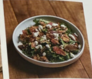
Kale Salad Smoked Bacon, Mushroom, Goat Cheese, Caramelized Onion, Balsamic Dressing