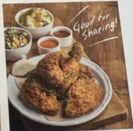
Fried Chicken (Half) Herbs, Garlic, Housemade Hot Sauce, Hot Honey, Red Cabbage Corn Slaw *Please allow 25 minutes for preparation