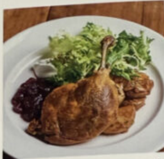
Duck Confit Potato Lyonnaise, Sour Cream, Cranberry Sauce