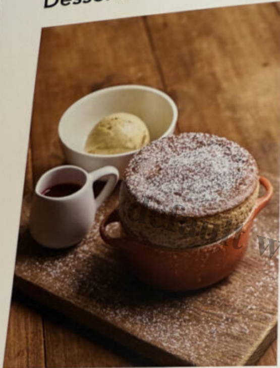
Raspberry Soufflé Pistachio Ice Cream, Raspberry Sauce