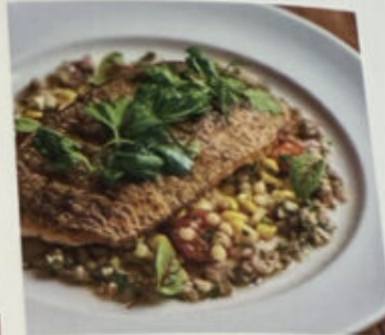
Seabass Grilled Corn with Fregola Salad, Salmoriglio