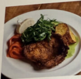
Peruvian Chicken Aji Verde, Roasted Potato, Marinated Bell Pepper