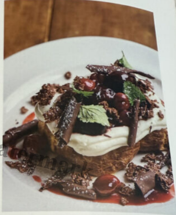
Black Forest French Toast Brioche, Mascarpone, Cherry Compote