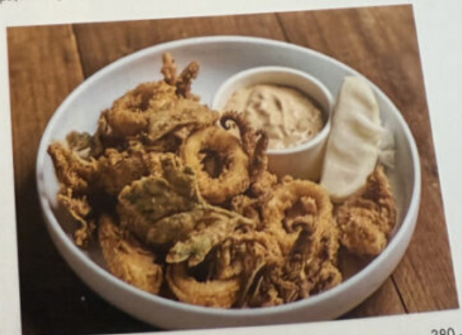
Calamari Zucchini, Caper Berry, Herbs, Harissa Mayonnaise