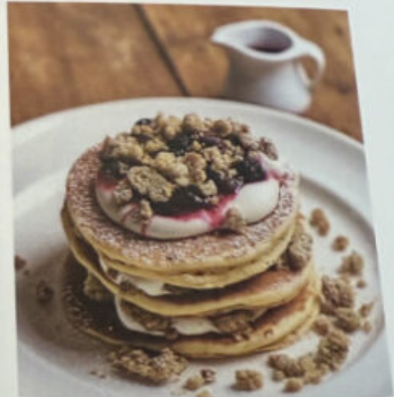
Blueberry Ricotta Pancake Cream Cheese, Blueberry Sauce, Earl Grey Crumble, Lemon