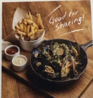
Mussel Pot White Wine or Cream Sauce, Served with the OG Fries, Garlic Aioli *Please allow 25 minutes for preparation