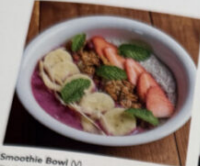
Smoothie Bowl (V) Chia Seed Pudding, Berries & Banana Smoothie, Peanut Butter Yogurt, Granola