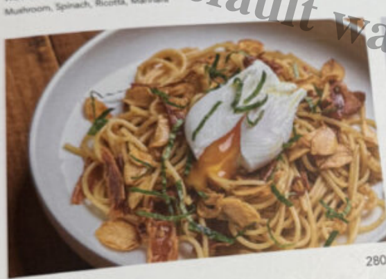
Bacon Garlic Spaghetti, Garlic, Basil, Dried Chili, Poached Egg