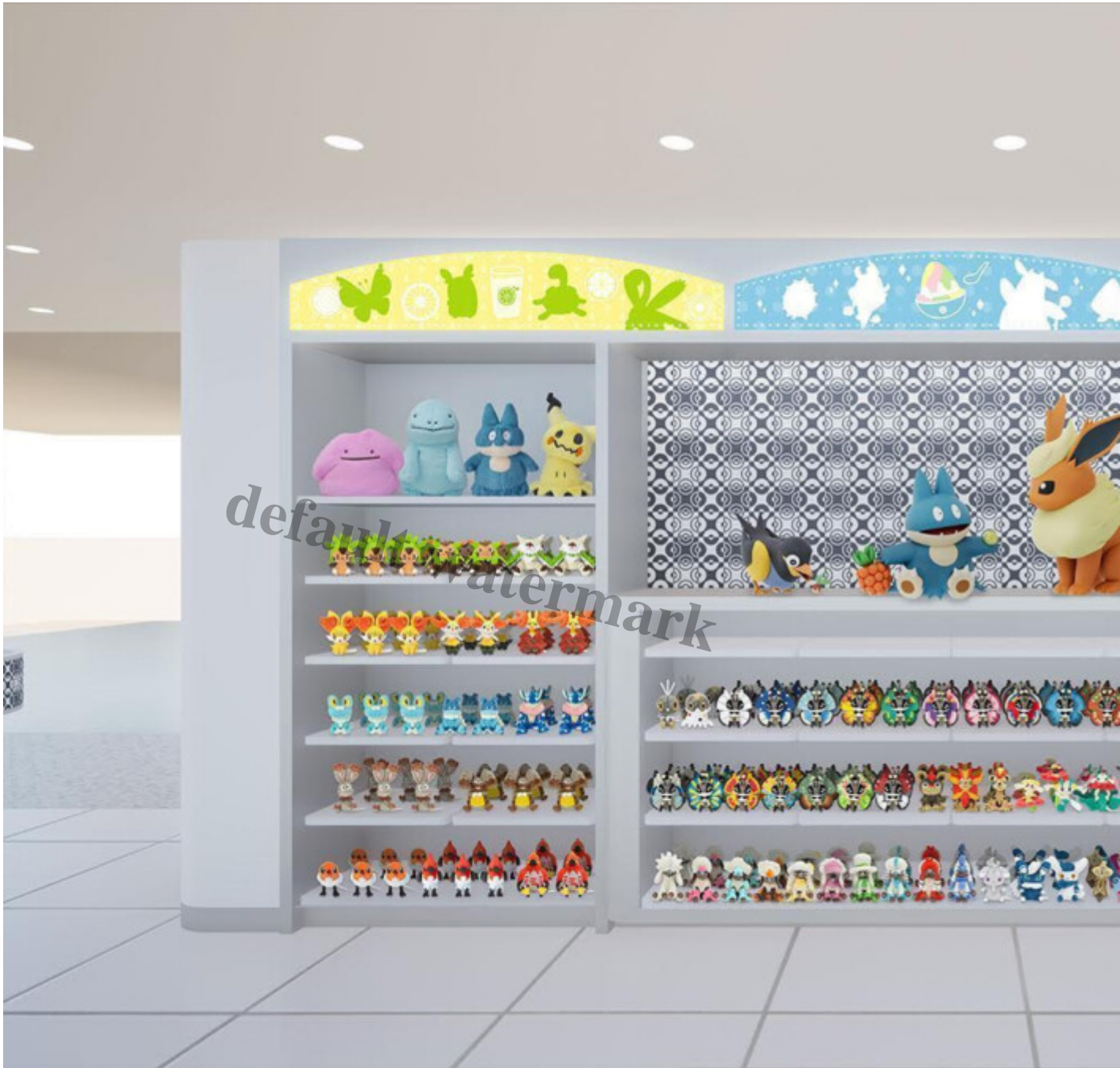
The food court-inspired area inside the store. Image: Pok mon Singapore

One standout feature is a dedicated area inspired by Singapore’s beloved food court culture – a clever nod to one of the things that makes this city truly special. There’s also a spectacular ocean-themed event space featuring Vaporeon, the Water Type Pok mon.