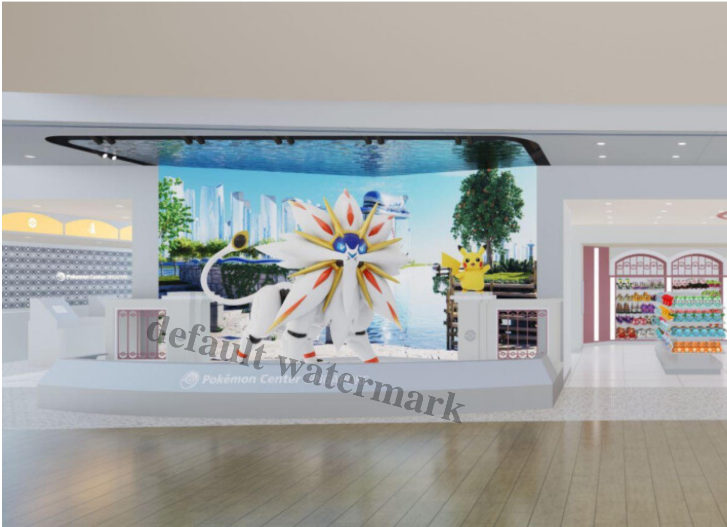
The newly revitalised Pok mon Center SINGAPORE. Image: Pok mon Singapore