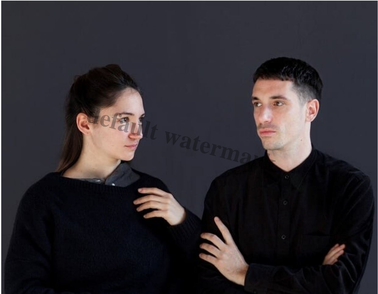
T.H.E Dance Company in Elusive .

Each work unfolds from a precise line of inquiry, exploring different ways the body can hold memory, sensation, and time. In Carillon , meticulous patterns gather force as cycles slip and falter â?? questioning what happens when reassurance begins to destabilise.