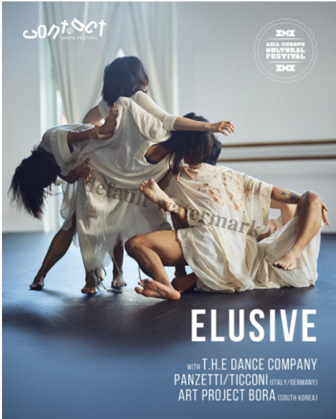
Elusive at cont-act Dance Festival 2026.