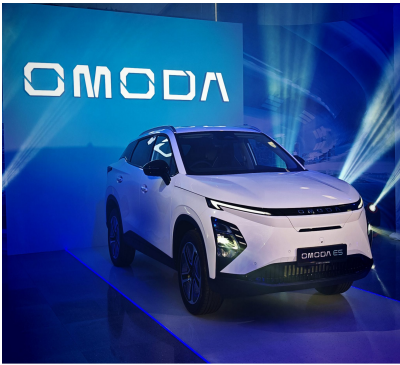
HONOR Magic6 Pro