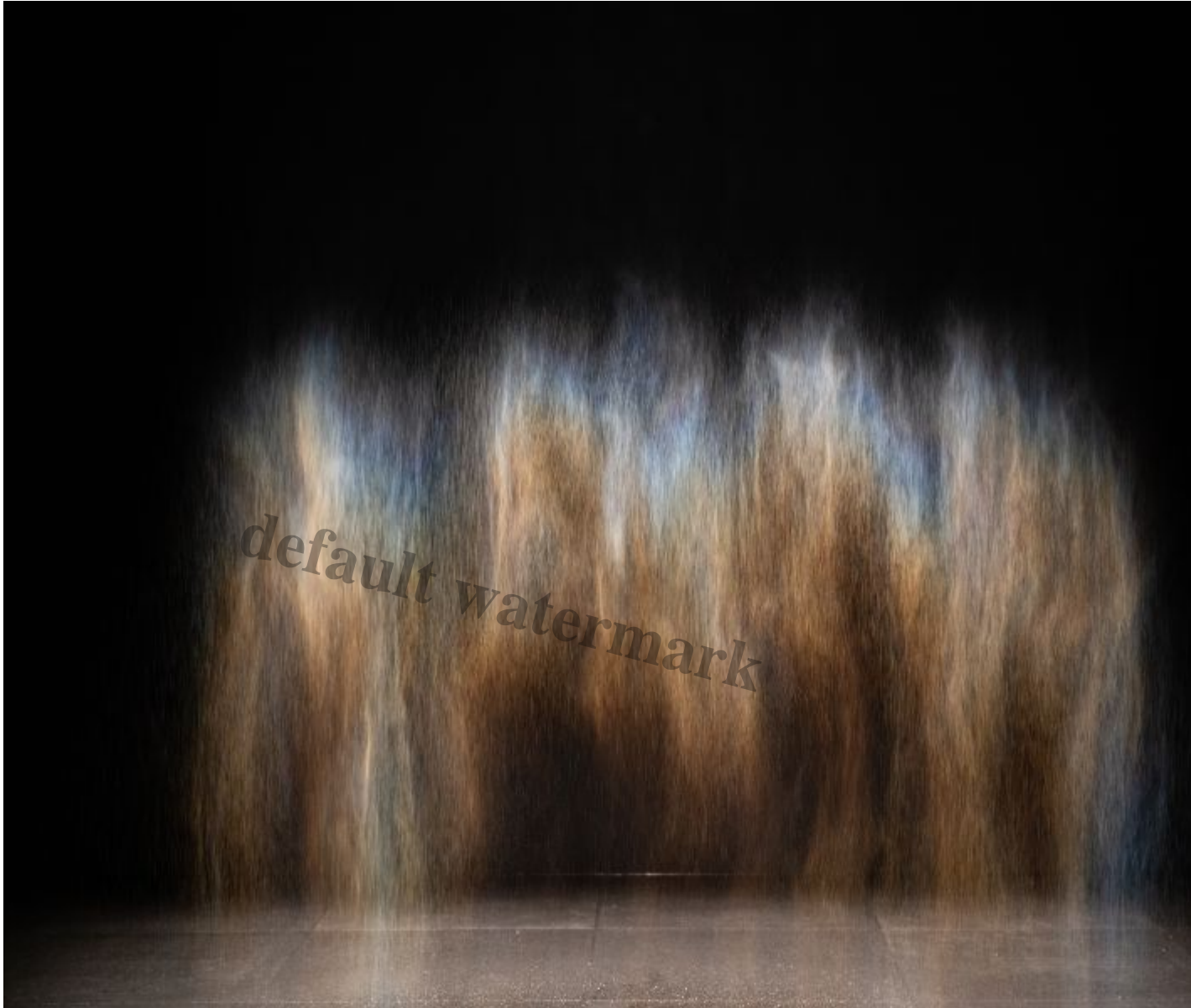
Installation view of Olafur Eliasson's Beauty (1993), as part of Olafur Eliasson: Your journey at SAM at Tanjong Pagar Distripark; Photo: Joseph Nair, Memphis West Pictures; Image © the artist and Singapore Art Museum; © 1993 Olafur Eliasson

From the moment they step into Level 1 of SAM at Tanjong Pagar Distripark, visitors will be immediately greeted by Yellow corridor (1997). A row of mono-frequency yellow lights illuminates the passageway of Galleries 1 and 2, inviting an uncanny somatic experience of the space where one's visual spectrum of colours is desaturated and washed in shades of grey. Notably, the work represents Eliasson's interest in co-creation with his audiences, where their unique first-person perspective completes the experience of the work. Beauty (1993), one of his most iconic works on display, epitomises Eliasson's interest in challenging our awareness of our perception, as well as emphasising our unique, subjective experiences. In the work, a fine sheet of mist is illuminated by a singular spotlight in a darkened space, and when viewed at just the right angle, a prismatic reflection of light reveals itself as a luminous rainbow. As light is refracted and reflected on the water droplets differently, no two viewers see the same rainbow. Bringing into focus the role of the viewer and the very act of perception and experience of seeing, the work begs the question: Does the rainbow exist