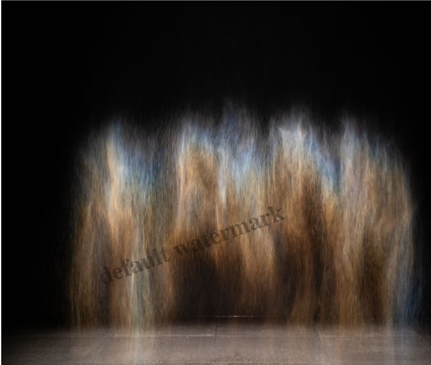
Installation view of Olafur Eliasson's 'Beauty' (1993), as part of 'Olafur Eliasson: Your curious journey' at the Singapore Art Museum, Tanjong Pagar Distripark; Photo: Joseph Nair, Memphis West Pictures; Image courtesy of the artist and the Singapore Art Museum; © 1993 Olafur Eliasson

From the moment they step into Level 1 of SAM at Tanjong Pagar Distripark, visitors will be immediately greeted by Yellow corridor (1997). A row of mono-frequency yellow lights illuminates the passageway of Galleries 1 and 2, inviting an uncanny somatic experience of the space where one's visual spectrum of colours is desaturated and washed in shades of grey. Notably, the work represents Eliasson's interest in co-creation with his audiences, where their unique first-person perspective completes the experience of the work. Beauty (1993), one of his most iconic works on display, epitomises Eliasson's interest in challenging our awareness of our perception, as well as emphasising our unique, subjective experiences. In the work, a fine sheet of mist is illuminated by a singular spotlight in a darkened space, and when viewed at just the right angle, a prismatic reflection of light reveals itself as a luminous rainbow. As light is refracted and reflected on the water droplets differently, no two viewers see the same rainbow. Bringing into focus the role of the viewer and the very act of