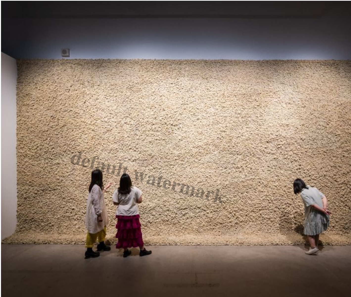
Installation view of Olafur Eliasson's Moss wall (1994), as part of Olafur Eliasson: Your journey at SAM at Tanjong Pagar Distripark; Photo: Joseph Nair, Memphis West Pictures; Image © the artist and Singapore Art Museum; © 1994 Olafur Eliasson

Many artworks displayed in the exhibition also reflect Eliasson's deep engagement with the places and ecological systems in which we exist. Drawing from his connection with Iceland, Moss wall (1994) sees reindeer cup lichen ( Cladonia rangiferina ) woven into a wire mesh that blankets an entire gallery wall. Also known colloquially as reindeer moss , it covers immense areas in northern tundra and taiga ecosystems. The living and breathing wall disrupts an otherwise homogeneous museum space, collapsing the boundaries between interior and exterior by bringing one of nature's great wonders directly to audiences in tropical Singapore.