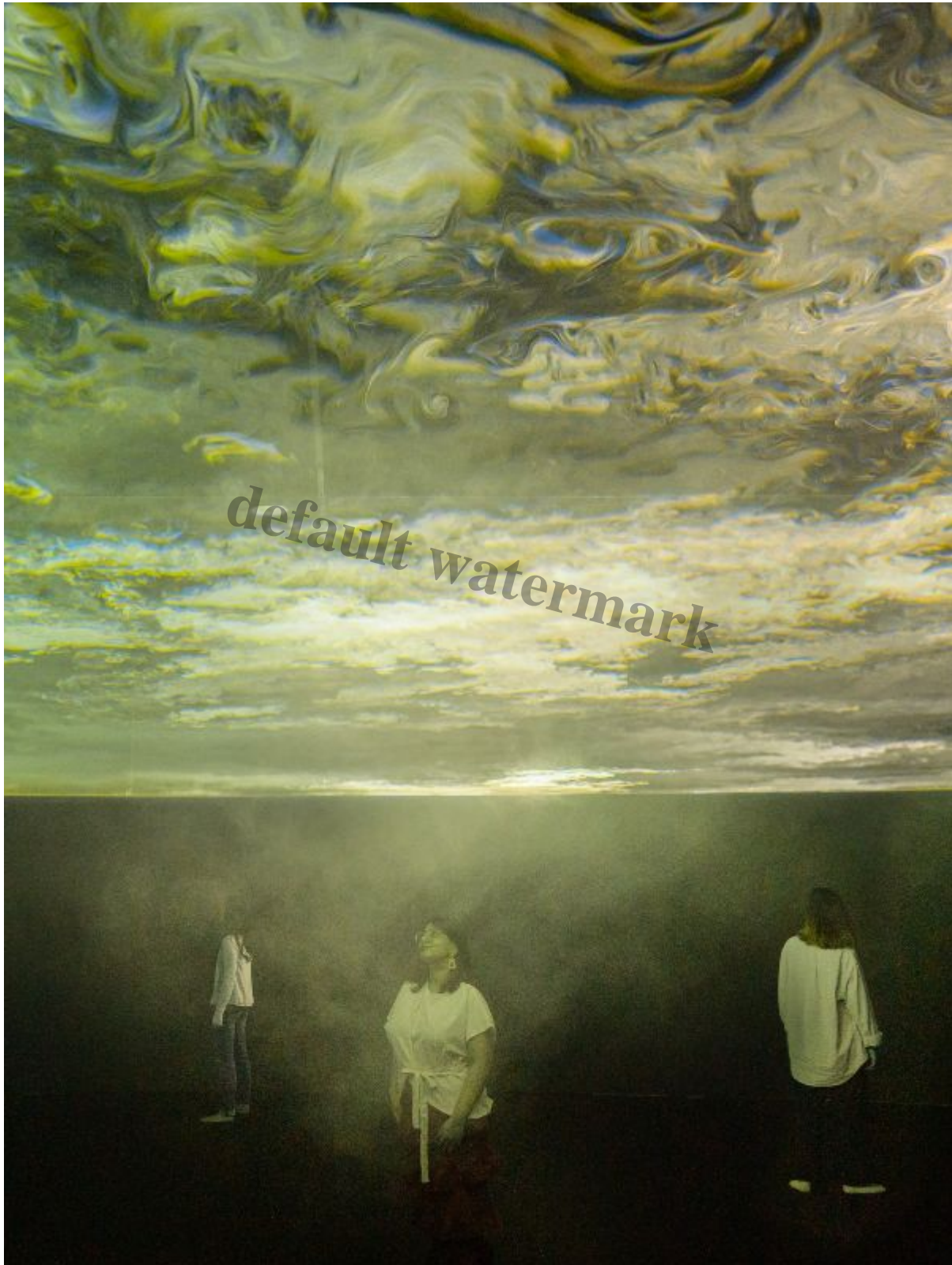
Installation view of Olafur Eliasson's Symbiotic seeing (2020), as part of Olafur Eliasson: Your curious journey at SAM at Tanjong Pagar Distripark; Photo: Joseph Nair, Memphis West Pictures; Image courtesy of the artist and Singapore Art Museum; © 2020 Olafur Eliasson