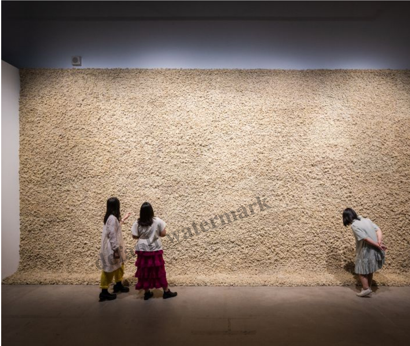
Installation view of Olafur Eliasson's 'Moss wall' (1994), as part of 'Olafur Eliasson: Your curious journey' at SAM at Tanjong Pagar Distripark; Photo: Joseph Nair, Memphis West Pictures; Image courtesy of the Singapore Art Museum; © 1994 Olafur Eliasson

Many artworks displayed in the exhibition also reflect Eliasson's deep engagement with the places and ecological systems in which we exist. Drawing from his connection with Iceland, Moss wall (1994) sees reindeer cup lichen ( Cladonia rangiferina ) woven into a wire mesh that blankets an entire gallery wall. Also known colloquially as "reindeer moss," it covers immense areas in northern tundra and taiga ecosystems. The living and breathing wall disrupts an otherwise homogeneous museum space, collapsing the boundaries between interior and exterior by bringing one of nature's great wonders directly to audiences in tropical Singapore.