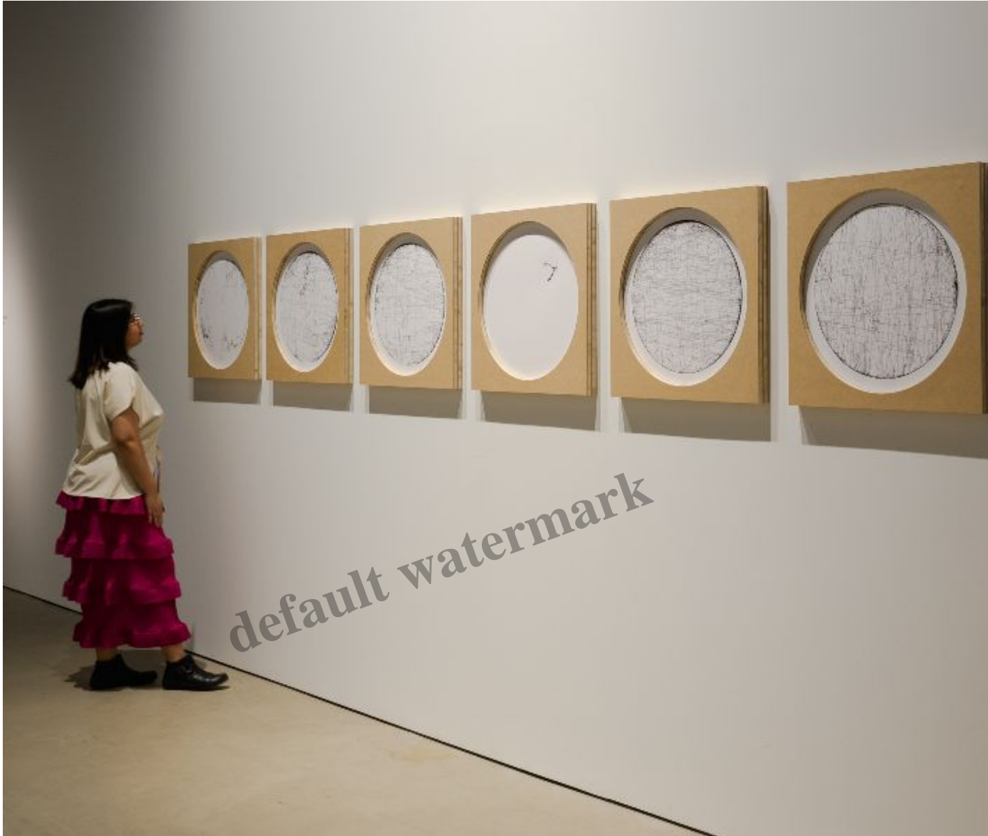
Installation view of Olafur Eliasson's 'The seismographic testimony of distance (Berlin Singapore, no. 1 to no. 6) (2024), as part of 'Olafur Eliasson: Your curious journey' at SAM at Tanjong Pagar Distripark; Photo: Nair, Memphis West Pictures; Image courtesy of the artist and Singapore Art Museum; ©2024 Olafur Eliasson

Through two brand new, never-before-seen works The last seven days of glacial ice (2024) and The seismographic testimony of distance (Berlin–Singapore, no. 1 to no. 6) (2024), Eliasson also prompts visitors to reflect on pertinent environmental concerns and the ongoing climate catastrophe. In The last seven days of glacial ice (2024), a fragment of ice from a nearby glacier at Diamond Beach in the south of Iceland was visualised in its various stages of melting. A bronze cast representing each stage is paired with a clear orb of glass — a volumetric representation of water that was lost — conjuring an evocative image of its steady degradation and loss that stresses the urgency of climate action.