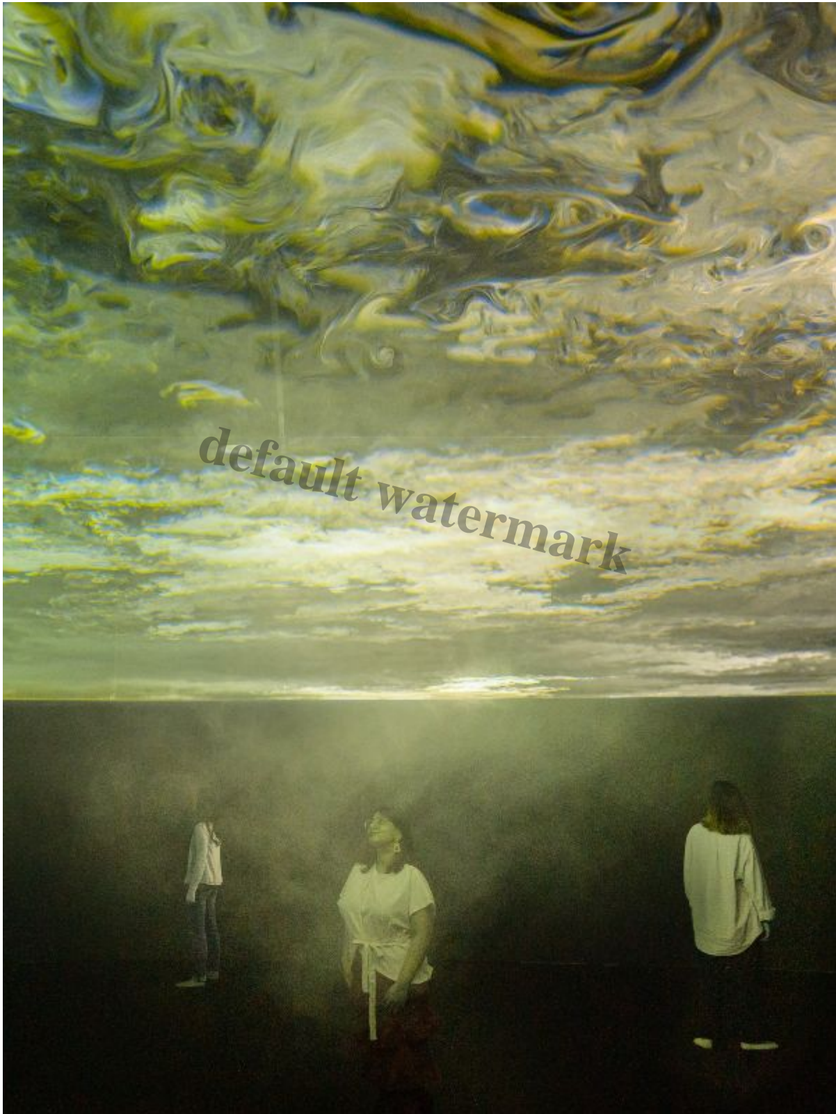
Installation view of Olafur Eliasson's "Symbiotic seeing" (2020), as part of "Olafur Eliasson: Your curious journey" at SAM at Tanjong Pagar Distripark; Photo: Joseph Nair, Memphis West Pictures; Image courtesy of the artist and Singapore Art Museum; © 2020 Olafur Eliasson