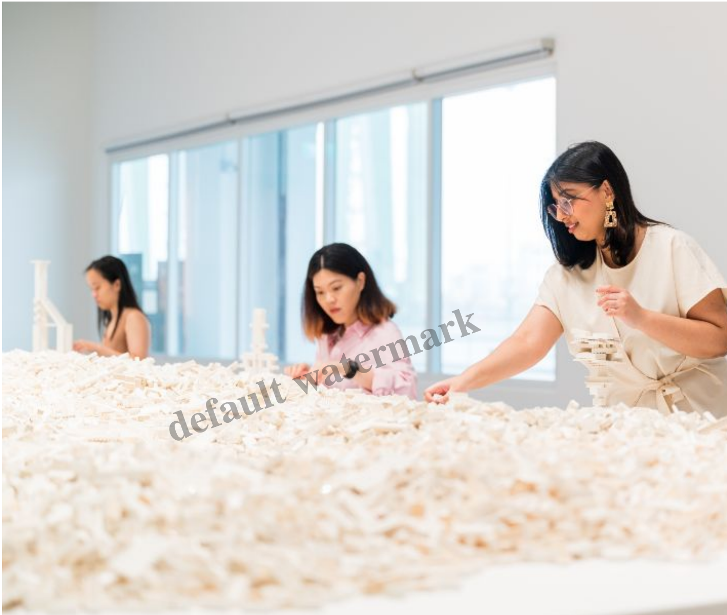
Installation view of Olafur Eliasson's 'The cubic structural evolution project' (2004), as part of 'Olafur Your curious journey' at SAM at Tanjong Pagar Distripark

perception and experience of seeing, the work begs the question: Does the rainbow exist independently, or does it exist because we perceive it?