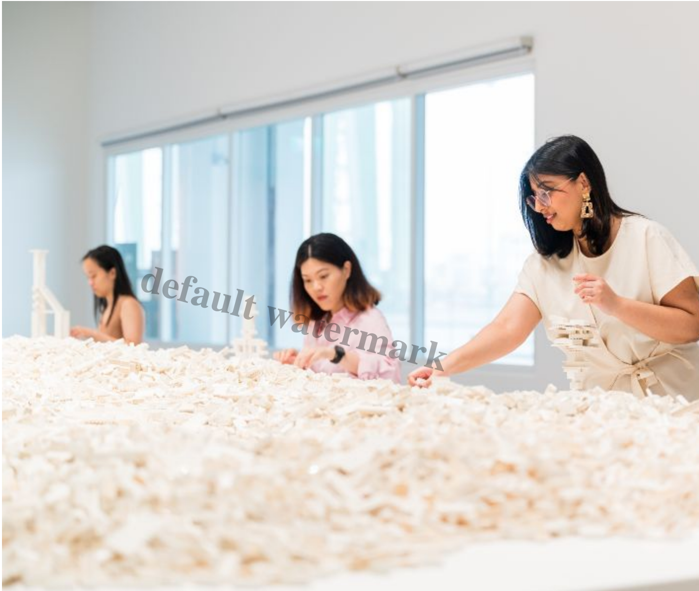
Installation view of Olafur Eliasson's The cubic structural evolution project (2004), as part of Eliasson: Your curious journey at SAM at Tanjong Pagar Distripark; Photo: Joseph Nair, Memphis Pictures; Image courtesy of the artist and Singapore Art Museum; © 2004 Olafur Eliasson

independently, or does it exist because we perceive it?