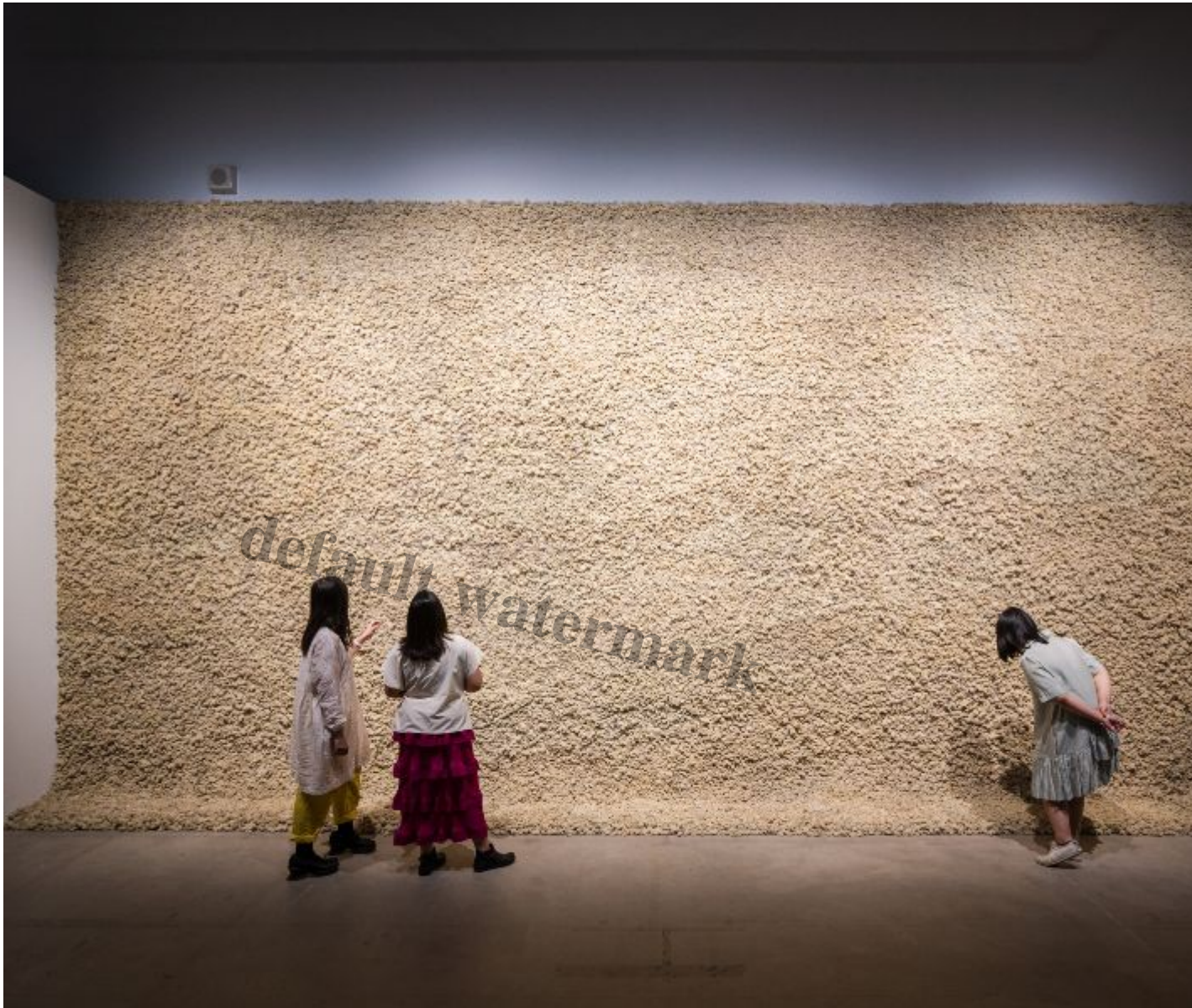
Installation view of Olafur Eliasson's Moss wall (1994), as part of Olafur Eliasson: Your journey at SAM at Tanjong Pagar Distripark; Photo: Joseph Nair, Memphis West Pictures; Image © the artist and Singapore Art Museum; © 1994 Olafur Eliasson

Many artworks displayed in the exhibition also reflect Eliasson's deep engagement with the places and ecological systems in which we exist. Drawing from his connection with Iceland, Moss wall (1994) sees reindeer cup lichen ( Cladonia rangiferina ) woven into a wire mesh that blankets an entire gallery wall. Also known colloquially as "reindeer moss," it covers immense areas in northern tundra and taiga ecosystems. The living and breathing wall disrupts an otherwise homogeneous museum space, collapsing the boundaries between interior and exterior by bringing one of nature's great wonders directly to audiences in tropical Singapore.