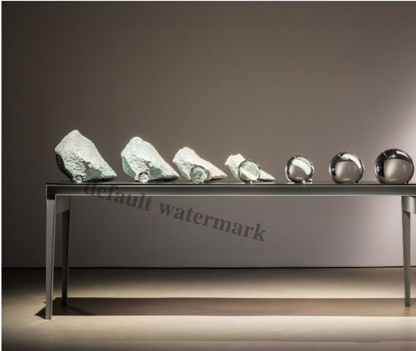
Installation view of Olafur Eliasson's "The last seven days of glacial ice" (2024), as part of "Olafur Eliasson: Your curious journey" at SAM at Tanjong Pagar Distripark; Photo: Joseph Nair, Memphis Pictures; Image courtesy of the artist and Singapore Art Museum; © 2024 Olafur Eliasson