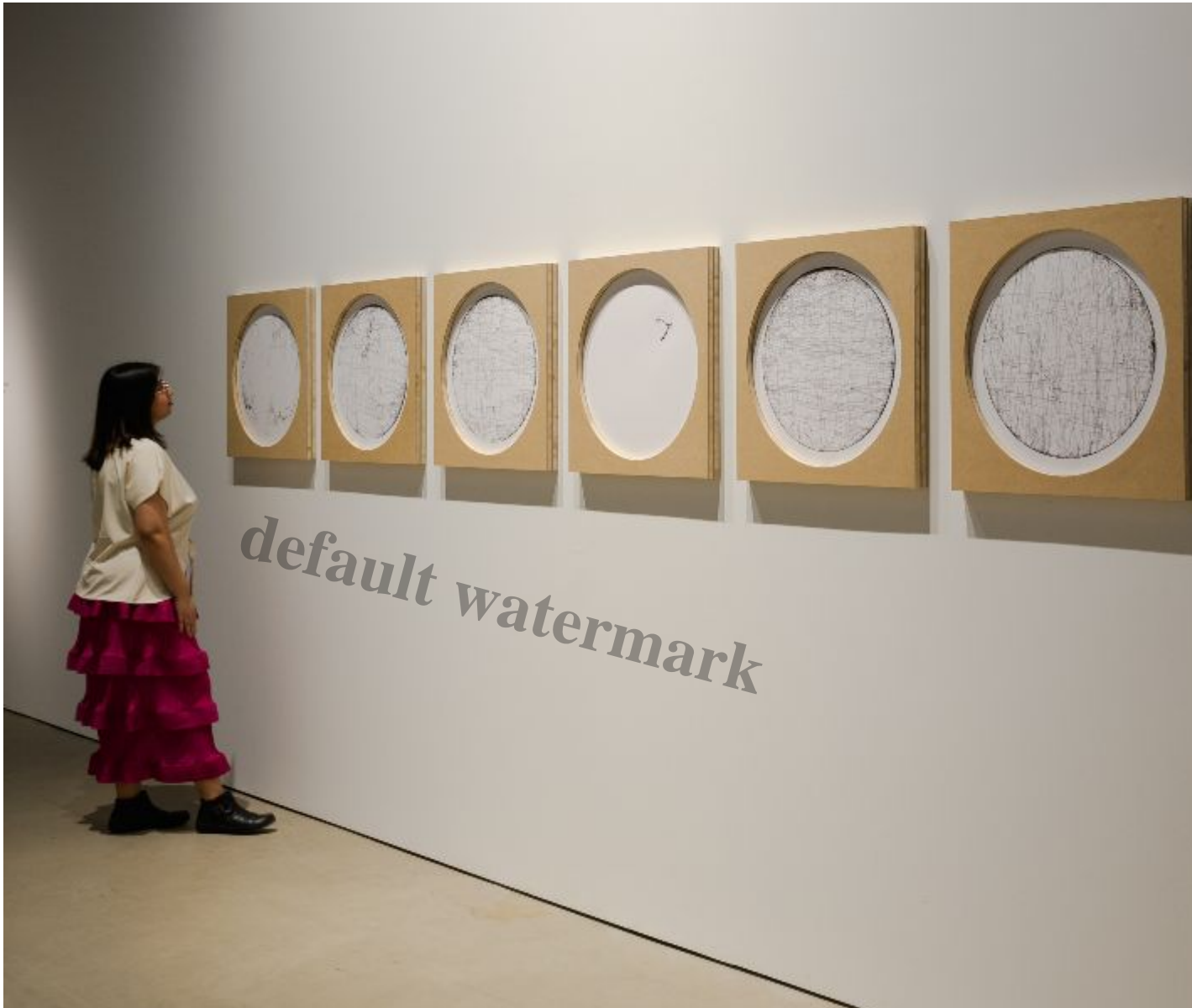
Installation view of Olafur Eliasson's The seismographic testimony of distance (Berlin Singapore, no. 6) (2024), as part of Olafur Eliasson: Your curious journey at SAM at Tanjong Pagar Museum. Olafur Eliasson

Through two brand new, never-before-seen works The last seven days of glacial ice (2024) and The seismographic testimony of distance (Berlin/Singapore, no. 1 to no. 6) (2024), Eliasson also prompts visitors to reflect on pertinent environmental concerns and the ongoing climate catastrophe. In The last seven days of glacial ice (2024), a fragment of ice from a nearby glacier at Diamond Beach in the south of Iceland was visualised in its various stages of melting. A bronze cast representing each stage is paired with a clear orb of glass – a volumetric representation of water that was lost – conjuring an evocative image of its steady degradation and loss that stresses the urgency of climate action.