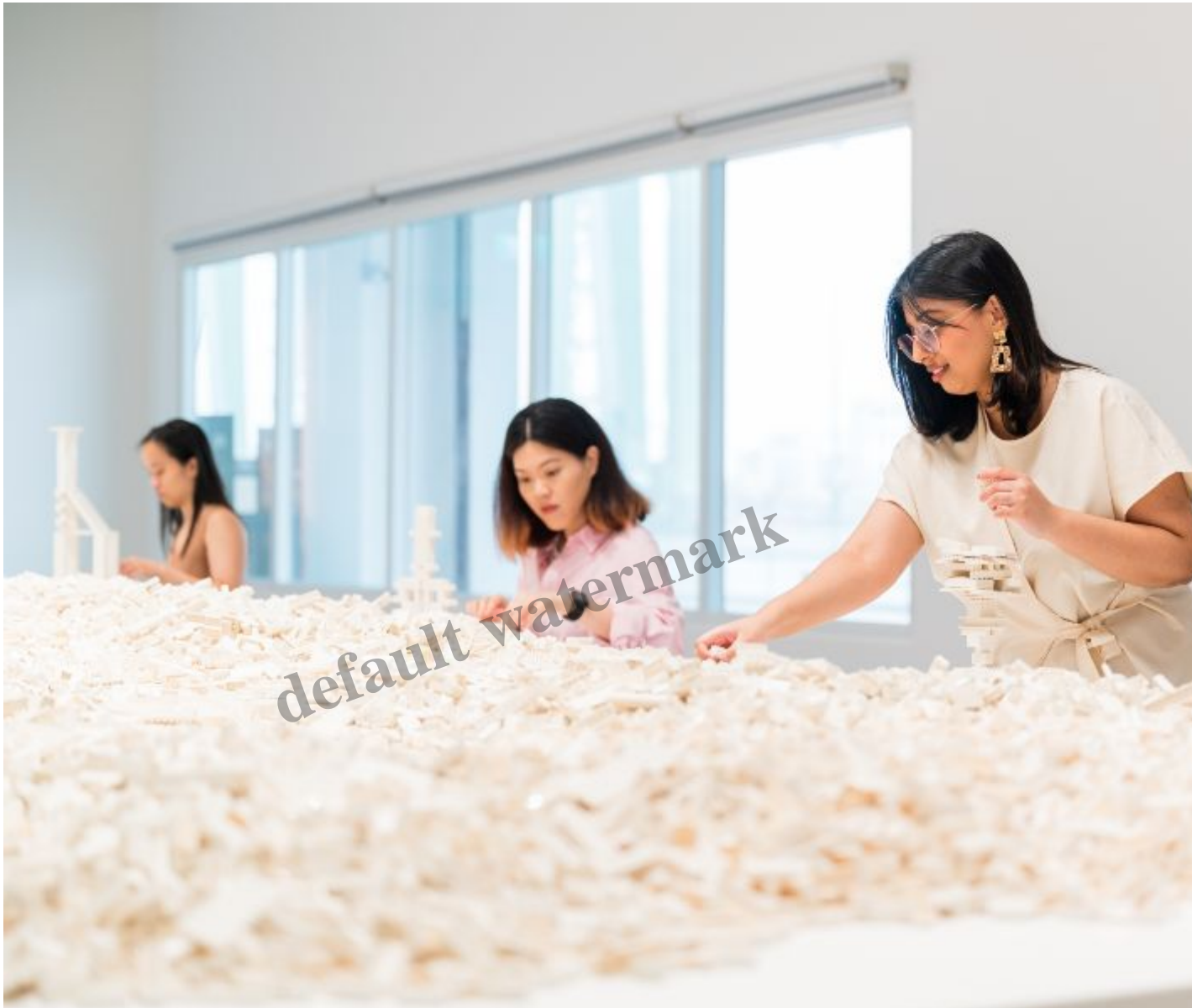
Installation view of Olafur Eliasson's "The cubic structural evolution project" (2004), as part of "Olafur Eliasson: Your curious journey" at SAM at Tanjong Pagar Distripark

perception and experience of seeing, the work begs the question: Does the rainbow exist independently, or does it exist because we perceive it?