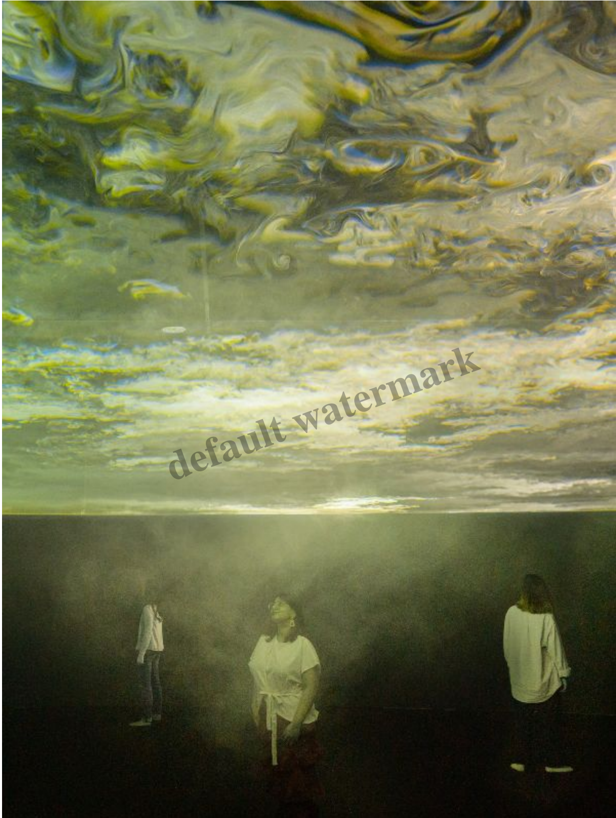
Installation view of Olafur Eliasson's 'Symbiotic seeing' (2020), as part of 'Olafur Eliasson: Your curious journey' at SAM at Tanjong Pagar Distripark; Photo: Joseph Nair, Memphis West Pictures; Image courtesy of the artist and Singapore Art Museum; © 2020 Olafur Eliasson