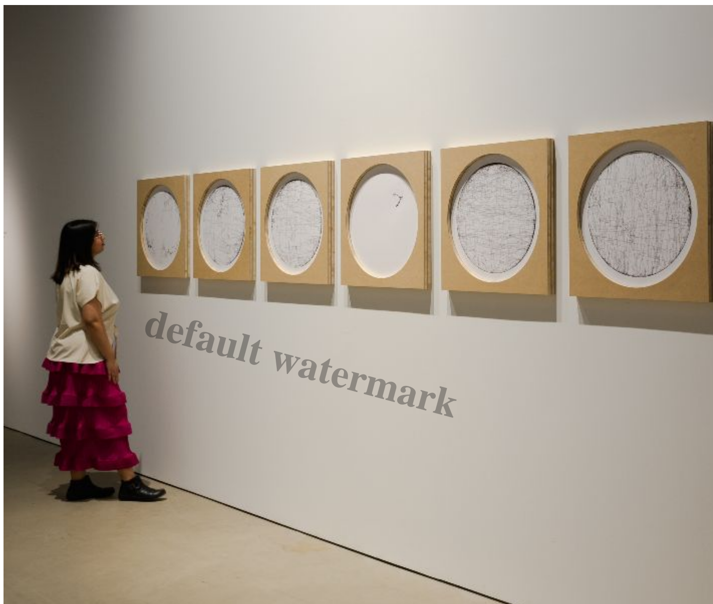
Installation view of Olafur Eliasson's The seismographic testimony of distance (Berlin Singapore, no. 6) (2024), as part of Olafur Eliasson: Your curious journey at SAM at Tanjong Pagar Museum. Olafur Eliasson

Through two brand new, never-before-seen works The last seven days of glacial ice (2024) and The seismographic testimony of distance (Berlin/Singapore, no. 1 to no. 6) (2024), Eliasson also prompts visitors to reflect on pertinent environmental concerns and the ongoing climate catastrophe. In The last seven days of glacial ice (2024), a fragment of ice from a nearby glacier at Diamond Beach in the south of Iceland was visualised in its various stages of melting. A bronze cast representing each stage is paired with a clear orb of glass – a volumetric representation of water that was lost – conjuring an evocative image of its steady degradation and loss that stresses the urgency of climate action.