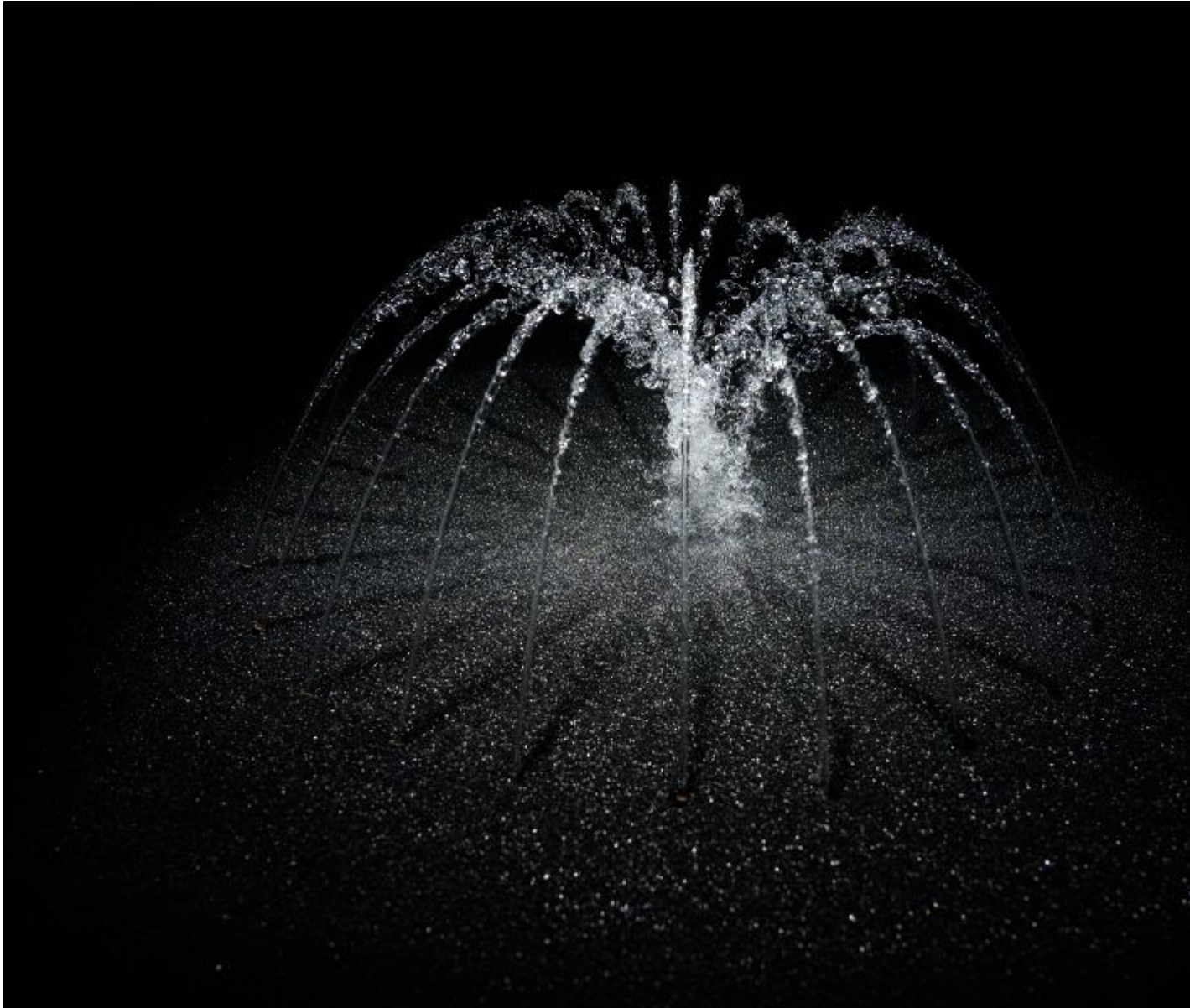
Installation view of Olafur Eliasson's 'Object defined by activity (then)' (2009), as part of 'Olafur Eliasson: A curious journey' at SAM at Tanjong Pagar Distripark

The exhibition also explores Eliasson's use of ephemeral and intangible materials such as light, wind, fog and water to conjure evanescent phenomena, allowing visitors to experience invisible elements of our surroundings palpably. In Symbiotic seeing (2020), the other Singapore-exclusive work, coloured laser lights come into contact with periodically released fog to create a captivating marvel that appears to occupy a liminal space between physical states. As ripples and currents of fog swirl above our heads, flowing along with our movements within the space, we become directly involved in the production of our surroundings, personally and communally. Similarly, in Object defined by activity (then) (2009), strobe lights flicker ceaselessly in rapid succession, illuminating a water feature in a pitch-dark space for a mere fraction of a second at a time, creating the illusion of water being frozen in time in a series of still, fleeting frames.