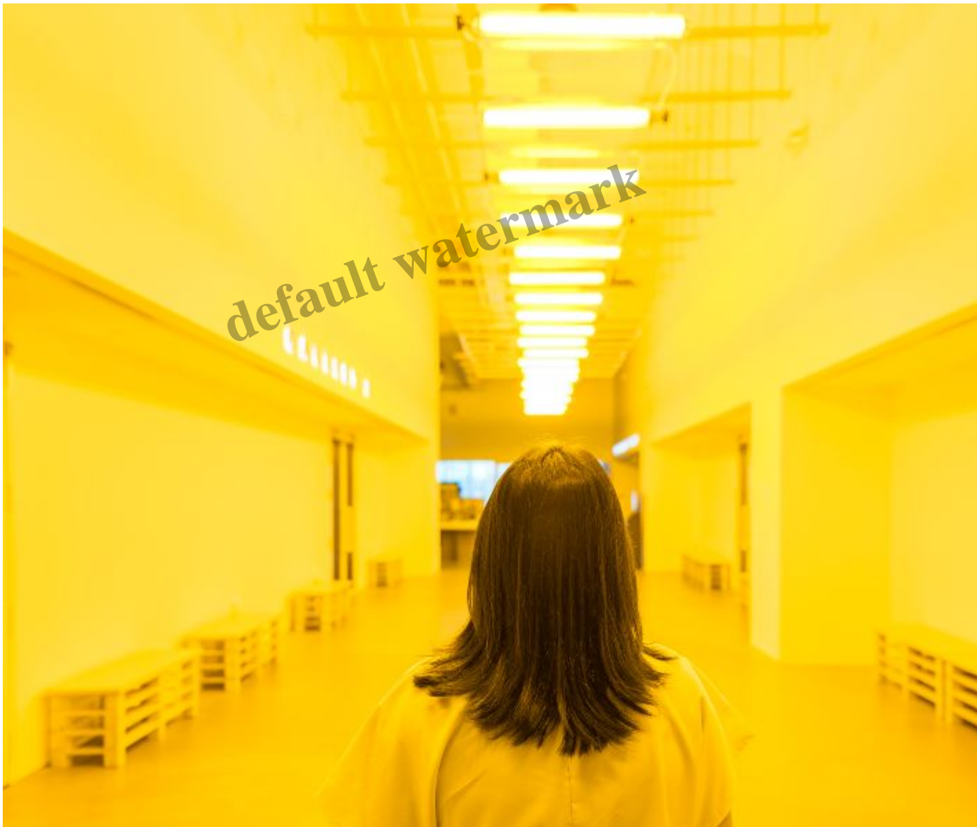
Installation view of Olafur Eliasson's "Yellow corridor" (1997), as part of "Olafur Eliasson's curious journey" at SAM at Tanjong Pagar Distripark; Photo: Joseph Nair, Memphis West Pictures, courtesy of the artist and Singapore Art Museum; © 1997 Olafur Eliasson