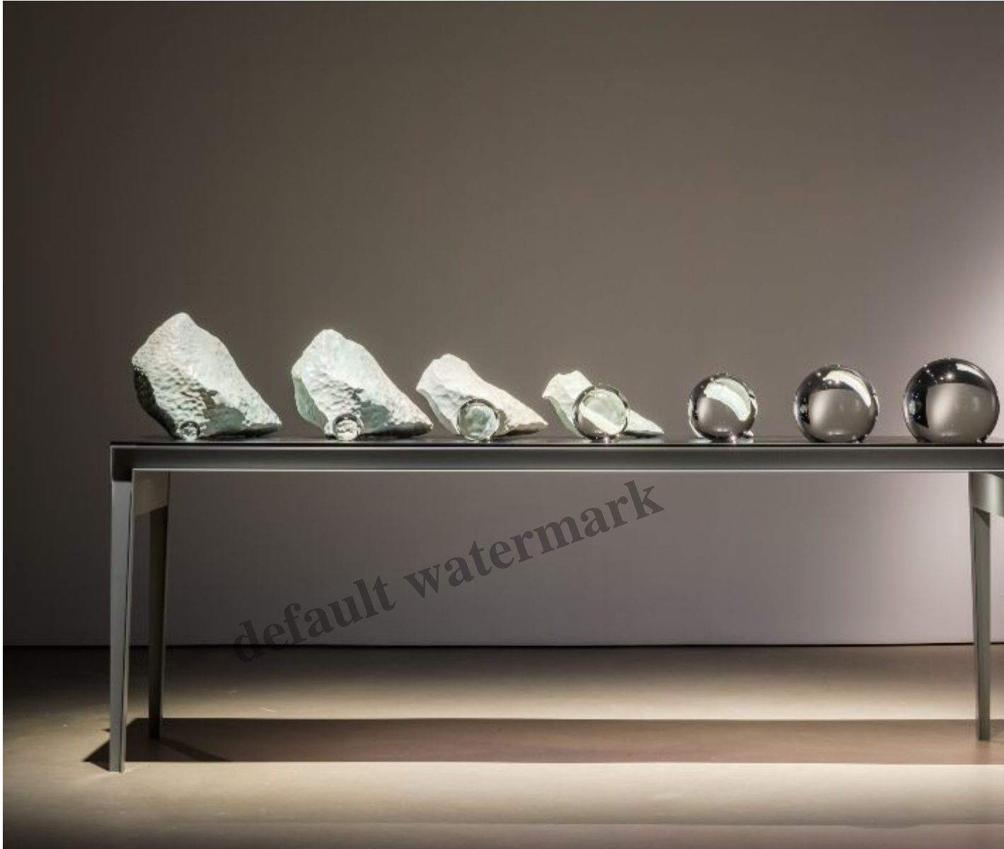
Installation view of Olafur Eliasson's 'The last seven days of glacial ice' (2024), as part of 'Olafur Eliasson: A curious journey' at SAM at Tanjong Pagar Distripark; Photo: Joseph Nair, Memphis West Pictures; In courtesy of the artist and Singapore Art Museum; © 2024 Olafur Eliasson