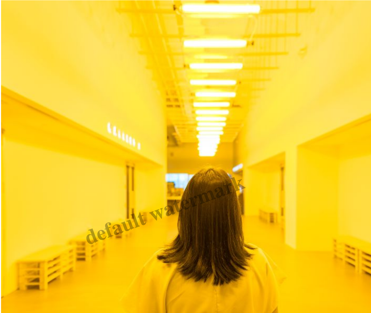
Installation view of Olafur Eliasson's 'Yellow corridor' (1997), as part of 'Olafur Eliasson: Your curious SAM at Tanjong Pagar Distripark; Photo: Joseph Nair, Memphis West Pictures; Image courtesy of the Singapore Art Museum; © 1997 Olafur Eliasson