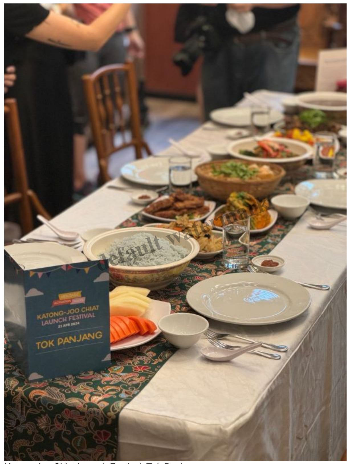
Katong-Joo Chiat Launch Festival: Tok Panjang

A public Call for Collaboration will also be jointly issued by NHB and Katong Culture on <a href="https://go.gov.sg/nhb-han">https://go.gov.sg/nhb-han</a> on 20 April 2024, and interested community groups and individuals may submit their ideas and proposals for consideration via the forms on the