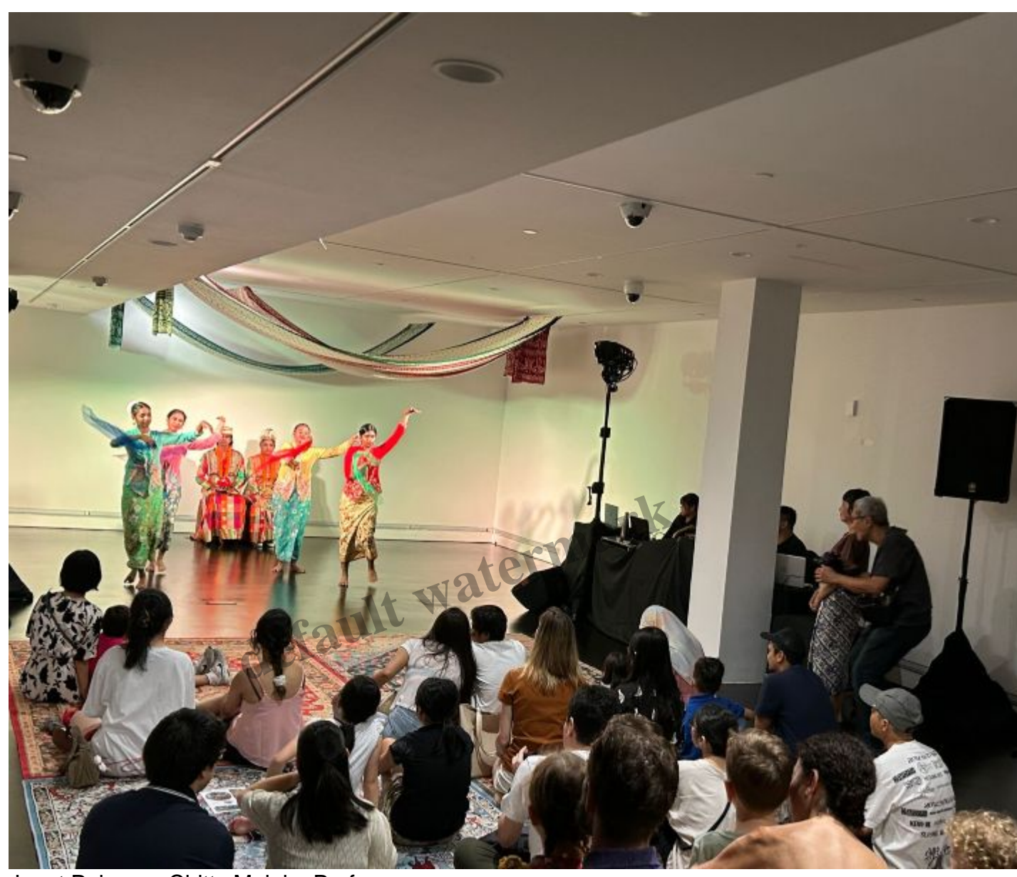
Joget Pahang_ Chitty Melaka Performance

With over 25 exciting programmes co-organised with more than 20 partners across nine locations, there's something for everyone to enjoy. Come together with friends, family, and neighbours as we revel in the spirit of heritage and community at Katong-Joo Chiat!