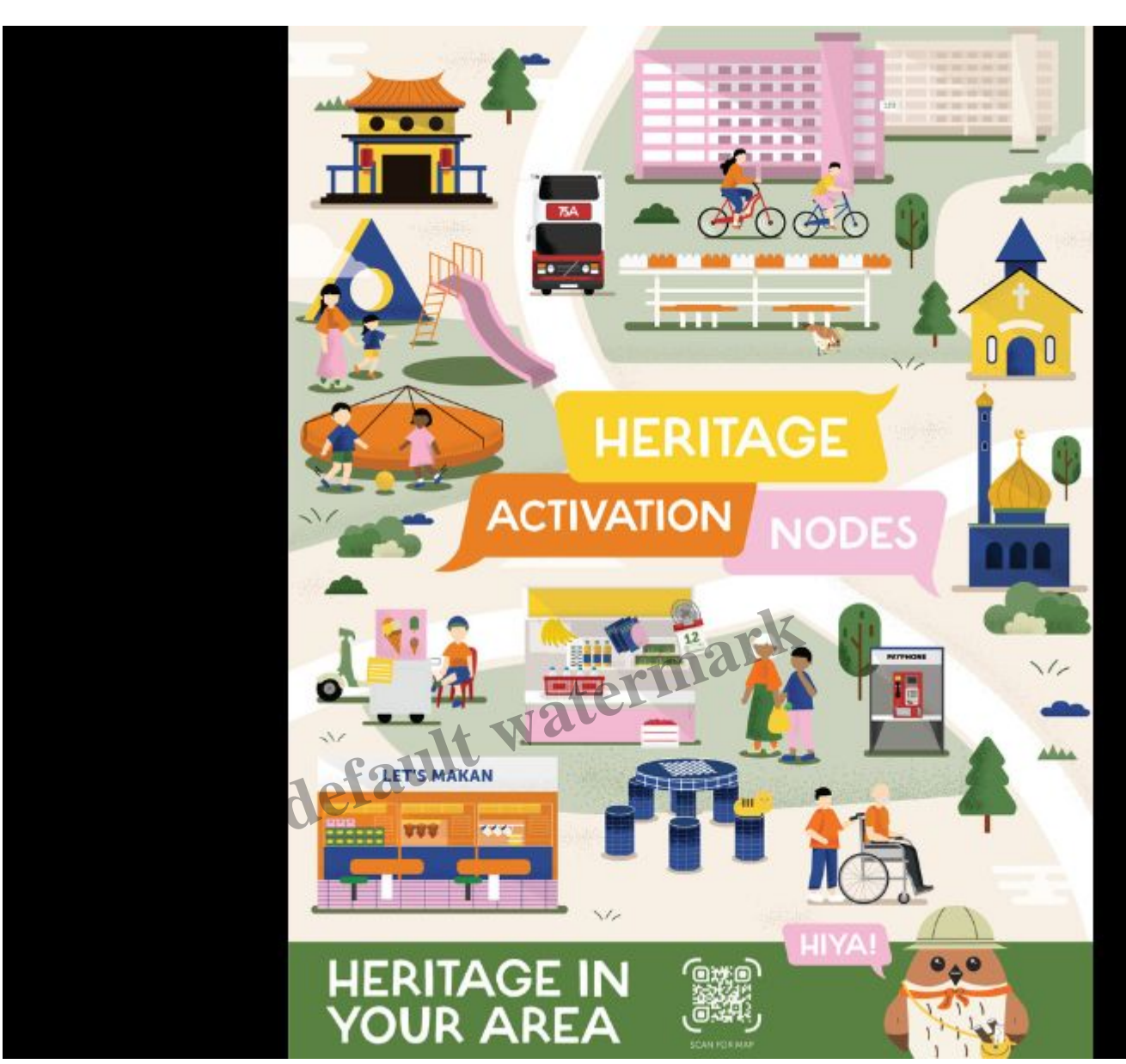
Heritage Activation Node

The inaugural HAN (HAN @ Katong-Joo Chiat) will be launched in the Katong-Joo Chiat precinct is renowned for its multicultural heritage, colourful shophouses, and heritage restaurants and eateries. HAN @ Katong-Joo Chiat marks the first in a series of HANs which will be introduced in various neighbourhoods from this year, each unique and tailored to the needs and characters of these neighbourhoods.