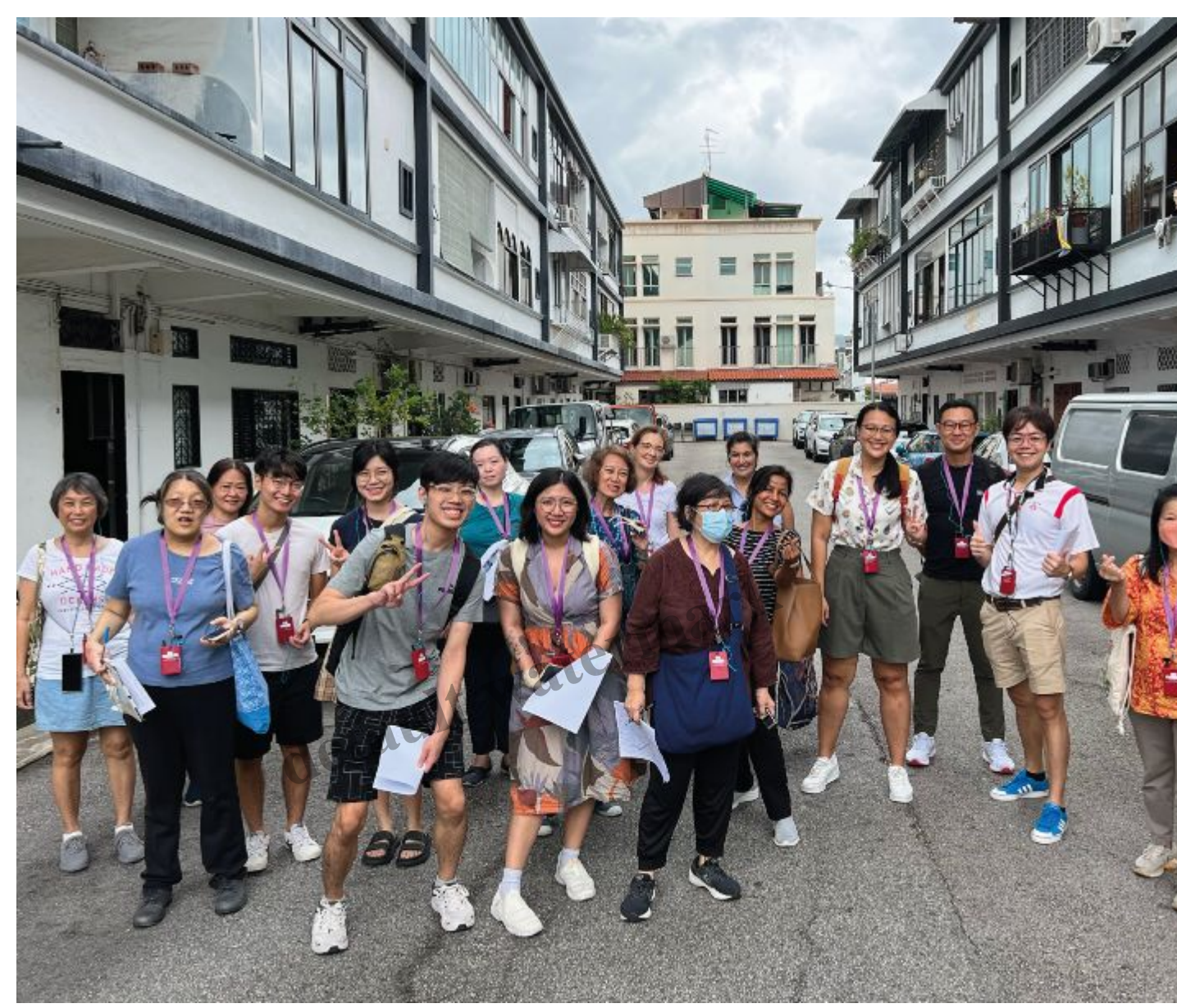
Community Tales_ A Walking Tour of Katong-Joo Chiat