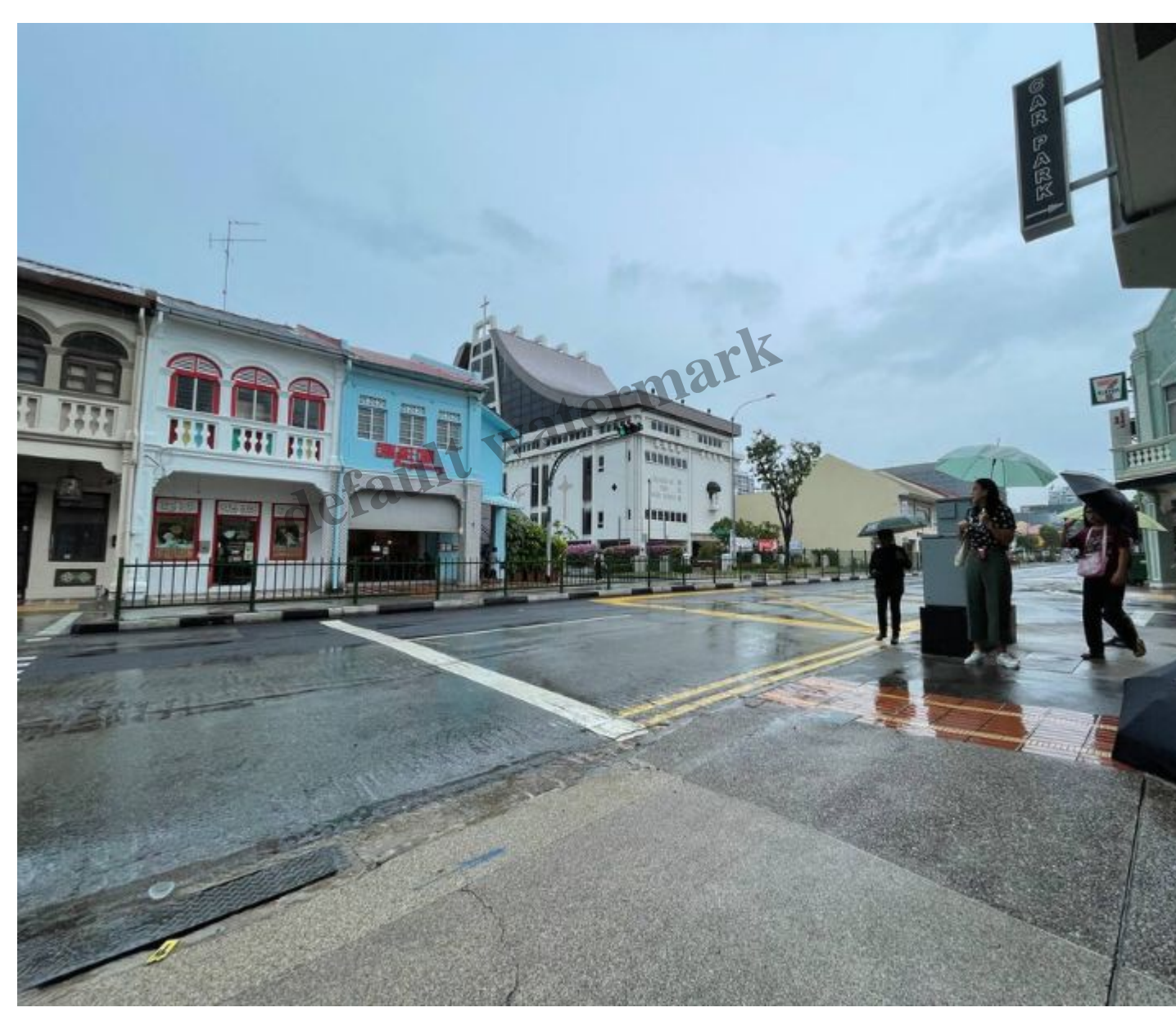
Across Chin Mee Chin Confectionery at East Coast Road

The area is home to architectural icons such as Katong Shopping Centre, built in 1973 and the first fully air-conditioned mall in Singapore, and The Red House (also formerly known as Katong Bakery and Confectionery Co.). Established in 1925, the bakery was known for its cakes and as a matchmaking place for Katongers in the early decades who could proceed to catch a movie at the landmark Roxy Cinema just opposite that was later acquired by the Shaw Brothers.