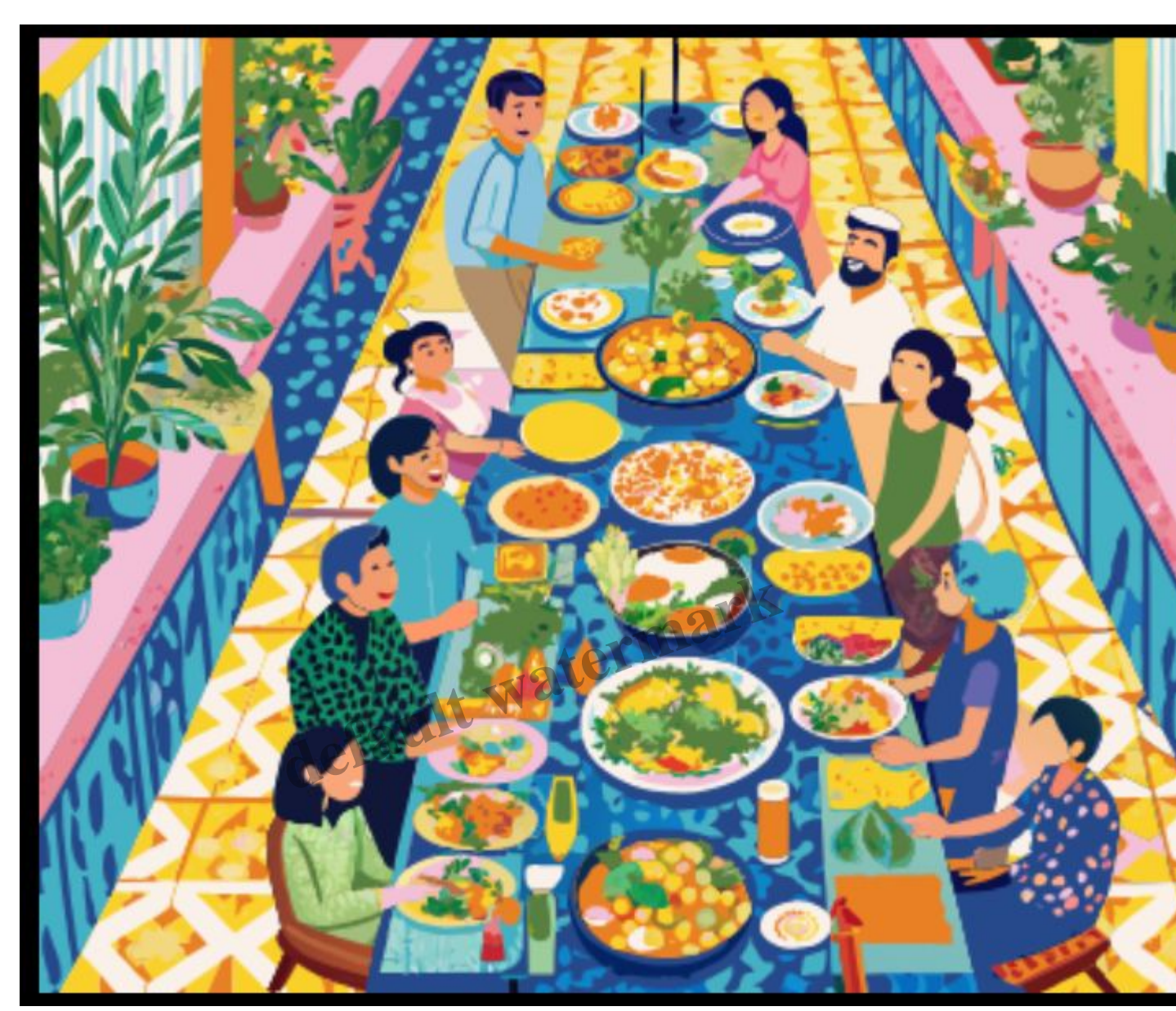
Tok Panjang Illustration