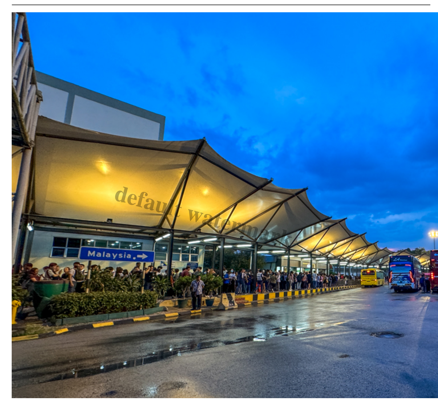
7:15pm â?? Finally en route to the car workshop to collect my vehicle.