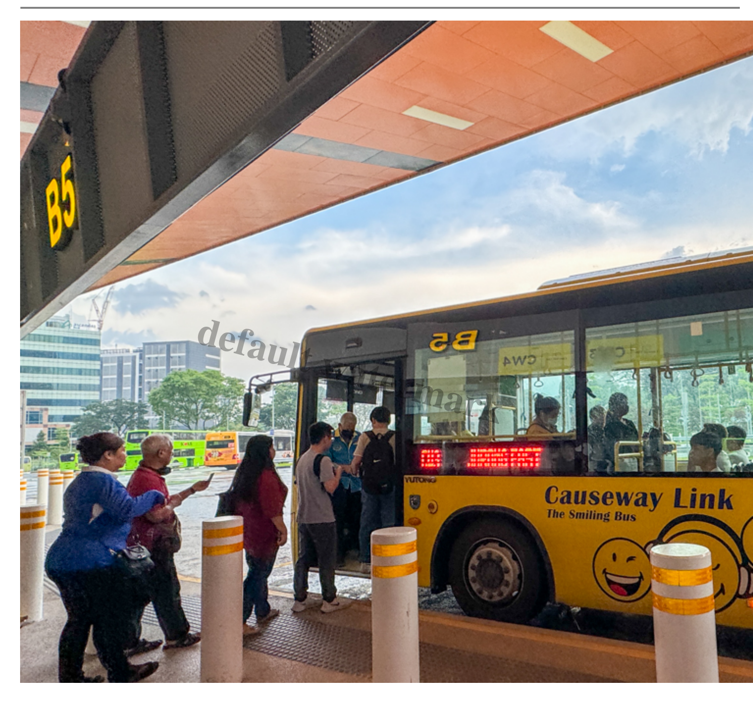
6:15pm â?? Progress came to a halt due to congestion at Tuas Checkpoint.