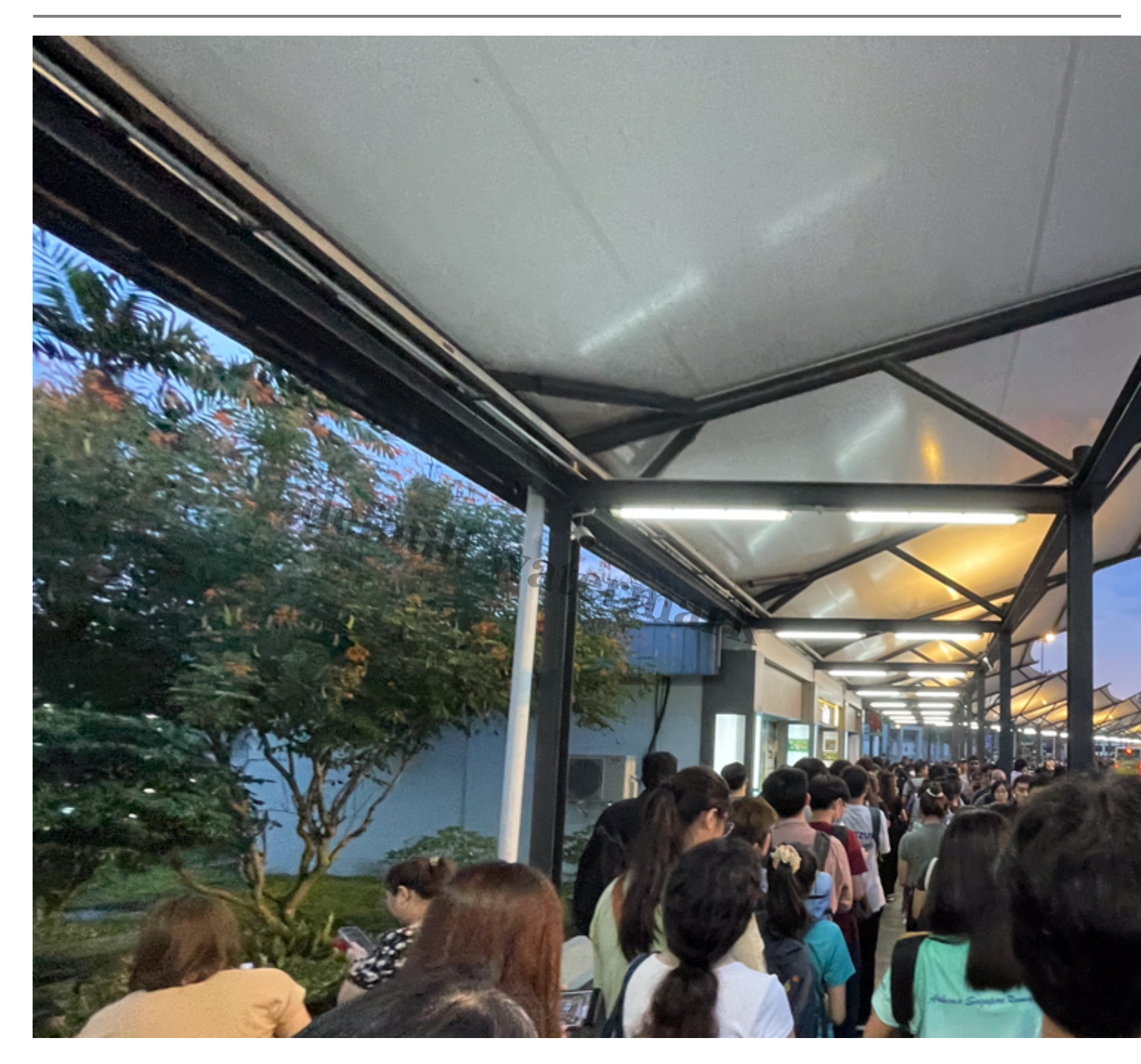
7:05pm â?? Frustrated by the sluggish pace and uncertainty of the queueâ??s legitimacy, I attempted to book a Grab ride, facing rejections on JustGrab at RM$40 until finally securing one at a higher fare at RM$68 on GrabCar Plus/Premium.