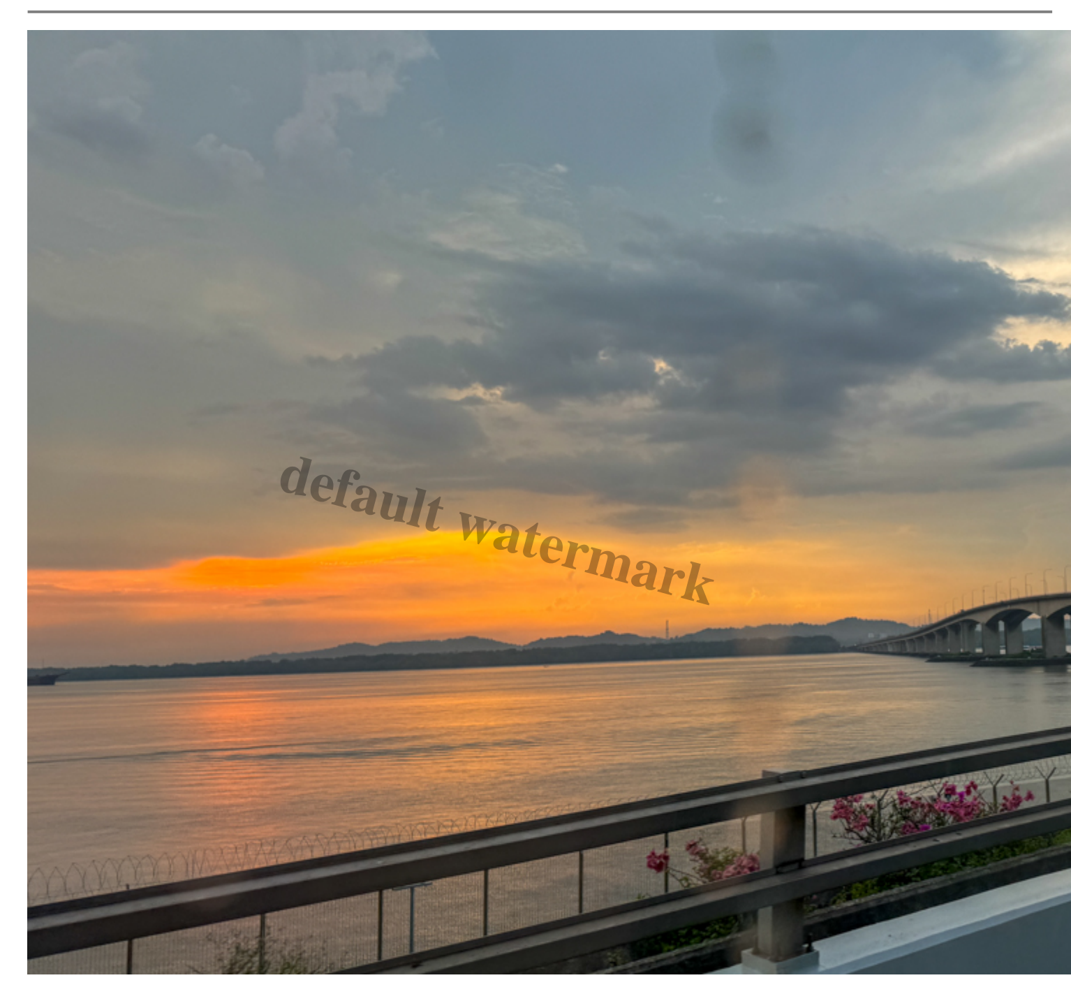
6:45pm â?? Exiting the bus, I proceeded for immigration clearance.

6:55pm â?? Despite clearing immigration, a disorganized queue awaited outside, causing further delays.