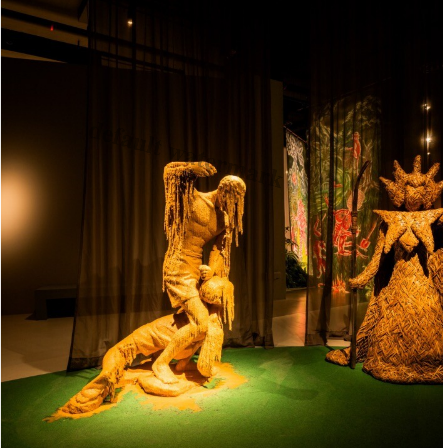
Bodies in Penumbra is one of the official artwork highlights from Nafasan Bumi.