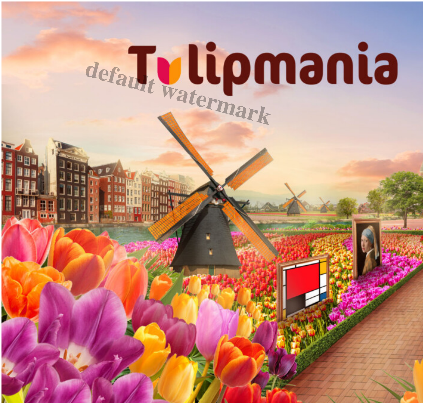
Nearby seasonal displays can turn the trip into a fuller family outing before 31 May.

Location: Floral Fantasy, Gardens by the Bay, 18 Marina Gardens Drive, Singapore 018953. Opening hours listed by Gardens by the Bay for Floral Fantasy: 10am to 9pm. Nearest MRT: Bayfront. Maps: Open in Google Maps | Open in Apple Maps .