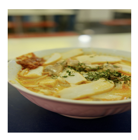
My Favourite Laksa â?? Consistently Good