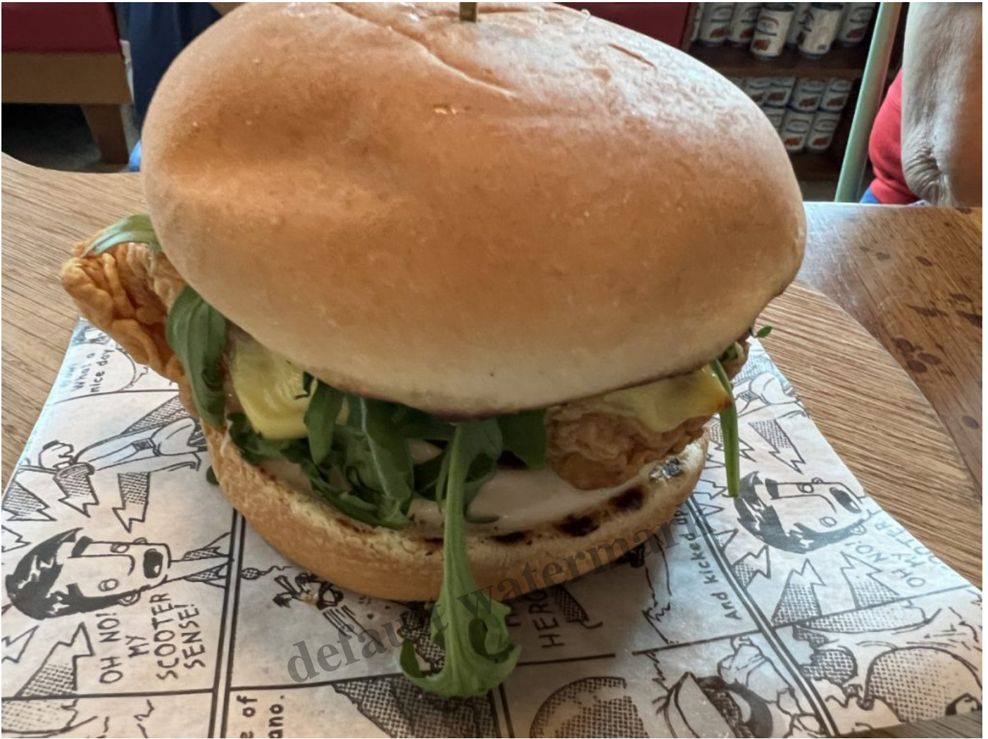
This was my vegetarian option. The best vegetarian option I had on board.