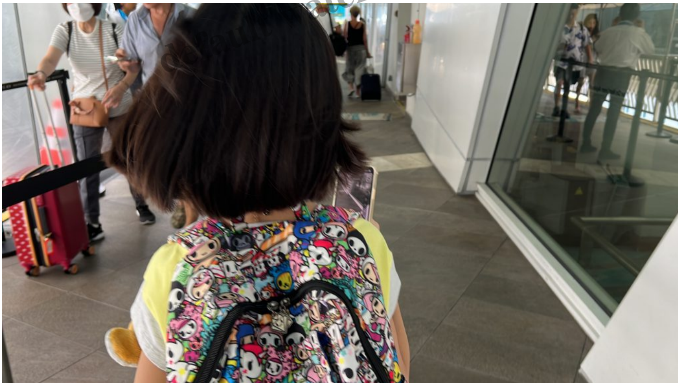
My daughter is filming content for her YouTube channel. Yes apparently she aspires to be a YouTuber.

Here is my 9 year old daughter after clearing immigration. Up ahead is where we hand over our passports. This is so that the cruise can register us with immigration at Penang and Phuket. We just need to hold on to our SeaPass card to disembark and board the cruise at the ports.