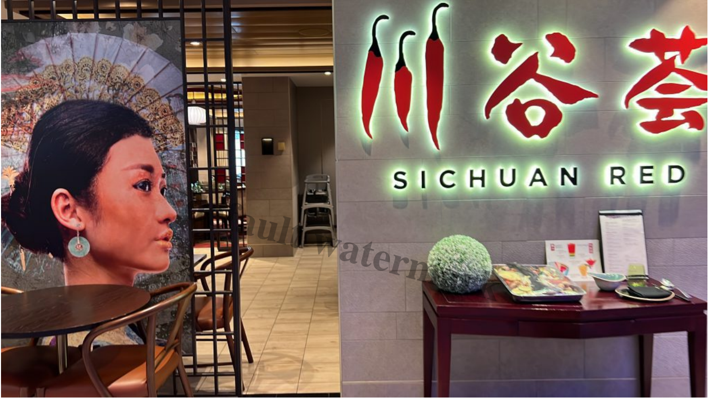
Sichuan Red is next to Leaf & Bean.

should make your reservations with the relevant restaurants once you board the ship. You can do it at Sichuan Red on level 4. This was what we did. The staff attending to you should be very helpful. They will recommend you your options and share with you when you speak to them. The customer service that you get from Royal Caribbean is truly top notch. So just feel free to ask the onboard staff about booking your dining options.