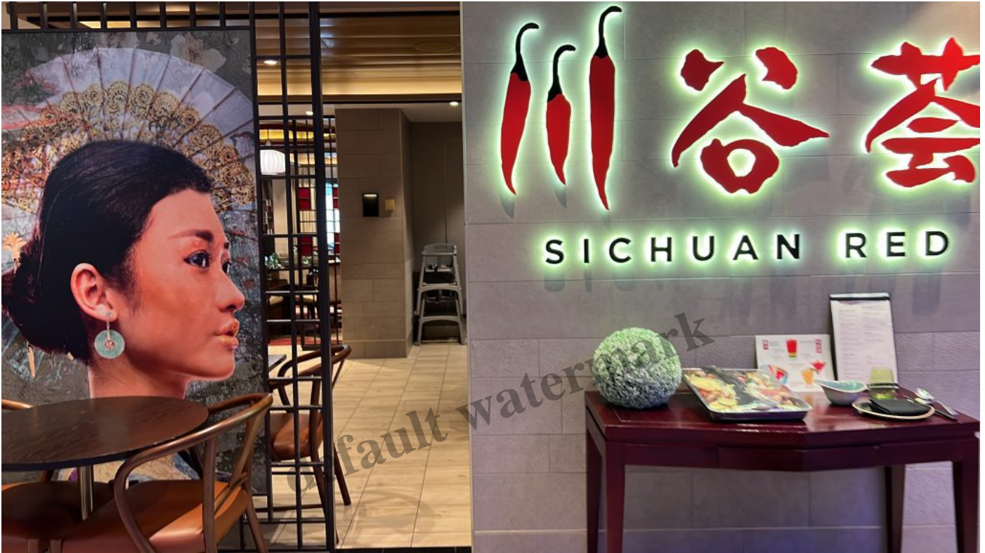
Sichuan Red is next to Leaf & Bean.

to head up to the Windjammer to have something to eat. If you have the unlimited dining package, you should make your reservations with the relevant restaurants once you board the ship. You can do it at Sichuan Red on level 4. This was what we did. The staff attending to you should be very helpful. They will recommend you your options and share with you when you speak to them. The customer service that you get from Royal Caribbean is truly top notch. So just feel free to ask the onboard staff about booking your dining options.