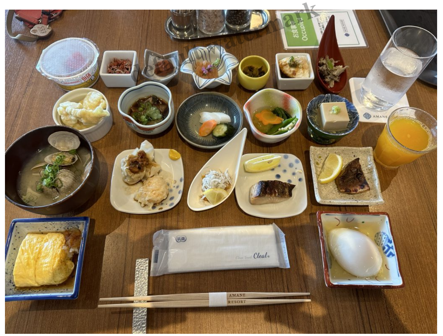
Today marks the last day in Beppu, and we are headed to Nagasaki for the next two days. The drive

Good morning. A sumptuous breakfast is served.