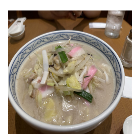
My 14 Days Travel Itinerary In Kyushu Japan 2023 - Day 8