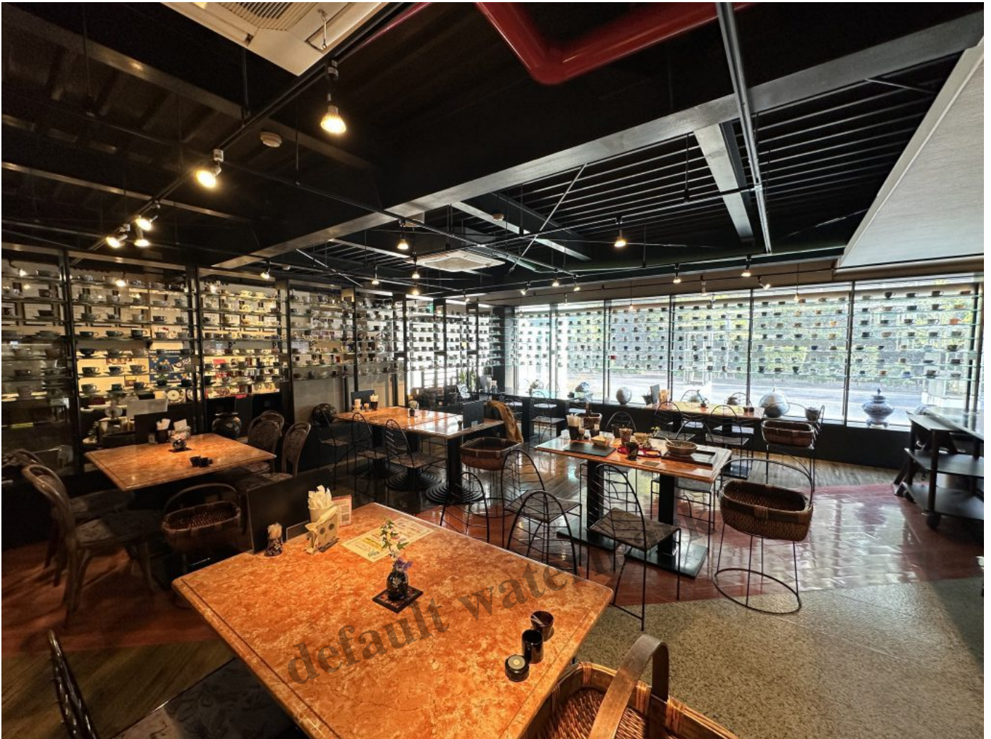
The entire cafe is lined with porcelain cups and saucers of different designs.