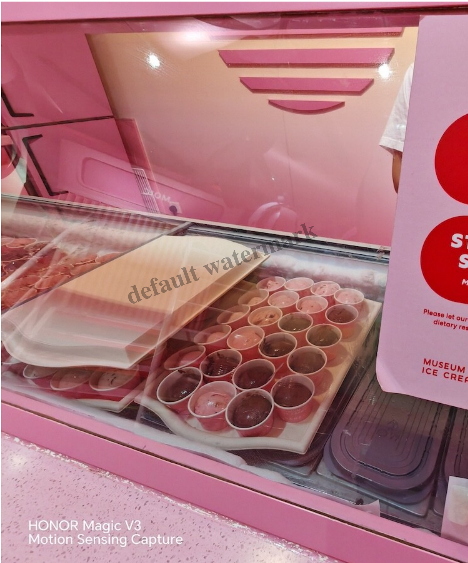
HONOR Magic V3 Motion Sensing Capture