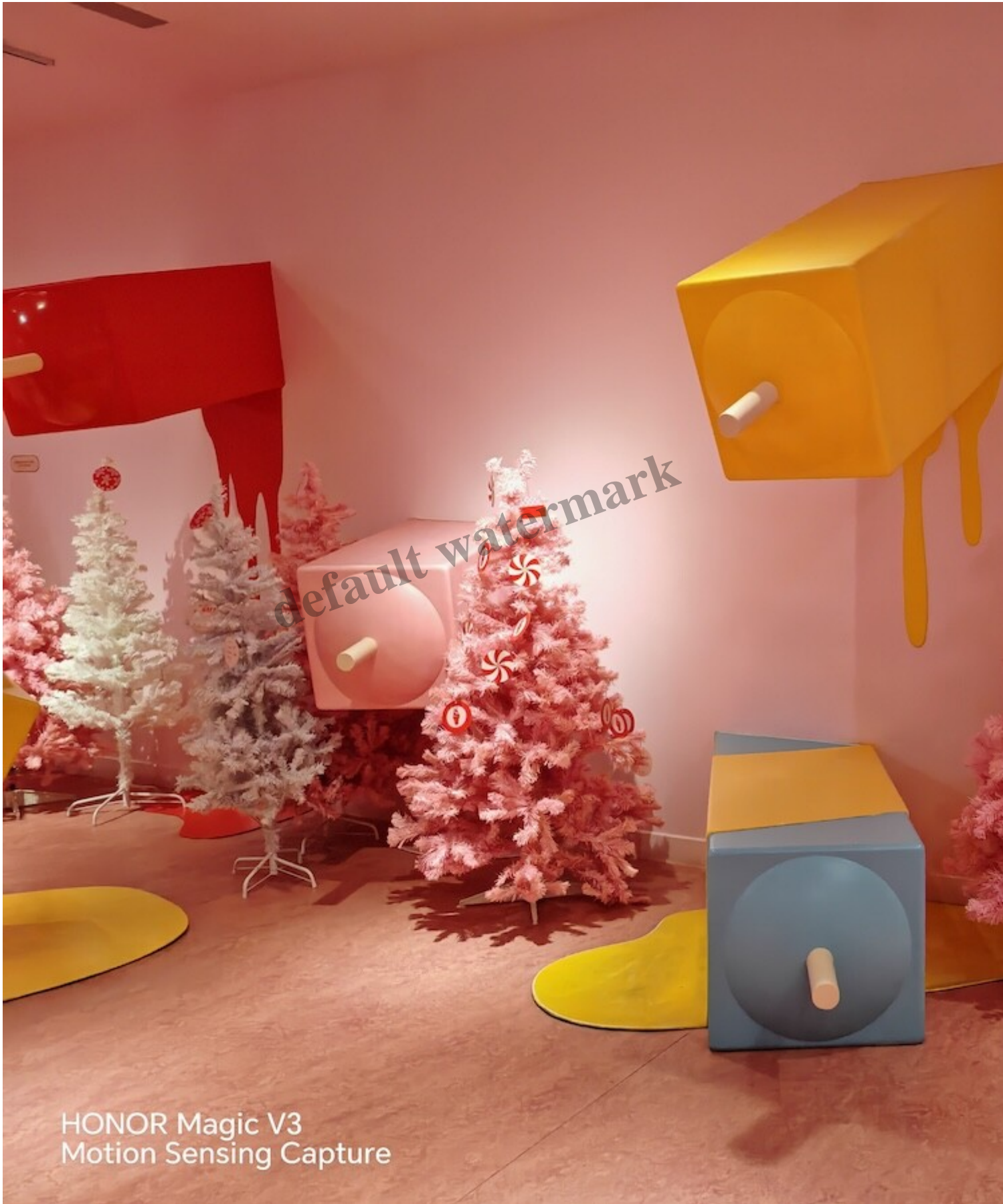
HONOR Magic V3 Motion Sensing Capture