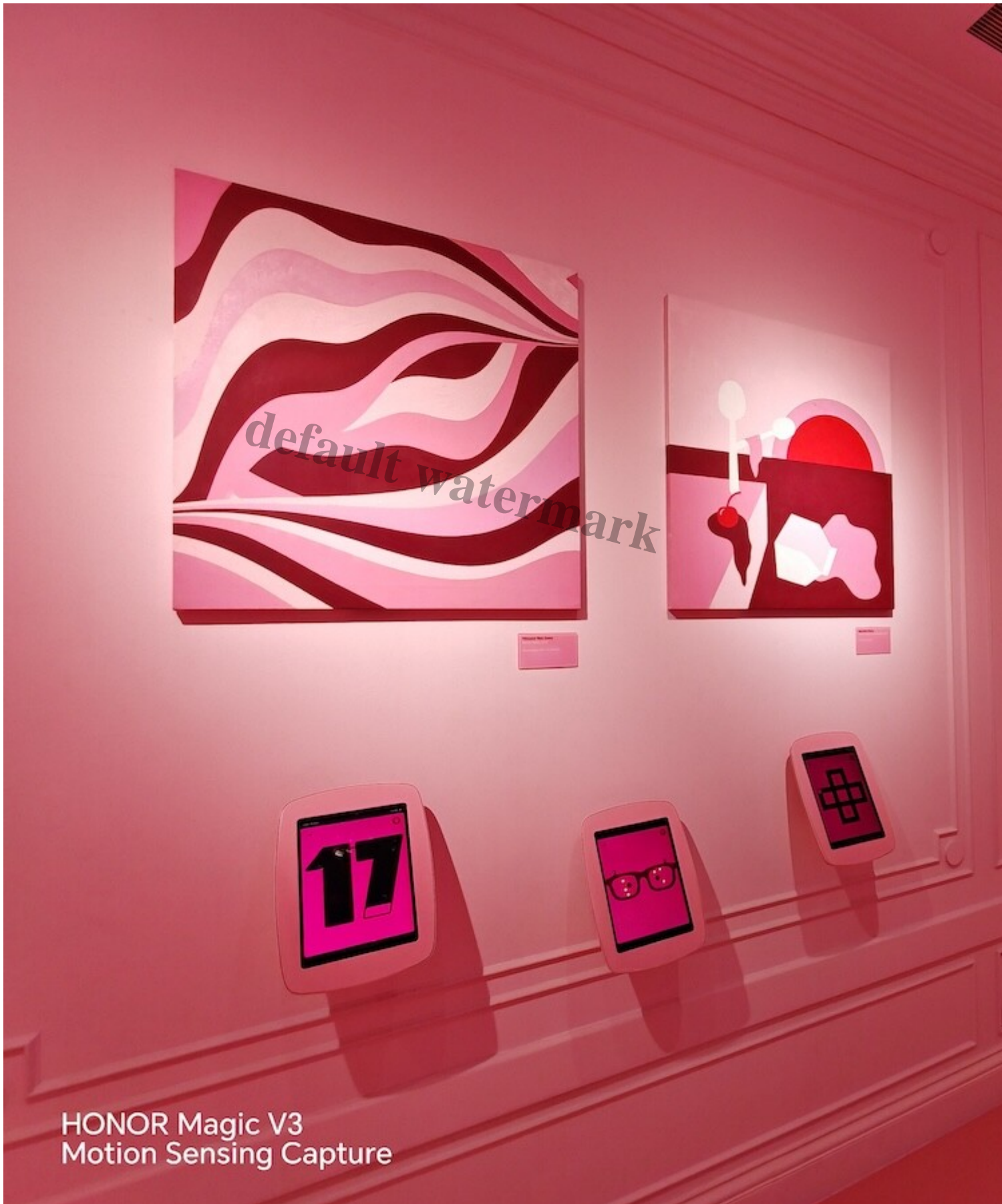
HONOR Magic V3 Motion Sensing Capture