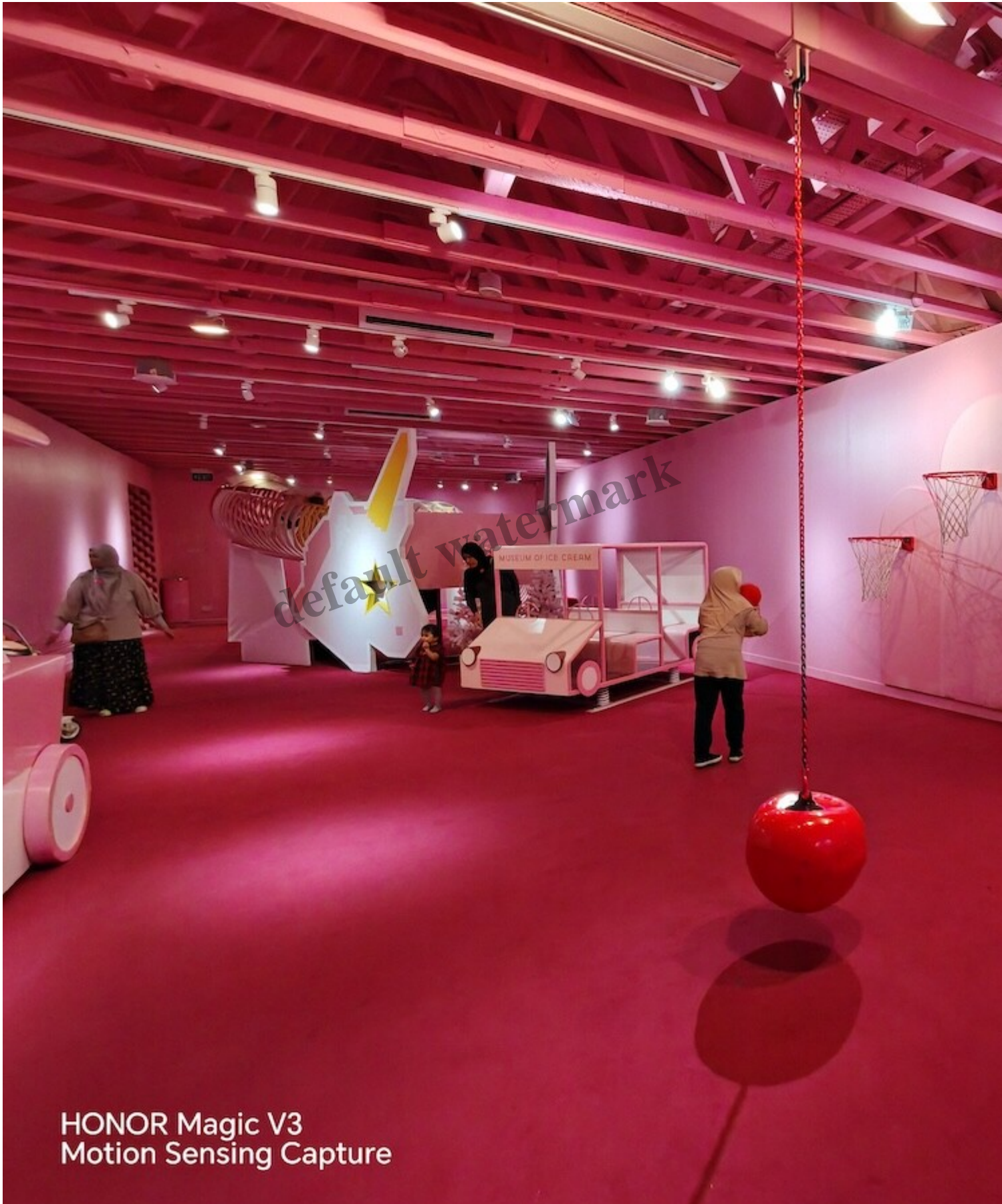
HONOR Magic V3 Motion Sensing Capture