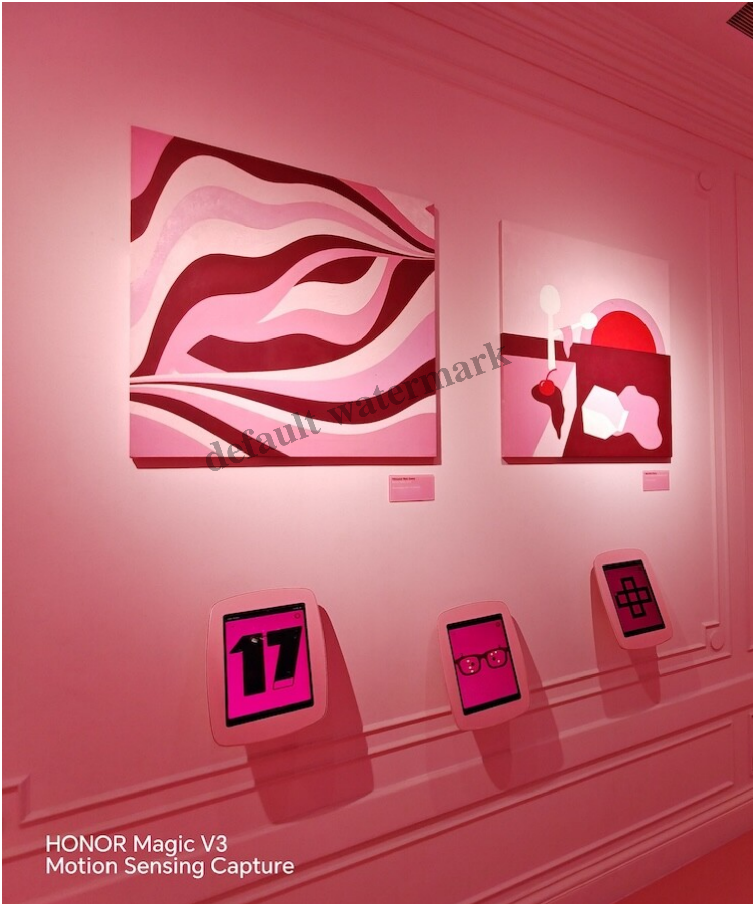
HONOR Magic V3 Motion Sensing Capture