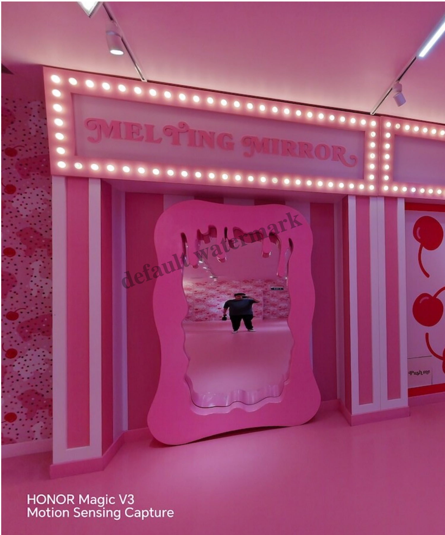
HONOR Magic V3 Motion Sensing Capture