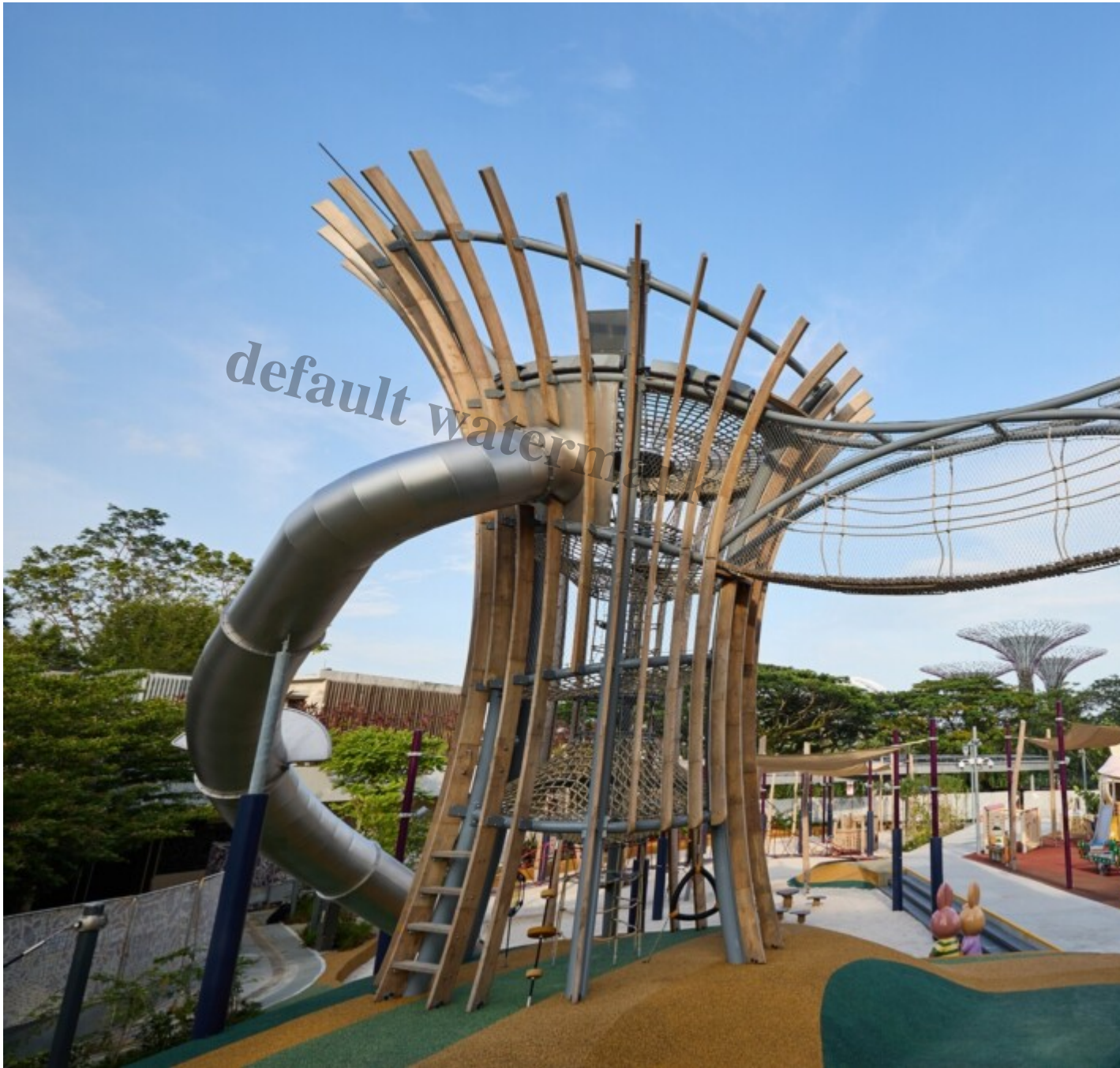
Families can combine the workshop with a wider Gardens by the Bay visit.

Build the rest of the visit lightly. A workshop followed by a casual meal or short walk is usually better than stacking multiple attractions after a reflective session.