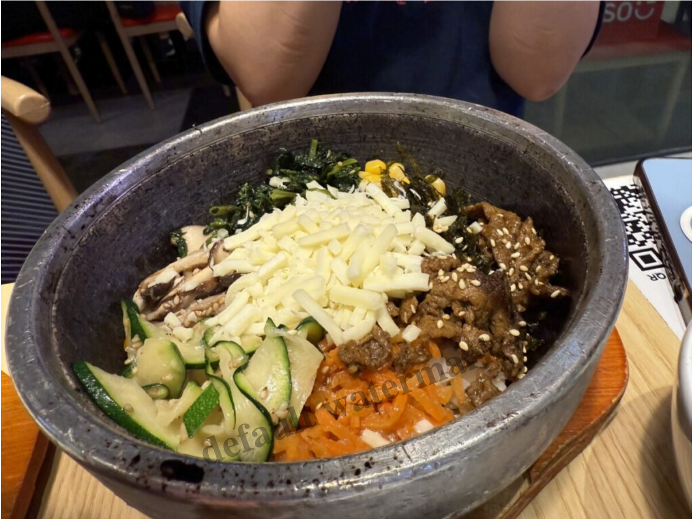
This was the Beef Bibimbap.