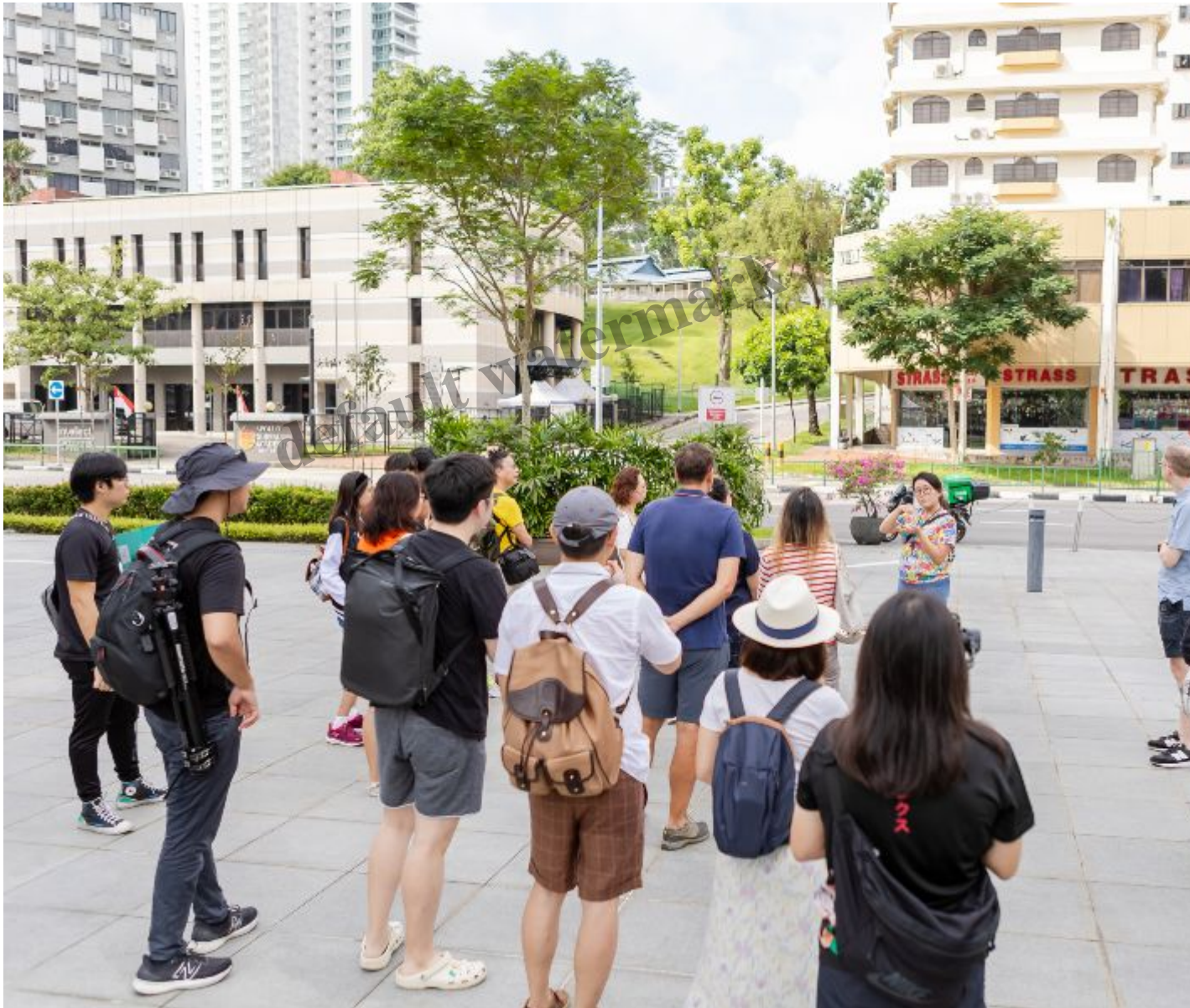
The trail is conducted in English

Admission: $12 per pax; purchase tickets via https://wanqingyuan.peatix.com . Tickets available from 15 May 2024, 6 pm onwards.