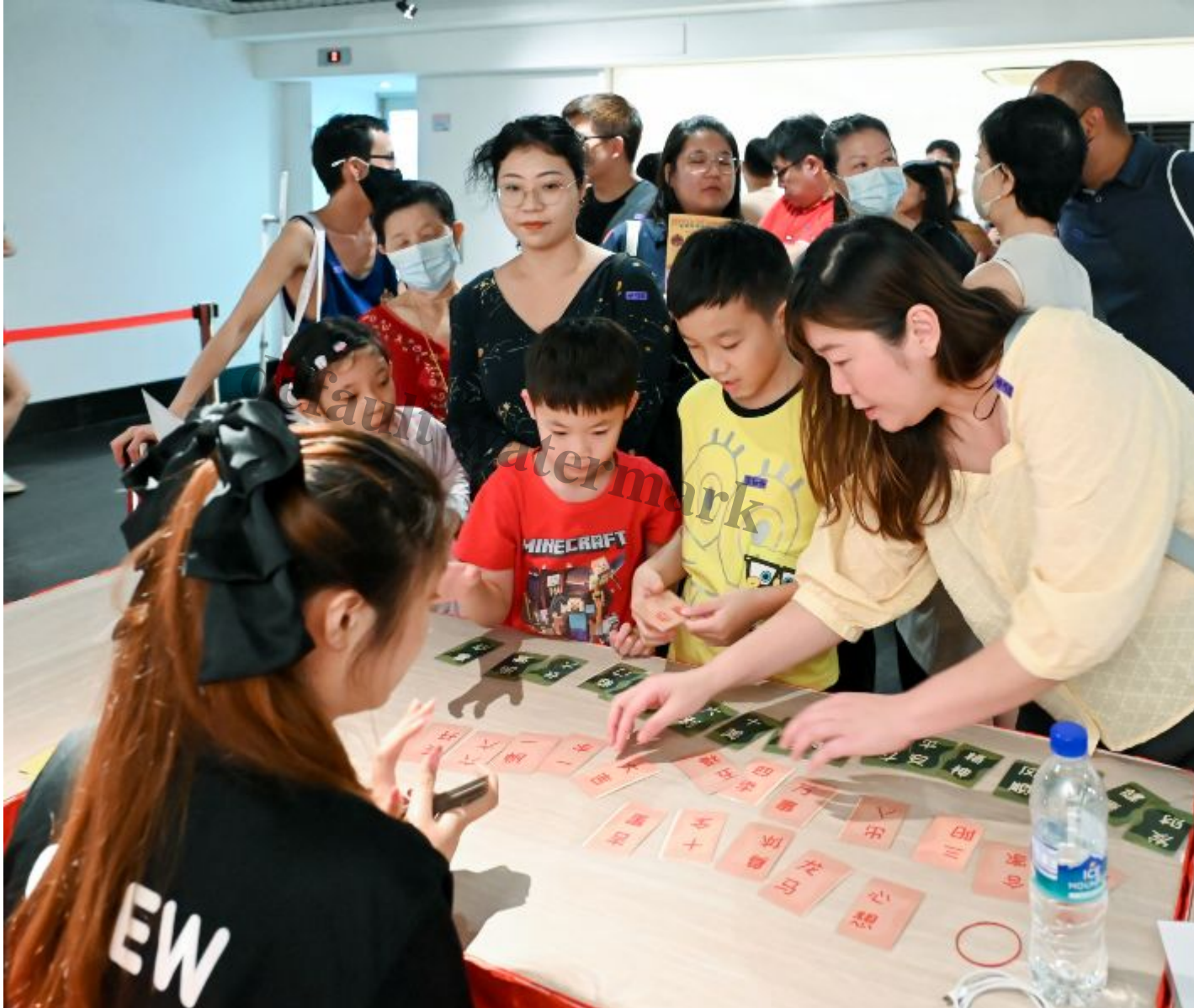
Drop-in Activity Station - Duanwu Mini Games

Explore the rich traditions of the Dragon Boat Festival at our mini-game booths! Engage in interactive games that educate and entertain, offering insights into the festival's history and customs.