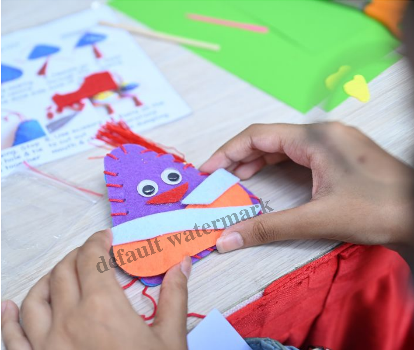
Drop-in Craft Station – DIY Duanwu Scented Sachets

In ancient times, it was common for people to carry with them sachets filled with Chinese mugwort during the Dragon Boat Festival to protect against venomous animals due to the herb's natural repellent properties. Come make your scented sachets at our drop-in craft station to experience this traditional practice.