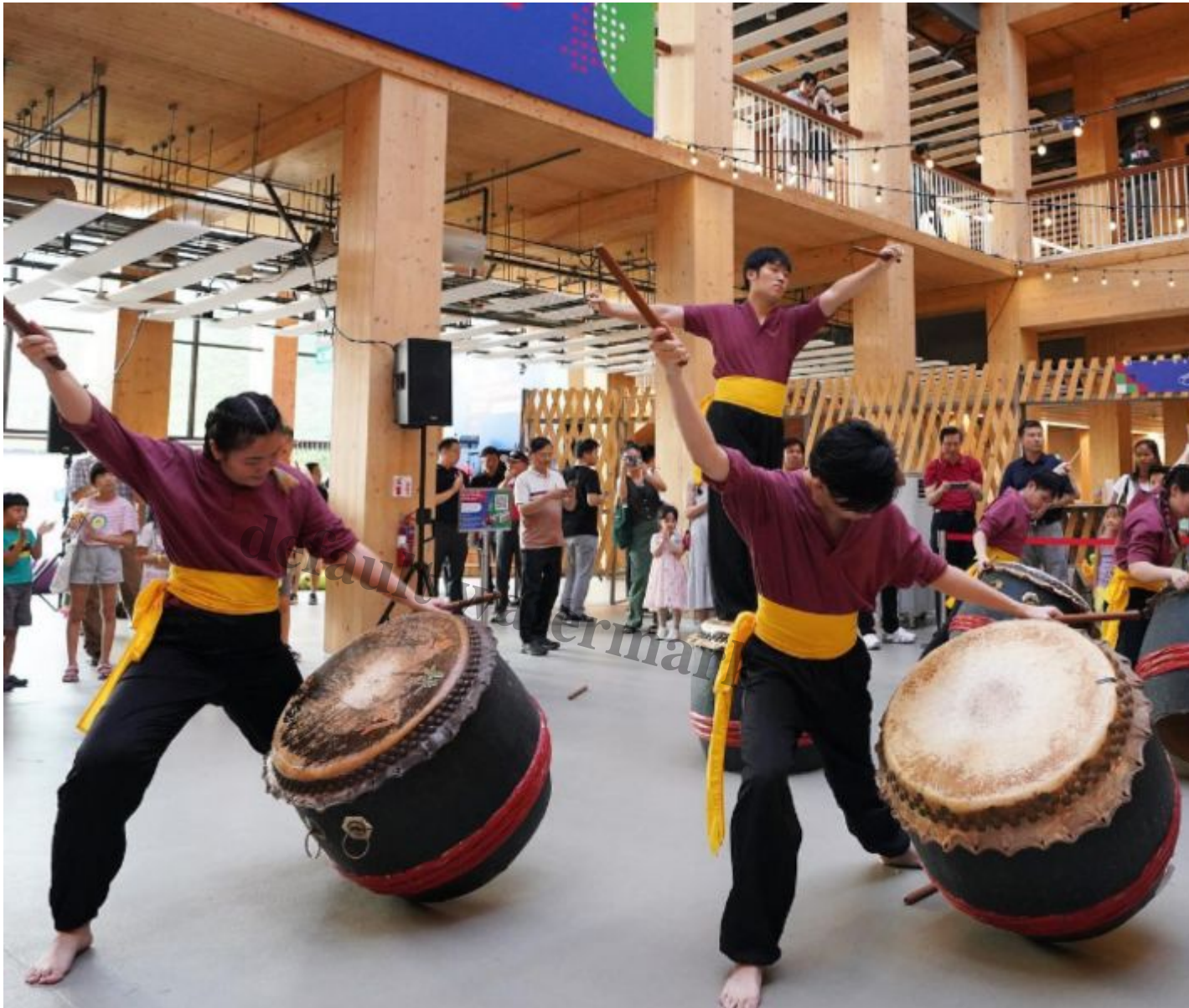
(Supported by RE:SOUND)

Join us for a captivating Chinese drums performance by RE:SOUND, a drum team comprising alumni members of the Nanyang Technological University Chinese Drums Club. Experience the traditional art of Chinese percussion in a mesmerising display of skill and rhythm against the backdrop of the Memorial Hall.