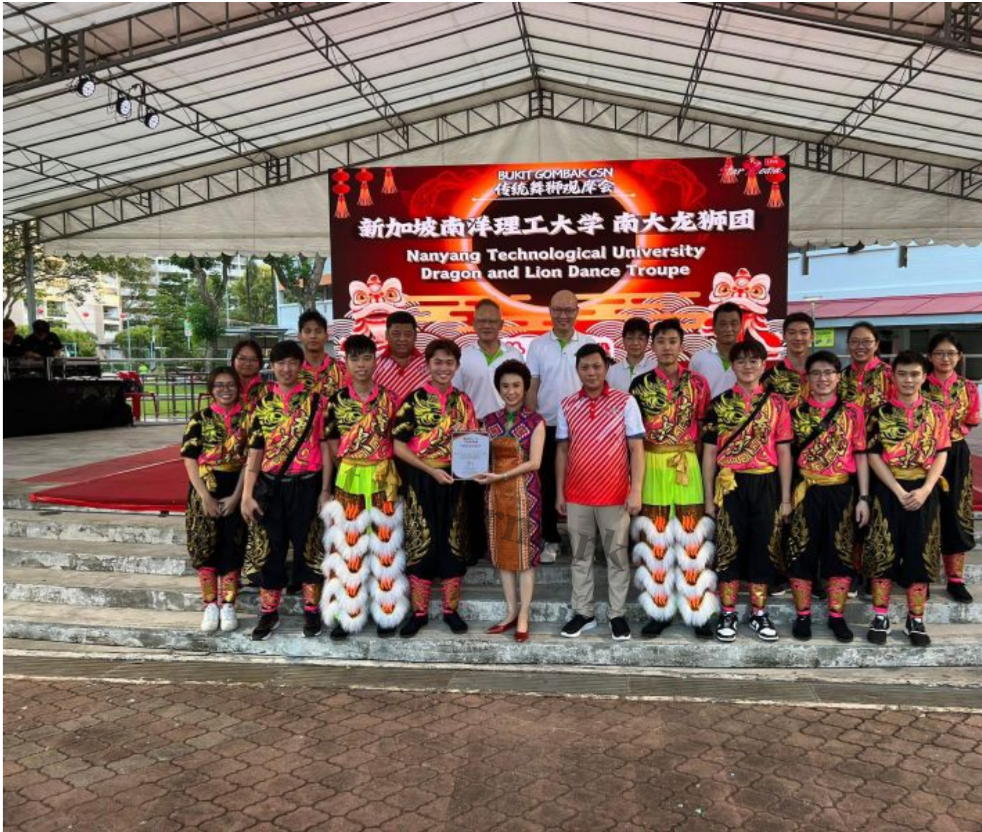
(Supported by NTU Dragon & Lion Dance Troupe)

Be enchanted by the ever-popular lion and dragon dance at Wan Qing Dragon Boat Festival 2024. Don't blink an eye as the performers showcase their agility and coordination in this crowd-puller act by the NTU Dragon & Lion Dance Troupe.