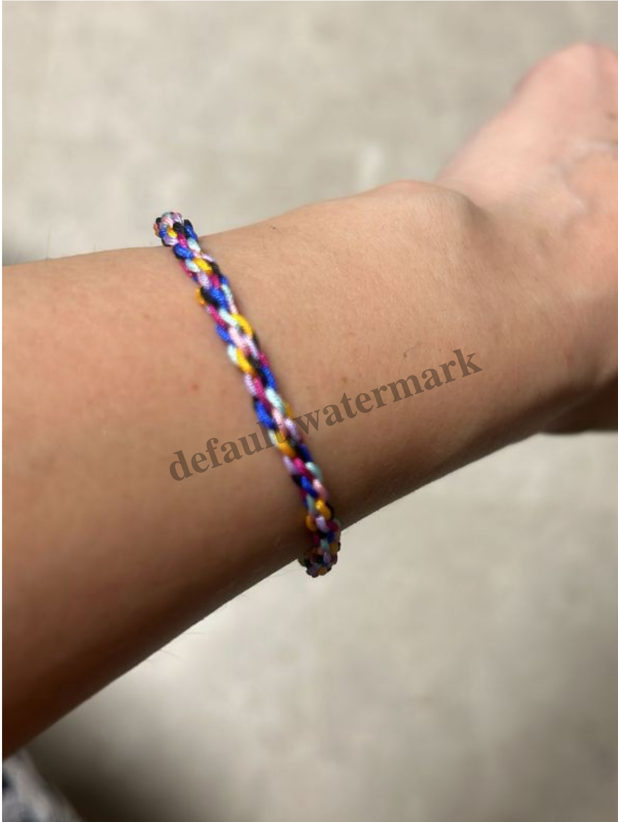
Drop-in Craft Station – DIY Duanwu Five-colour Bracelet

The five different coloured threads in a five-colour bracelet are said to represent the elements of wood, fire, earth, metal and water. According to Chinese folklore, it is believed