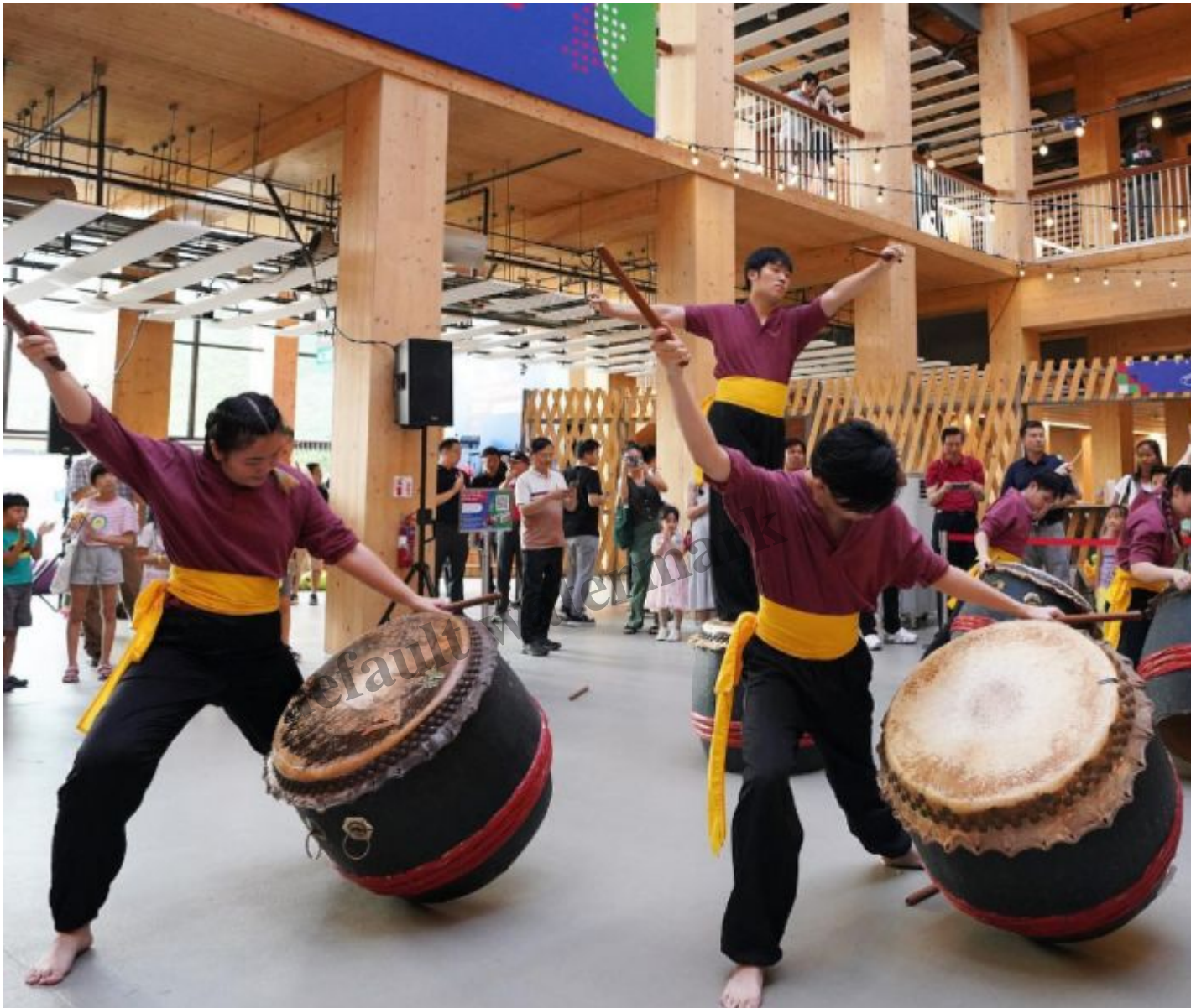
(Supported by RE:SOUND)

Join us for a captivating Chinese drums performance by RE:SOUND, a drum team comprising alumni members of the Nanyang Technological University Chinese Drums Club. Experience the traditional art of Chinese percussion in a mesmerising display of skill and rhythm against the backdrop of the Memorial Hall.