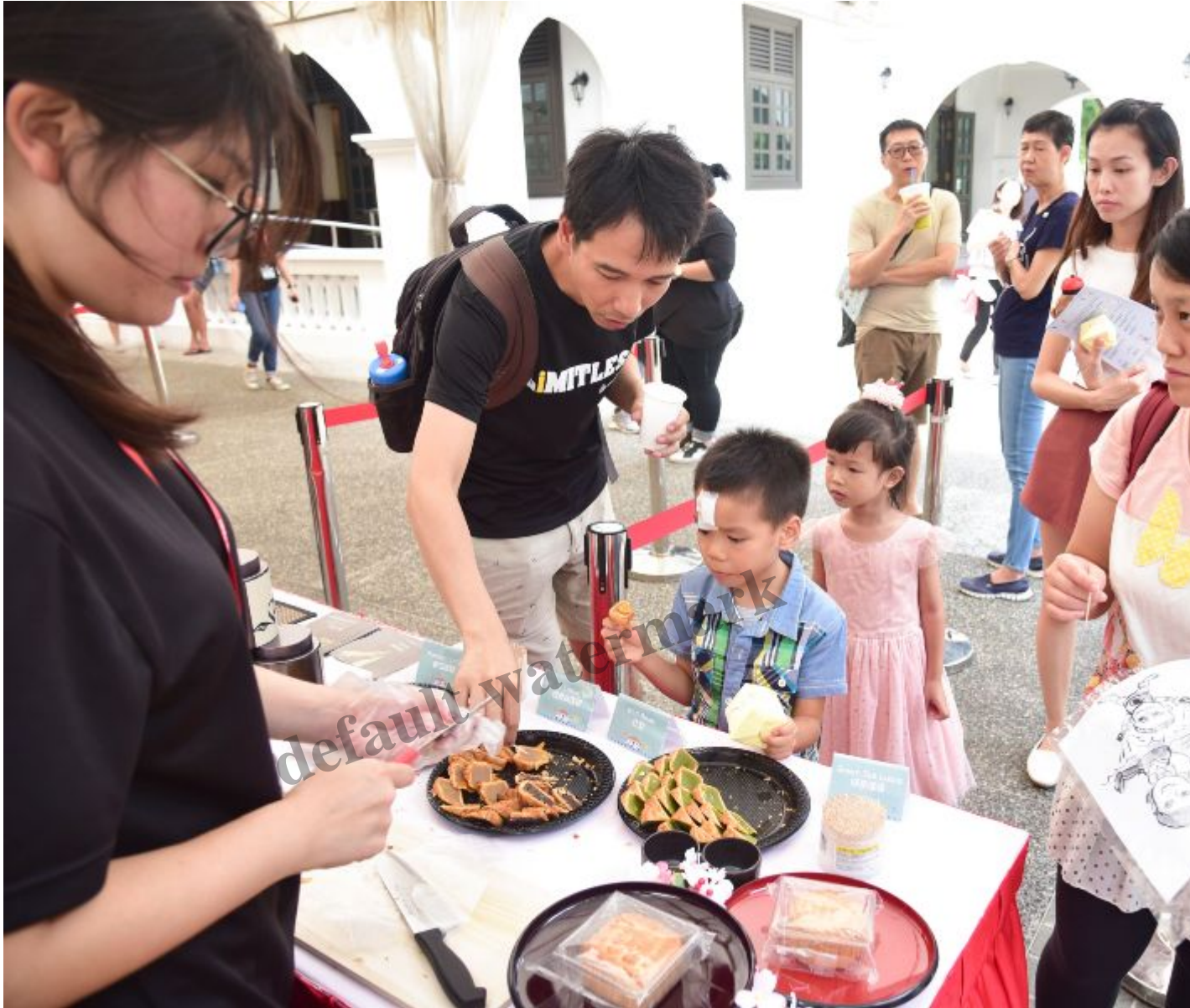
Festive Food & Herbal Tea Tasting (Courtesy of Sun Yat Sen Nanyang Memorial Hall)

Savour the taste of tradition and sample yummy festive delicacies such as rice dumplings and freshly brewed herbal tea. Enjoy these festive delicacies as you learn more about the Dragon Boat Festival!