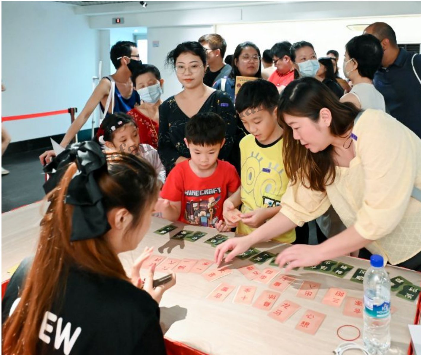
Drop-in Activity Station – Duanwu Mini Games

Explore the rich traditions of the Dragon Boat Festival at our mini-game booths! Engage in interactive games that educate and entertain, offering insights into the festival's history and customs.