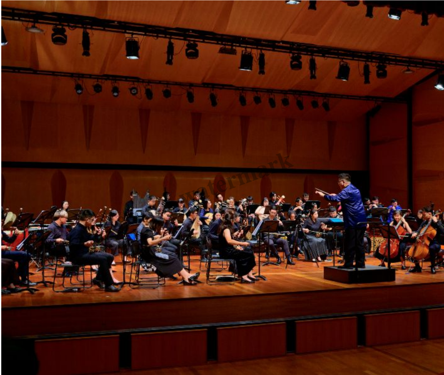
(Supported by Bukit Batok Chinese Orchestra)

Join us for a mesmerising Chinese orchestra performance presented by the Bukit Batok Chinese Orchestra as they capture the essence of traditional Chinese narratives and the beauty of natural landscapes through their performance. Be delighted with the diverse repertoire, from powerful rousing melodies to enchanting pieces that convey the peacefulness of the countryside.