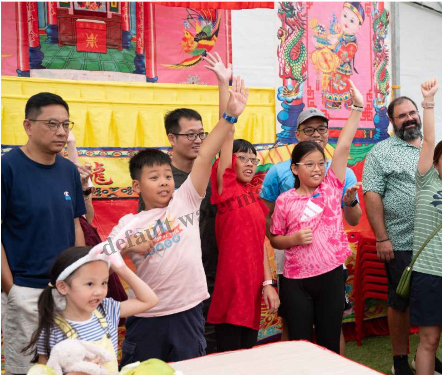
Live on the Lawn – Dragon Boat Festival Family Fun Contest

Date: 8 & 9 June 2024 Time: 2.30 pm – 3.30 pm Admission: Free