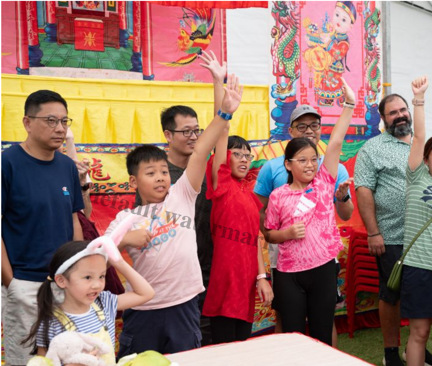
Live on the Lawn – Dragon Boat Festival Family Fun Contest

Gather your family for a Dragon Boat Festival Family Fun Contest on stage! Engage in friendly rivalry as you join other families in exciting Dragon Boat Festival-themed games. It's a session of bonding and fun! Limited spots are available, register your interest on the day to reserve your spot.