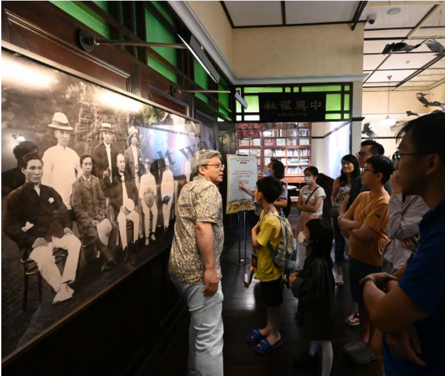
Permanent Galleries Guided Tour (Courtesy of Sun Yat Sen Nanyang Memorial Hall)

Admission: Free; limited spaces available.