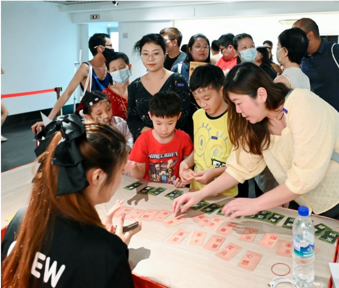
Drop-in Activity Station – Duanwu Mini Games

Explore the rich traditions of the Dragon Boat Festival at our mini-game booths! Engage in interactive games that educate and entertain, offering insights into the festival's history and customs.