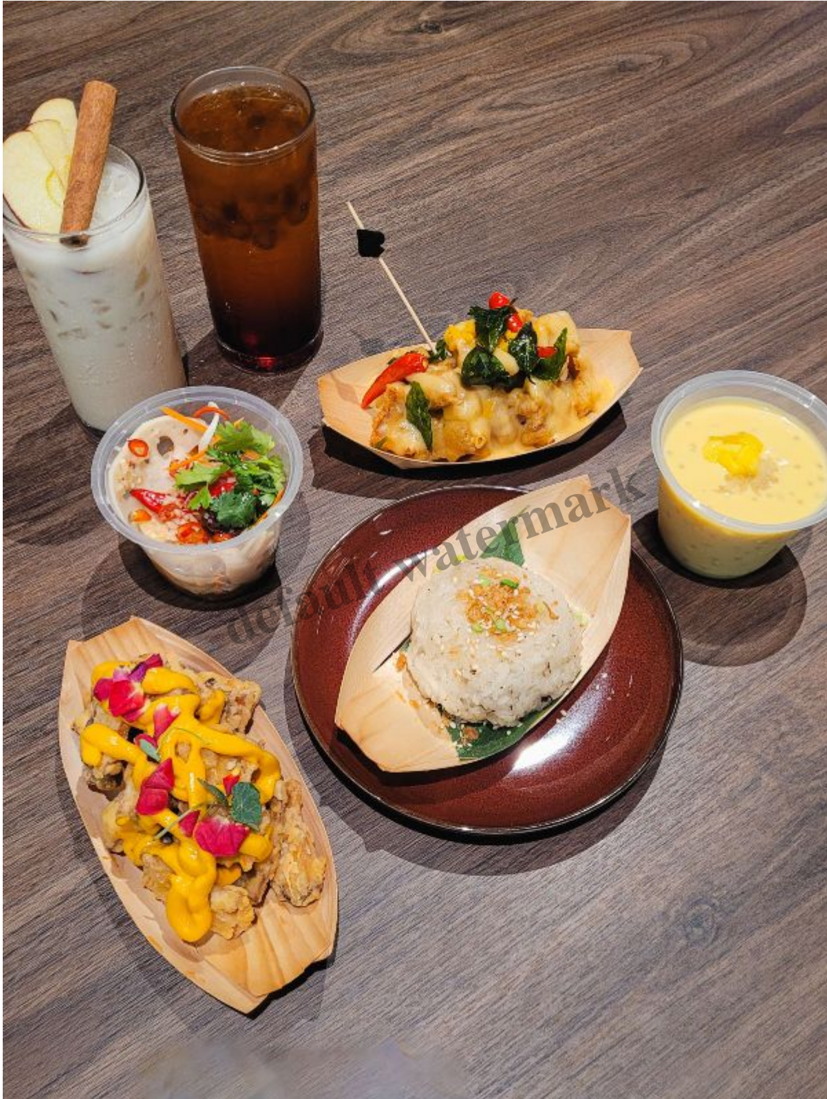
Festive Snacks Pop-up Booth by Yue @ Aloft

Experience the flavours of Yue @ Aloft at the Festive Snacks Pop-up Booth! Sample yummy snacks such as Mushroom with Yue's Signature Creamy Milk and Salted Egg Lime Sauce or indulge in other light bites such as the Popcorn Chicken and Glutinous Rice Ball with Truffle Chicken. Spice things up