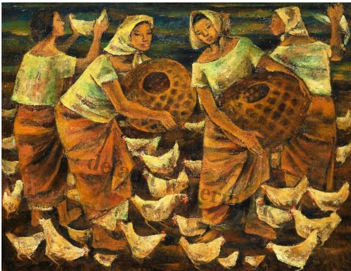
Anita Magsaysay-Ho, Paghuhuli Ng Mga Manok (Catching Chickens) oil on canvas, 102 x 132 cm, 1962

Koons, Yayoi Kusama, Lee Bae, as well as Beatriz Milhazes. Works by Georgette Chen, Anita Magsaysay-Ho and Beatriz Milhazes are also now on view at the ongoing Venice Biennale.