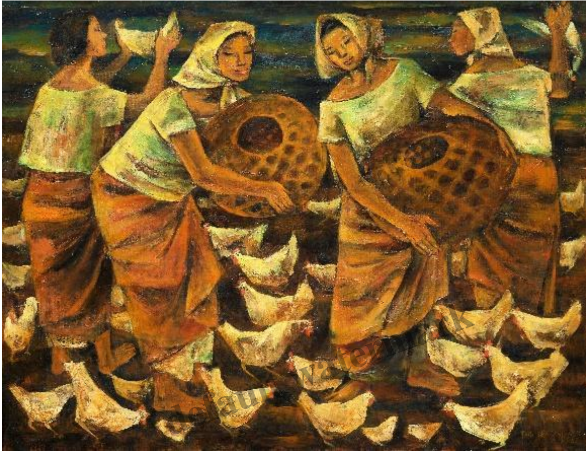
Anita Magsaysay-Ho, Paghuhuli Ng Mga Manok (Catching Chickens) oil on canvas, 102 x 132 cm, 1962

Koons, Yayoi Kusama, Lee Bae, as well as Beatriz Milhazes. Works by Georgette Chen, Anita Magsaysay-Ho and Beatriz Milhazes are also now on view at the ongoing Venice Biennale.