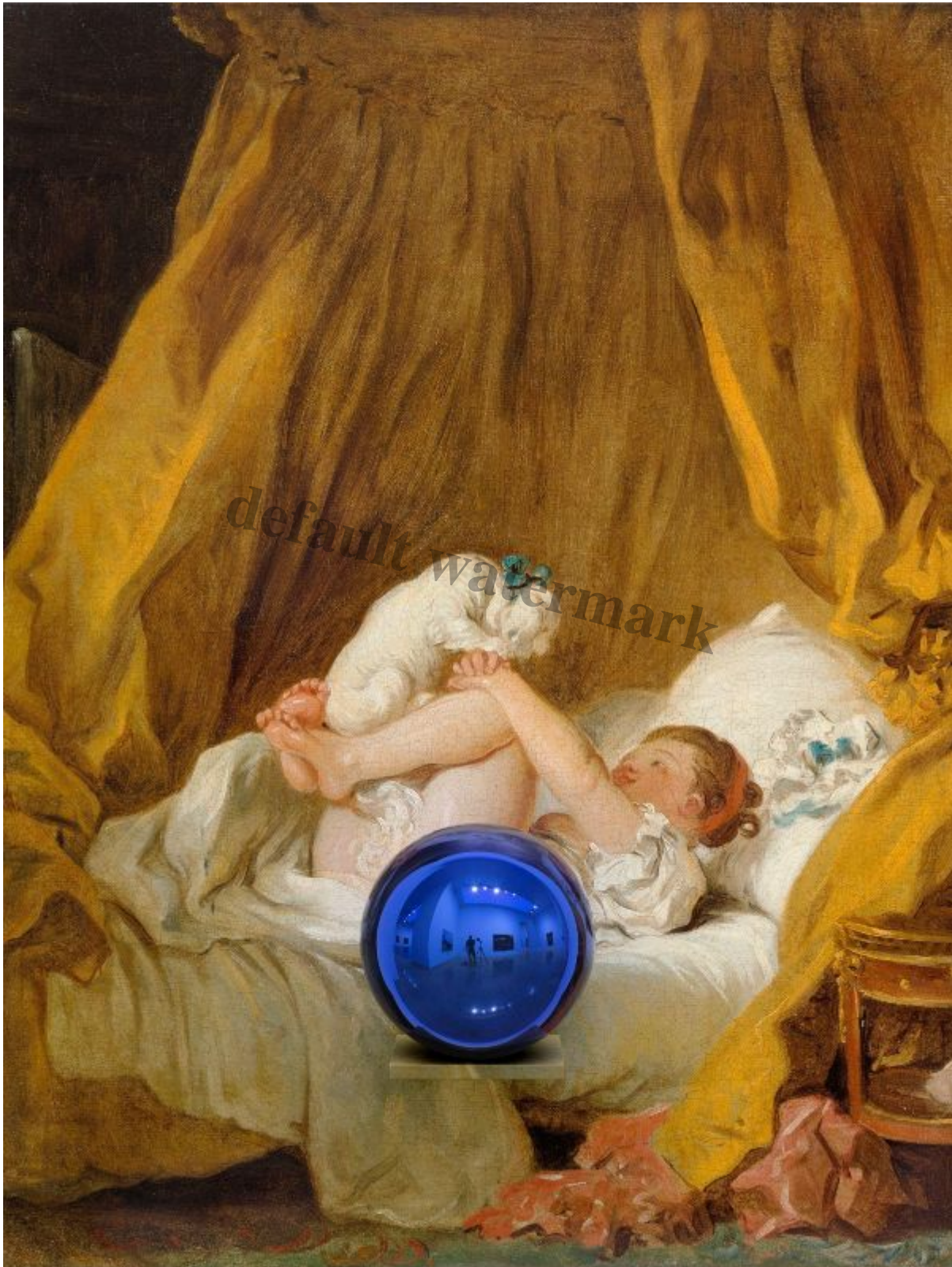
Jeff Koons, Gazing Ball (Fragonard Young Girl Playing With Her Dog), oil on canvas, glass and aluminium, 174 x 136.5 x 37.5 cm, 2014-2015. Est: SG$550,000 - 860,000 / US$409,000 - 640,000. The iconic Gazing Ball series triggered questions about dialogues between artworks and their viewers, as they look at the mirrored surface juxtaposed against the re-adaptation of a Fragonard masterpiece.