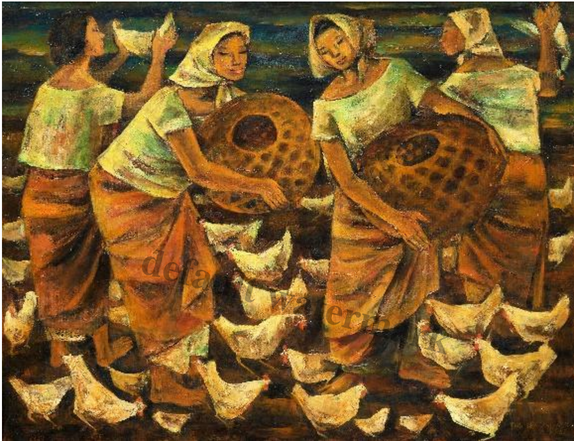
Anita Magsaysay-Ho, Paghuhuli Ng Mga Manok (Catching Chickens) oil on canvas, 102 x 132 cm, 1962

Koons, Yayoi Kusama, Lee Bae, as well as Beatriz Milhazes. Works by Georgette Chen, Anita Magsaysay-Ho and Beatriz Milhazes are also now on view at the ongoing Venice Biennale.