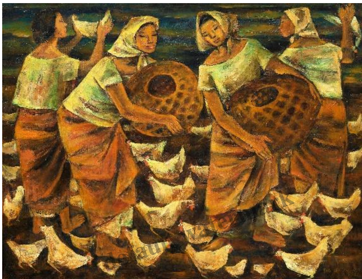
Anita Magsaysay-Ho, Paghuhuli Ng Mga Manok (Catching Chickens) oil on canvas, 102 x 132 cm, 1962

Koons, Yayoi Kusama, Lee Bae, as well as Beatriz Milhazes. Works by Georgette Chen, Anita Magsaysay-Ho and Beatriz Milhazes are also now on view at the ongoing Venice Biennale.