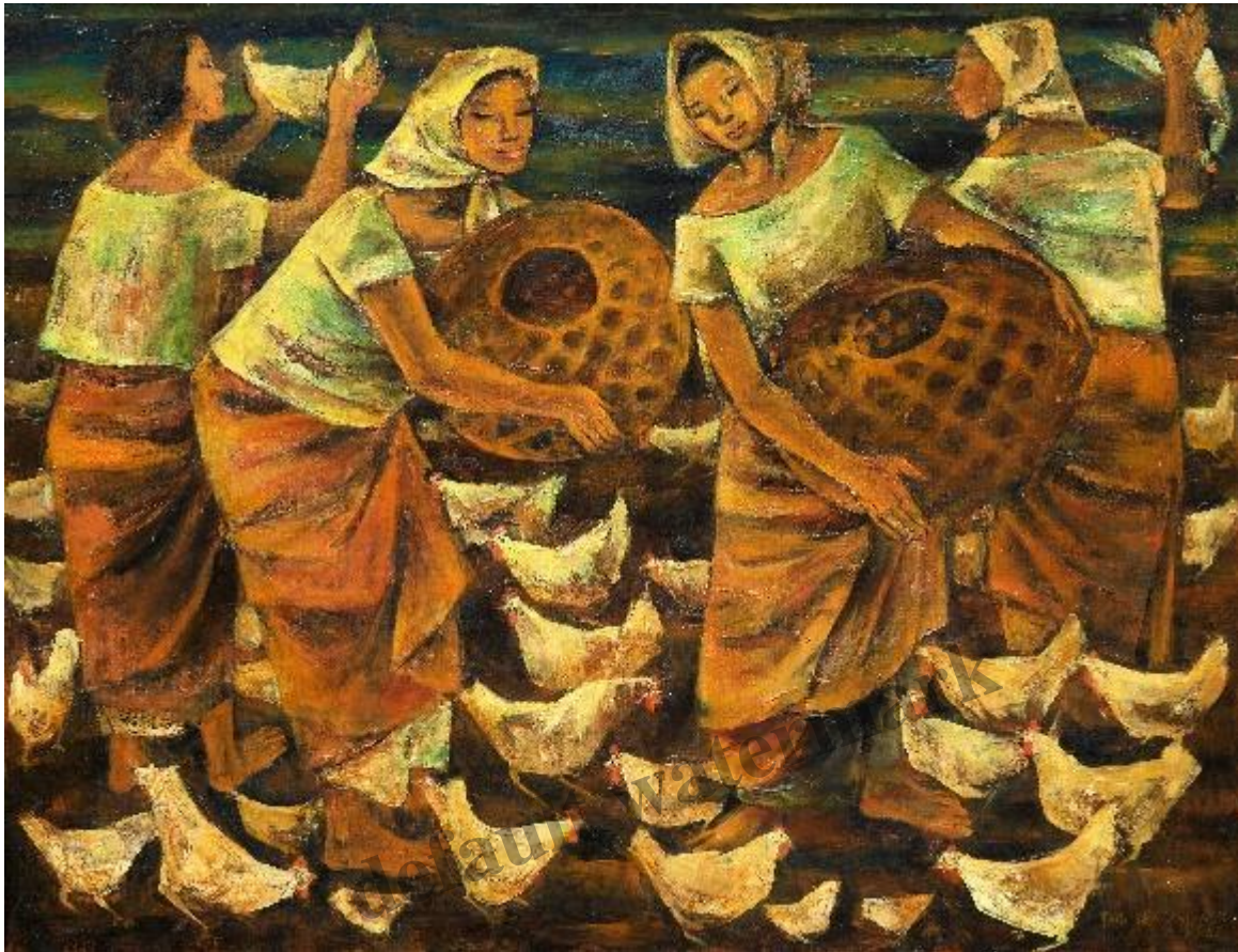
Anita Magsaysay-Ho, Paghuhuli Ng Mga Manok (Catching Chickens) oil on canvas, 102 x 132 cm, 1962

Koons, Yayoi Kusama, Lee Bae, as well as Beatriz Milhazes. Works by Georgette Chen, Anita Magsaysay-Ho and Beatriz Milhazes are also now on view at the ongoing Venice Biennale.