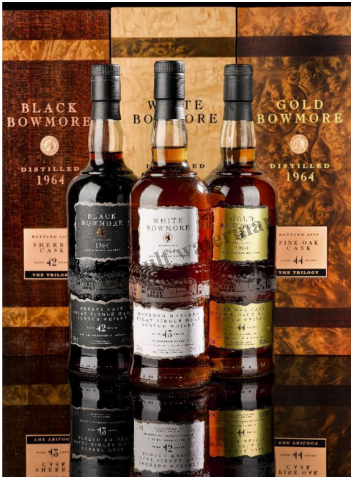
The Bowmore 1964 Trilogy 1964 (3 BT 70) Est: SG$60,000 – 85,000 / US$44,400 – 62,900

Rarely seen in the market, this legendary set of Bowmore was released in 2007 and 2008, containing the Black Bowmore, White Bowmore and Gold Bowmore, all bearing the 1964 vintage. The Black Bowmore 1964 is the successor of the Black Bowmore Series released back in 1993, 1994 and 1995,