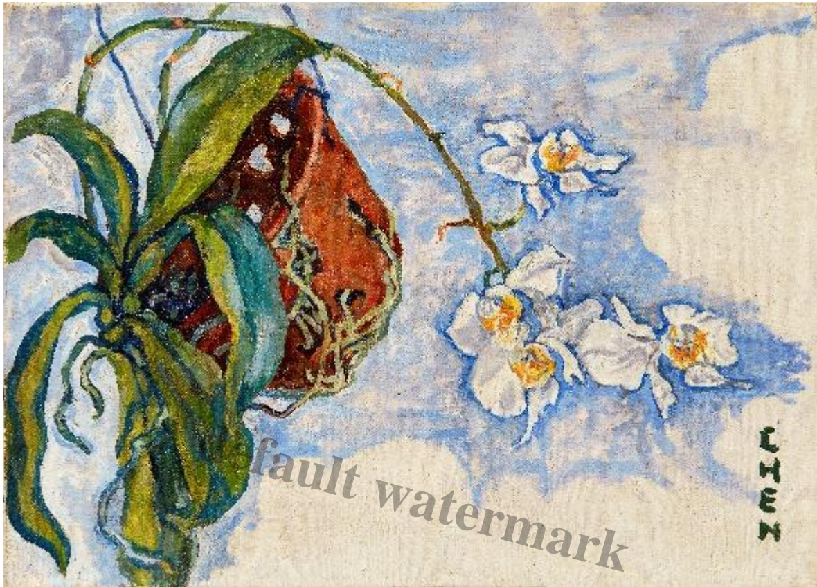
Georgette Chen, White Orchids (Phalaenopsis), oil on canvas, 33 x 46 cm, circa 1965. Est: SG$500,000 – 850,000 / US$372,000 – 635,000. Marking its auction debut, the subject of orchids in Chen’s still-life paintings are rarely seen and have only appeared four other times in the past three decades.