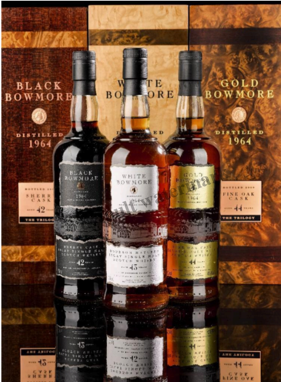
The Bowmore 1964 Trilogy 1964 (3 BT 70) Est: SG$60,000 – 85,000 / US$44,400 – 62,900

Rarely seen in the market, this legendary set of Bowmore was released in 2007 and 2008, containing the Black Bowmore, White Bowmore and Gold Bowmore, all bearing the 1964 vintage. The Black Bowmore 1964 is the successor of the Black Bowmore Series released back in 1993, 1994 and 1995,