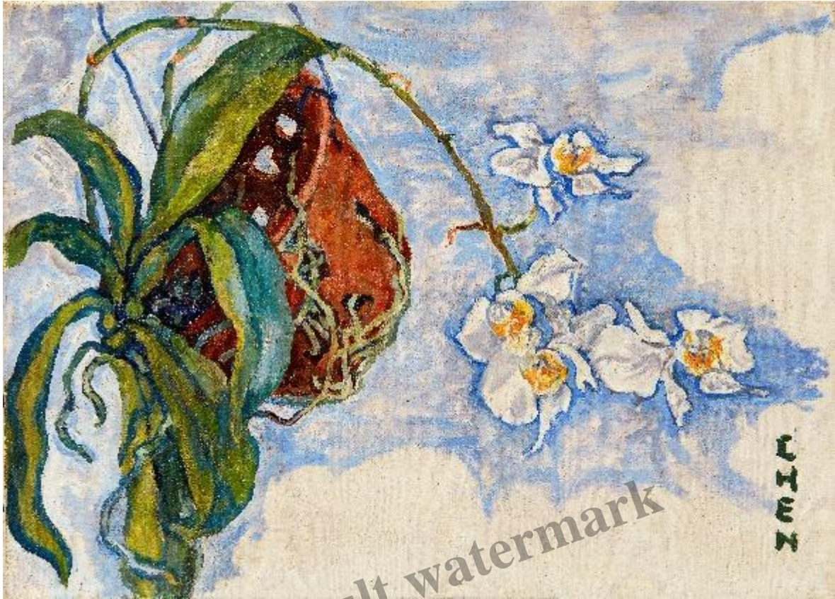
Georgette Chen, White Orchids (Phalaenopsis), oil on canvas, 33 x 46 cm, circa 1965. Est: SG$500,000 – 850,000 / US$372,000 – 635,000. Marking its auction debut, the subject of orchids in Chen's still-life paintings are rarely seen and have only appeared four other times in the past three decades.