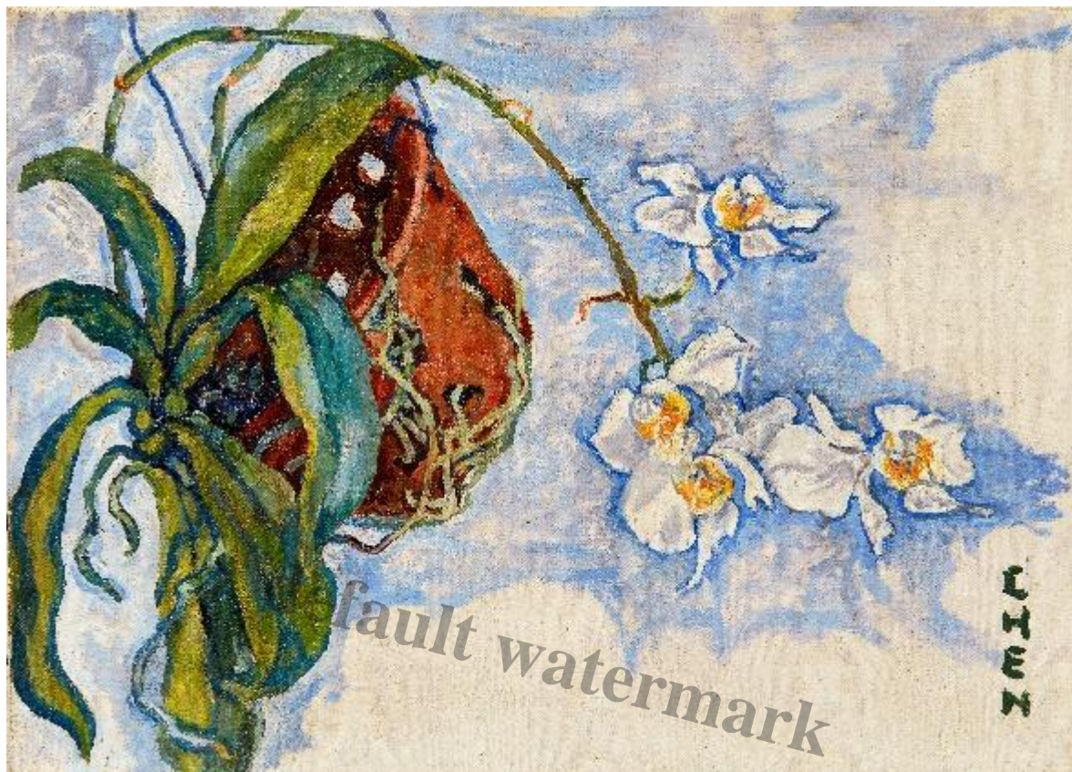
Georgette Chen, White Orchids (Phalaenopsis), oil on canvas, 33 x 46 cm, circa 1965. Est: SG$500,000 – 850,000 / US$372,000 – 635,000. Marking its auction debut, the subject of orchids in Chen’s still-life paintings are rarely seen and have only appeared four other times in the past three decades.