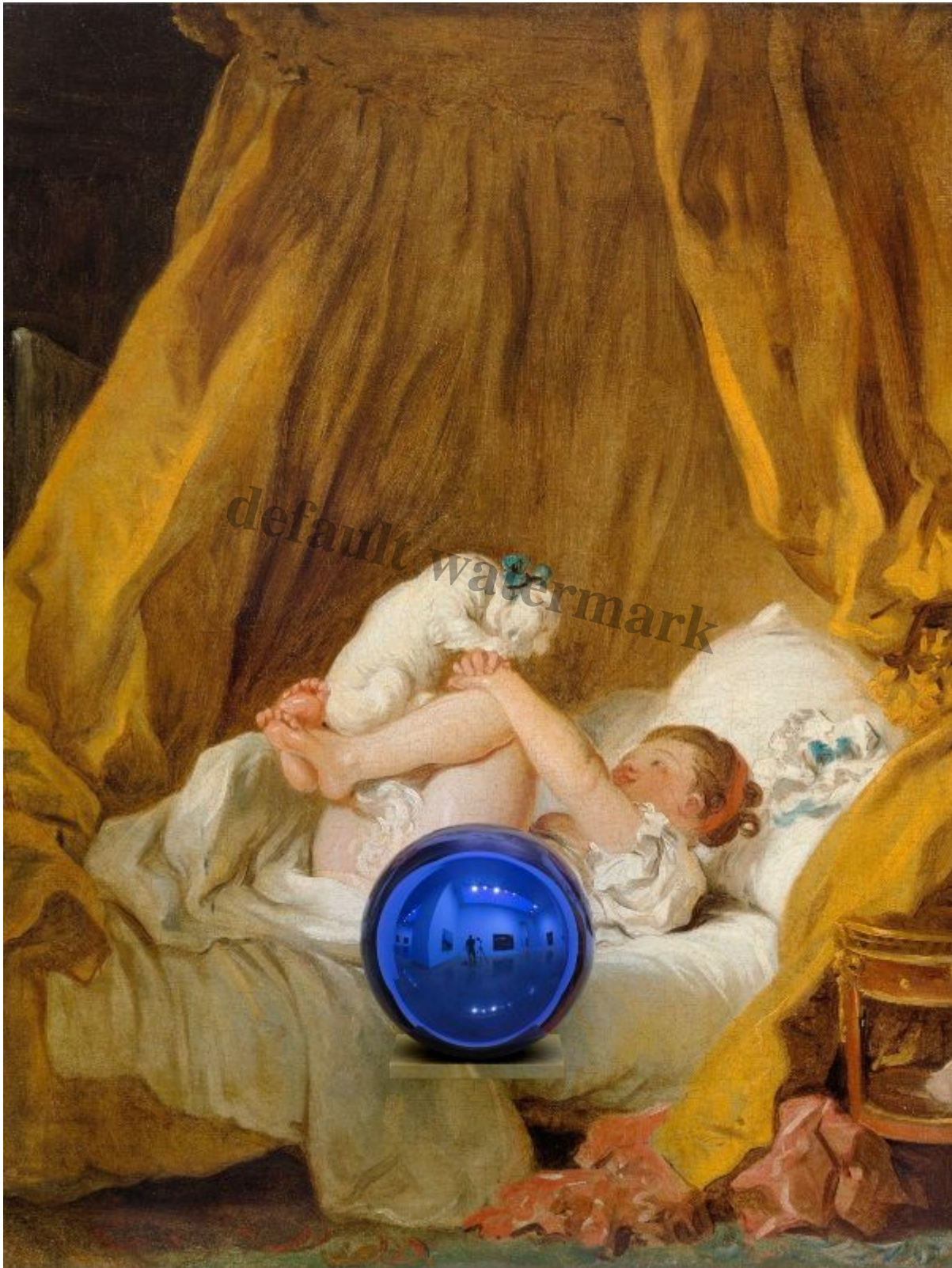
Jeff Koons, Gazing Ball (Fragonard Young Girl Playing With Her Dog), oil on canvas, glass and aluminium, 174 x 136.5 x 37.5 cm, 2014-2015. Est: SG$550,000 - 860,000 / US$409,000 - 640,000. The iconic Gazing Ball series triggered questions about dialogues between artworks and their viewers, as they look at the mirrored surface juxtaposed against the re-adaptation of a Fragonard masterpiece.