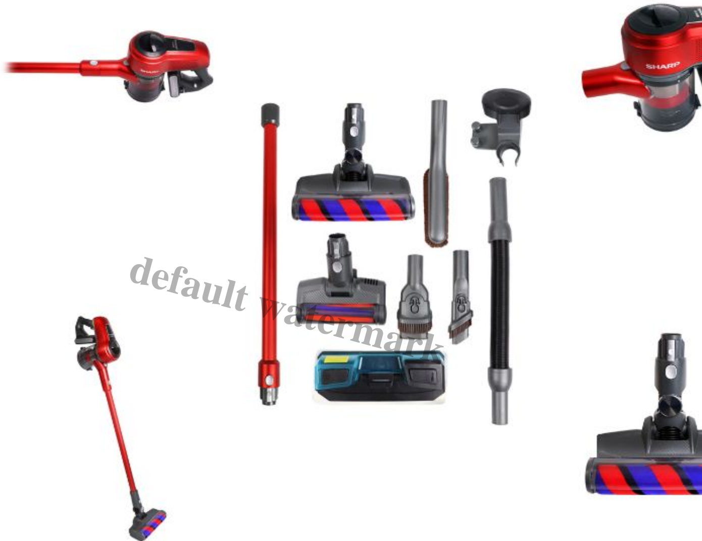
SHARP Handstick Vacuum EC-SA95S-R