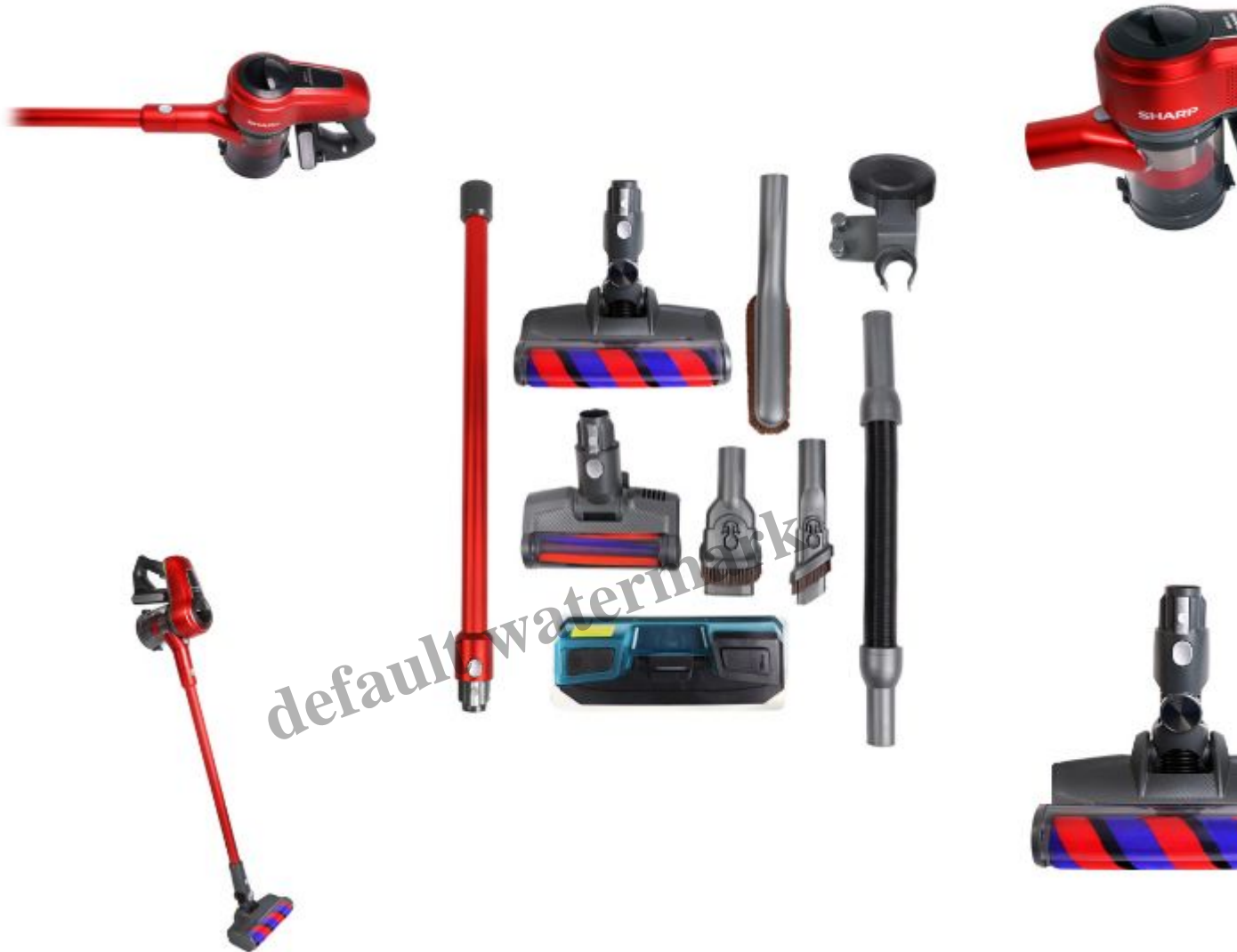
SHARP Handstick Vacuum EC-SA95S-R