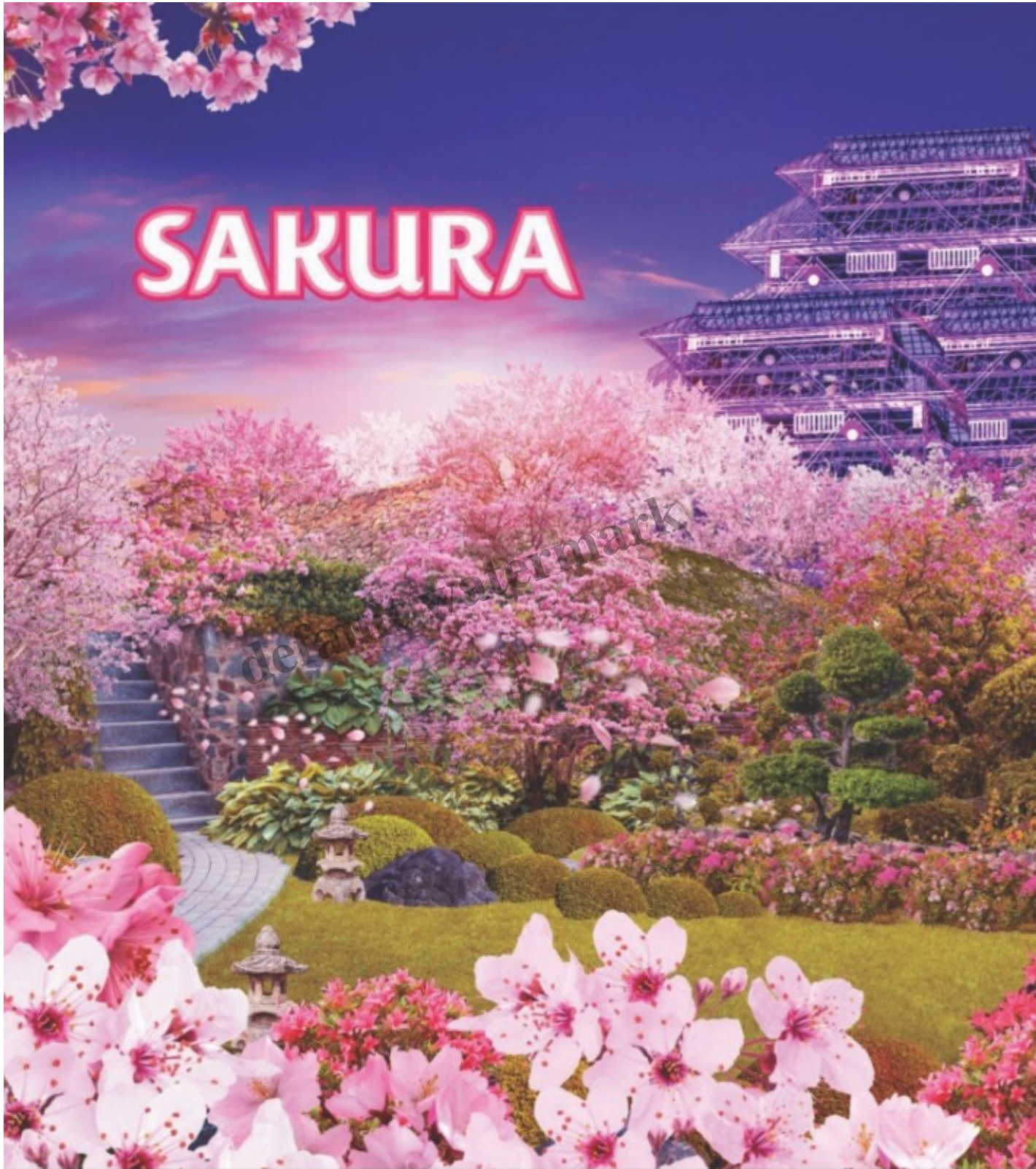
Sakura: Mar to Apr

This year's cherry blossom showcase, the 10th edition of the now iconic floral display, brings visitors to Fukuoka prefecture in Japan. Highlights include recreations of the historic Kokura castle, as well as the ultra-modern "phantom castle" – a light installation of the imagined keep of Fukuoka Castle, amidst a