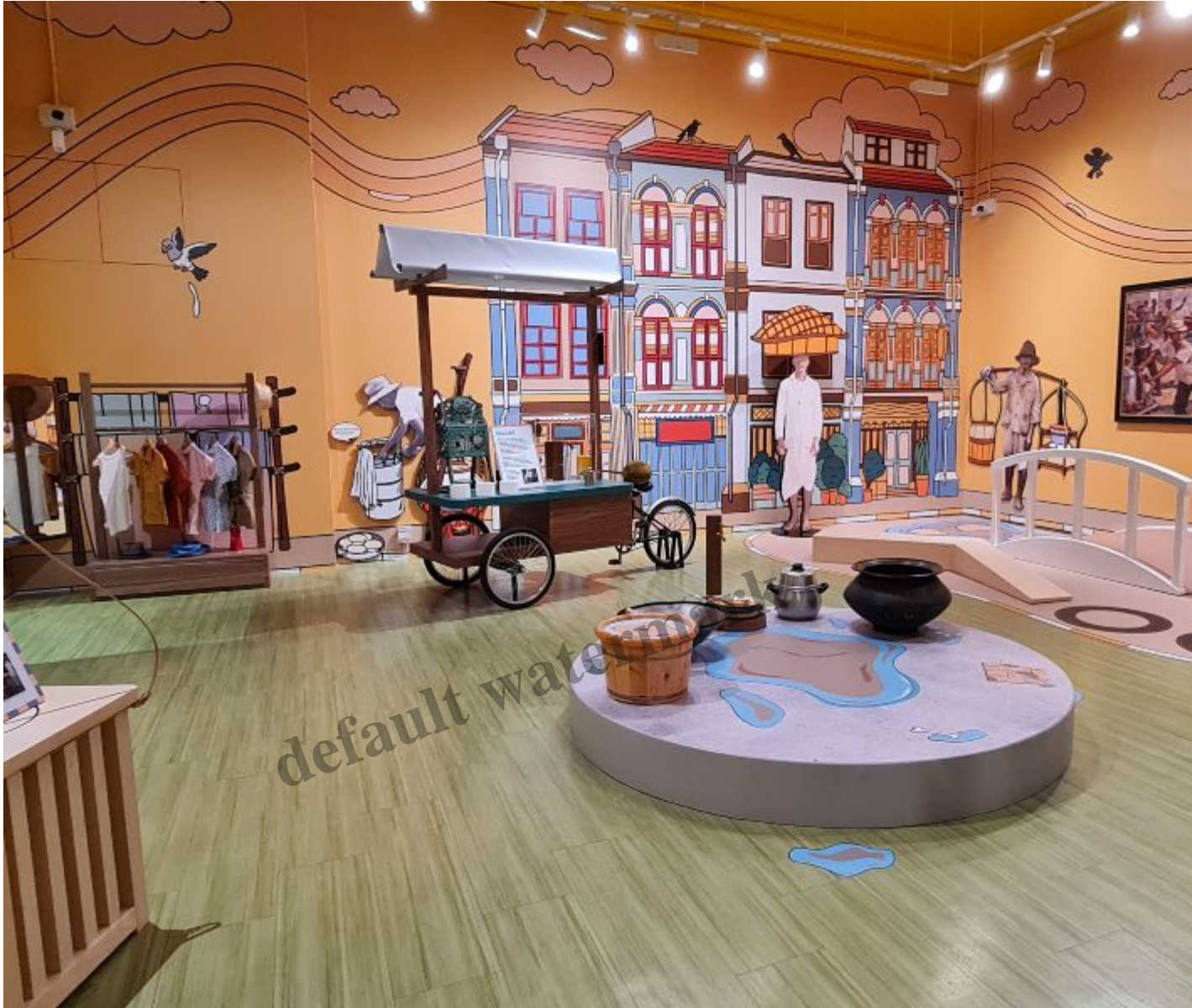
Hawker-themed exhibition titled Into the Hawkerverse