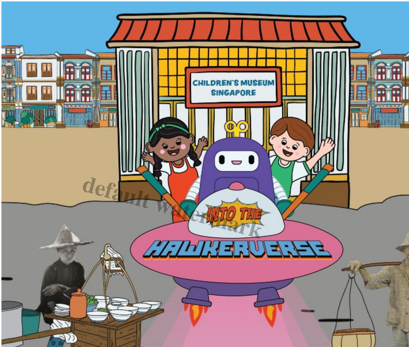
Into The Hawkerverse

In conjunction with Children's Season, CMSG will launch an all-new exhibition titled Into the Hawkerverse. The exhibition aims to introduce Singapore's vibrant and indispensable hawker culture to children and deepen their understanding of hawker culture in a fun, immersive and interactive way.