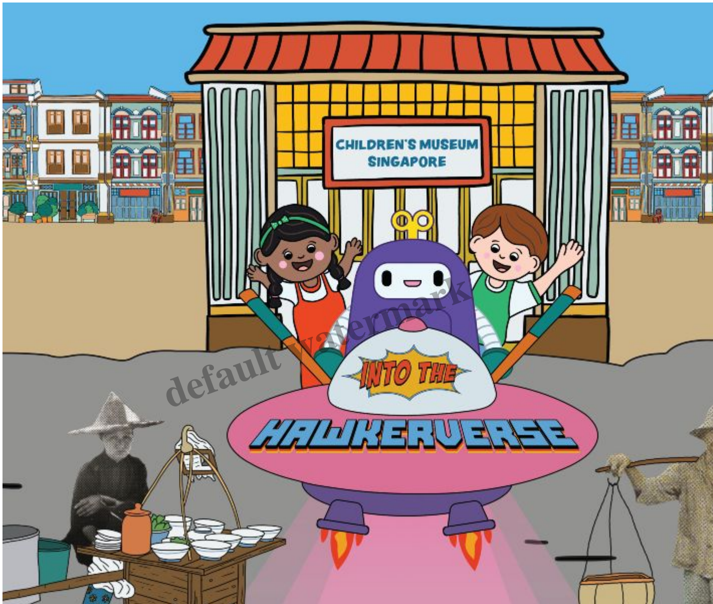
Into The Hawkerverse

In conjunction with Children's Season, CMSG will launch an all-new exhibition titled Into the Hawkerverse. The exhibition aims to introduce Singapore's vibrant and indispensable hawker culture to children and deepen their understanding of hawker culture in a fun, immersive and interactive way.