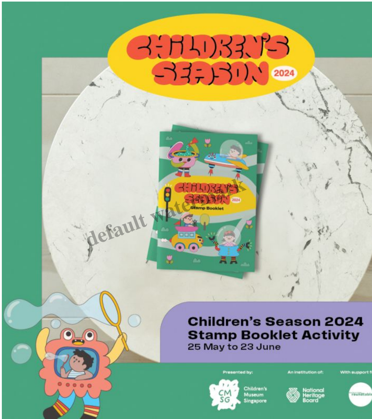
Children's Season 2024