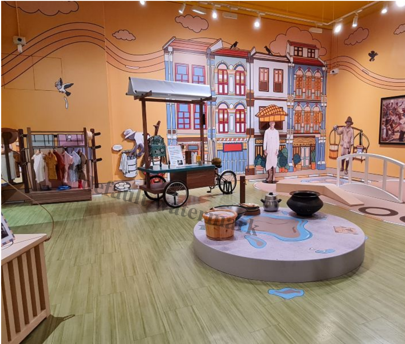
Hawker-themed exhibition titled Into the Hawkerverse