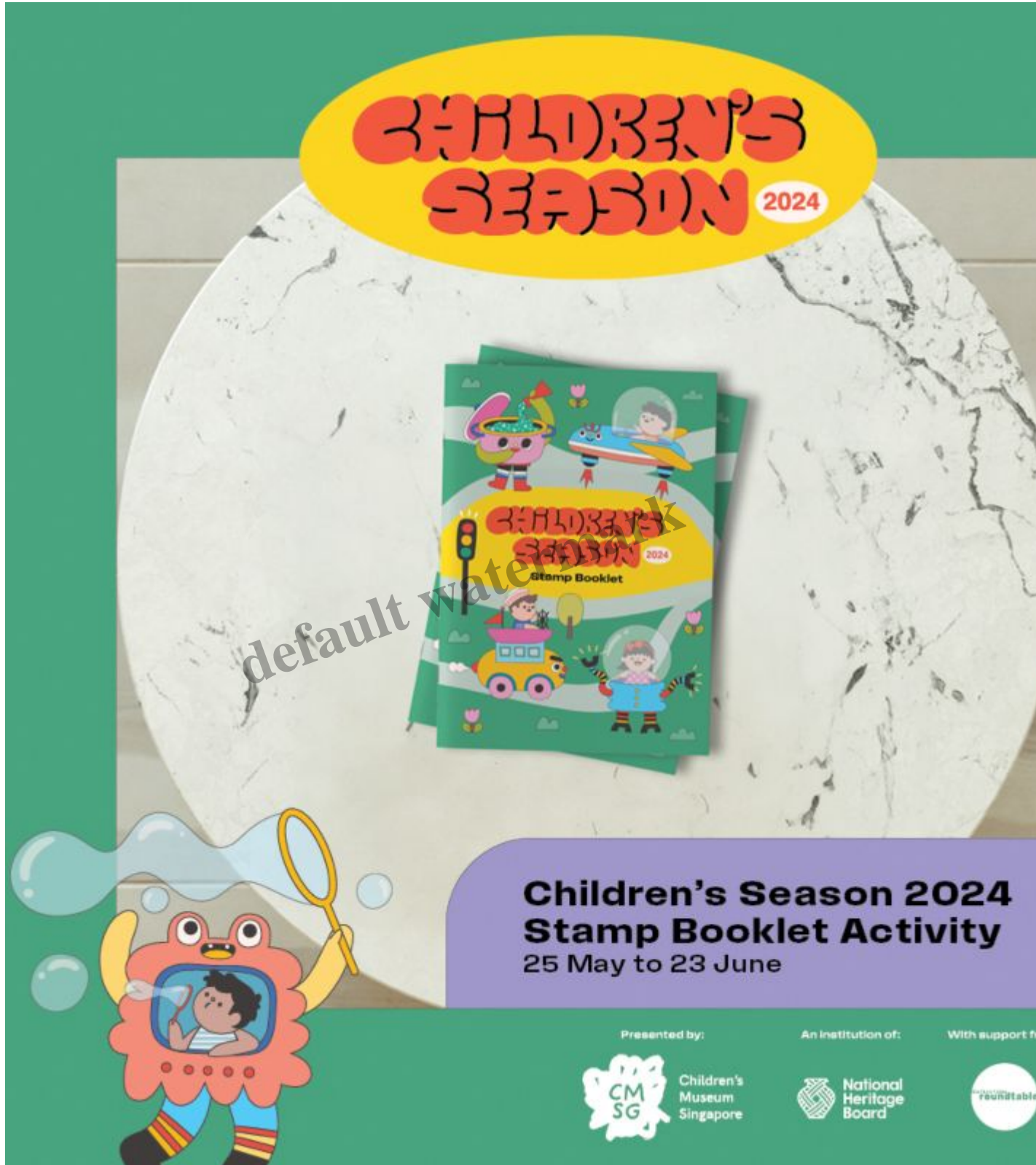
Children's Season 2024

Details on Children's Season 2024 can be accessed at https://www.nhb.gov.sg/childrensmuseum/whatson/childrens-season-2024 . Tickets can be purchased via https://childrensseason.peatix.com/events .