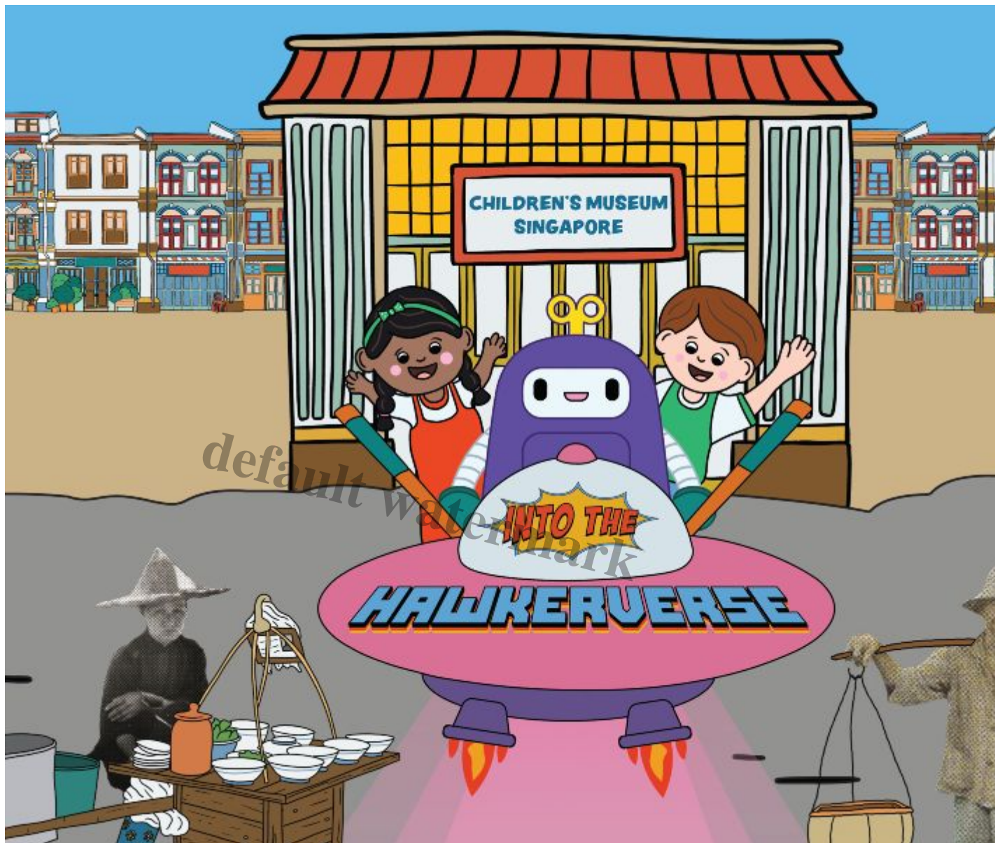
Into The Hawkerverse

In conjunction with Children's Season, CMSG will launch an all-new exhibition titled Into the Hawkerverse. The exhibition aims to introduce Singapore's vibrant and indispensable hawker culture to children and deepen their understanding of hawker culture in a fun, immersive and interactive way.