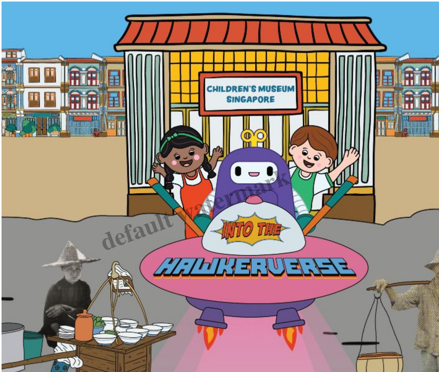
Into The Hawkerverse

In conjunction with Children's Season, CMSG will launch an all-new exhibition titled Into the Hawkerverse. The exhibition aims to introduce Singapore's vibrant and indispensable hawker culture to children and deepen their understanding of hawker culture in a fun, immersive and interactive way.