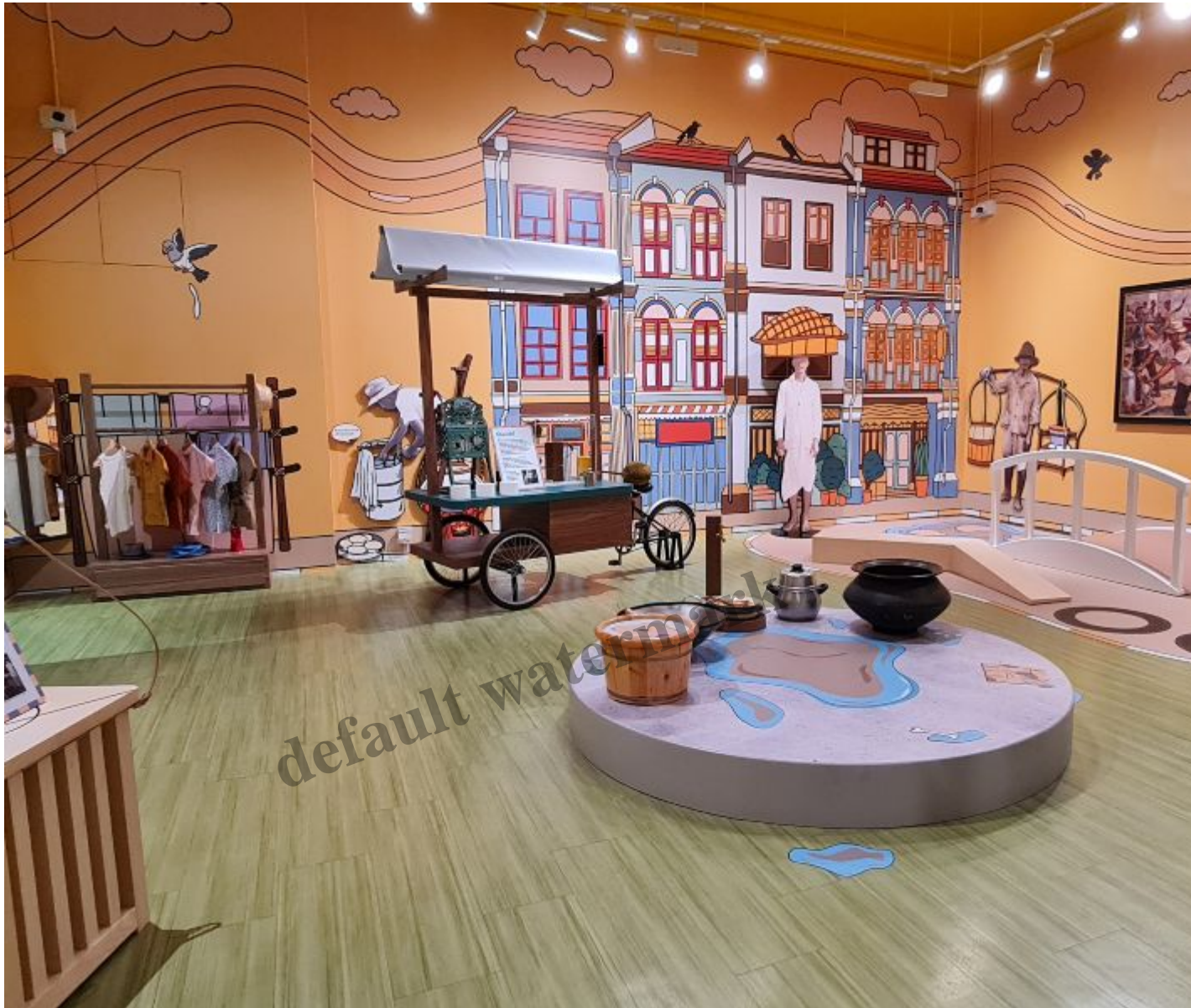
Hawker-themed exhibition titled Into the Hawkerverse