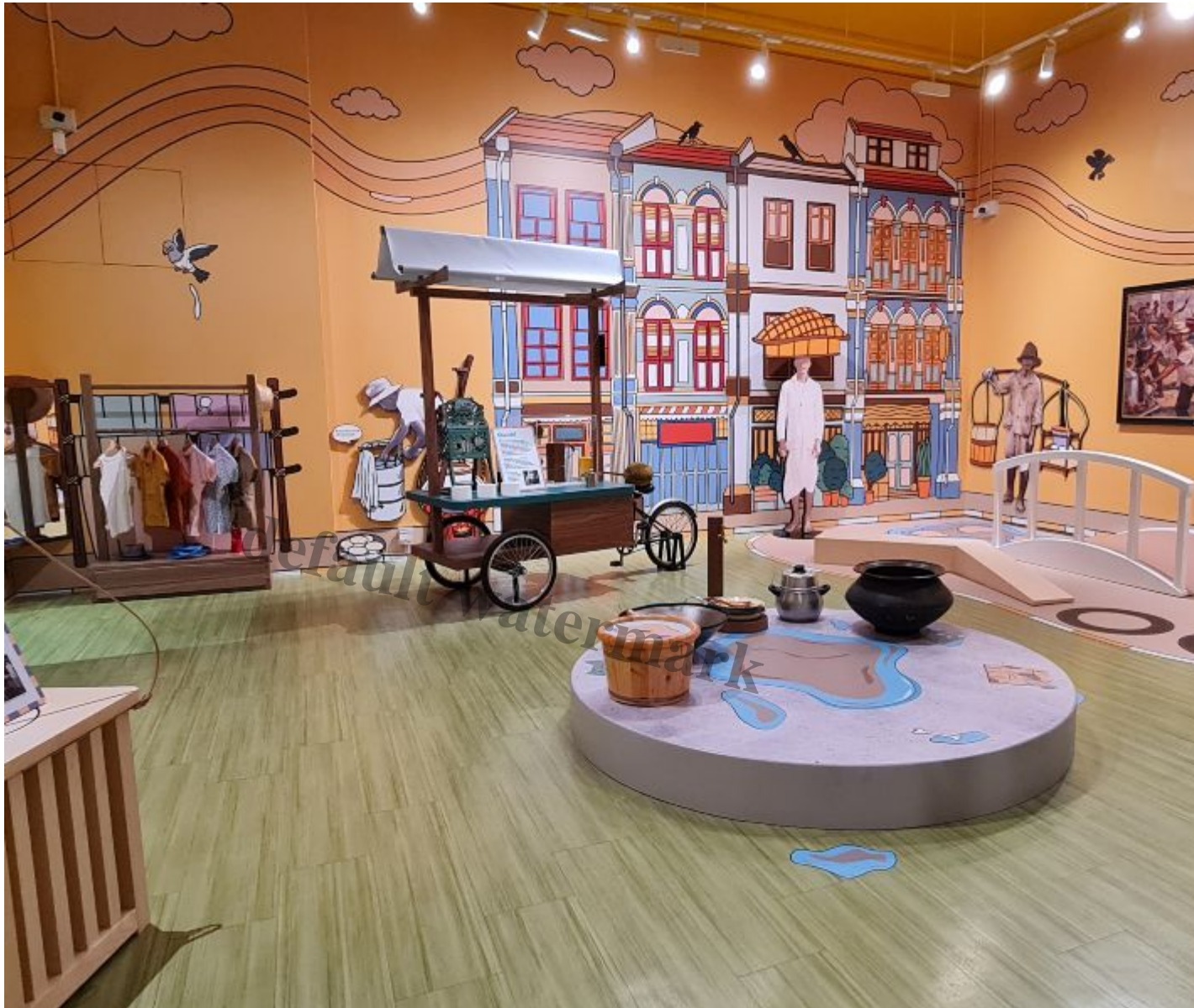
Hawker-themed exhibition titled Into the Hawkerverse