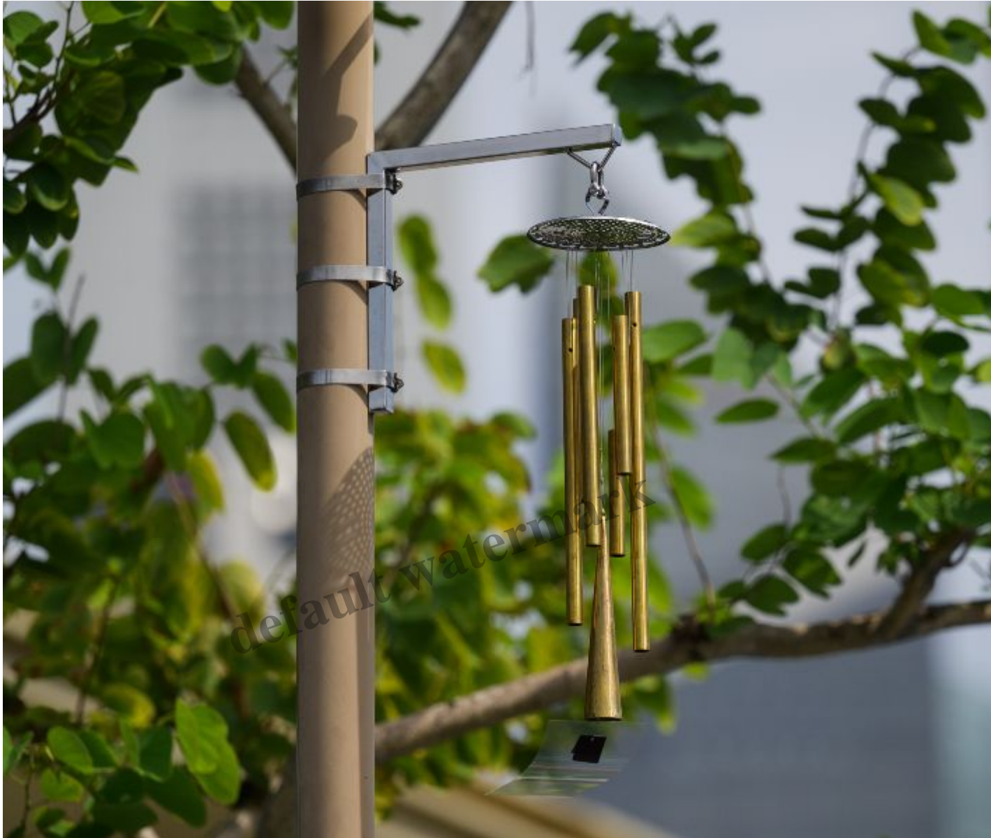
Installation view of GLISTEN wind chime, National Gallery Singapore, 2024.