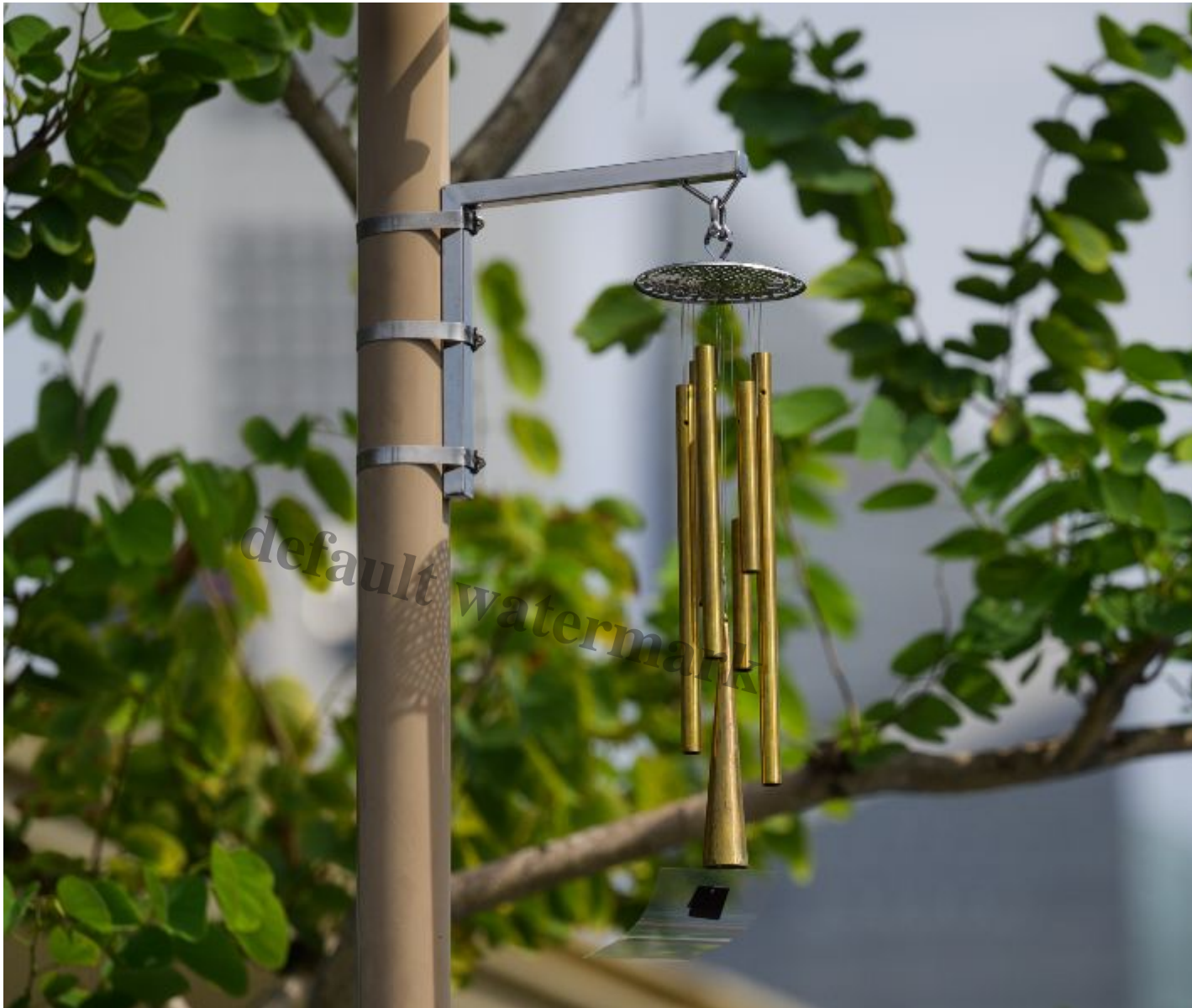
Installation view of GLISTEN wind chime, National Gallery Singapore, 2024.