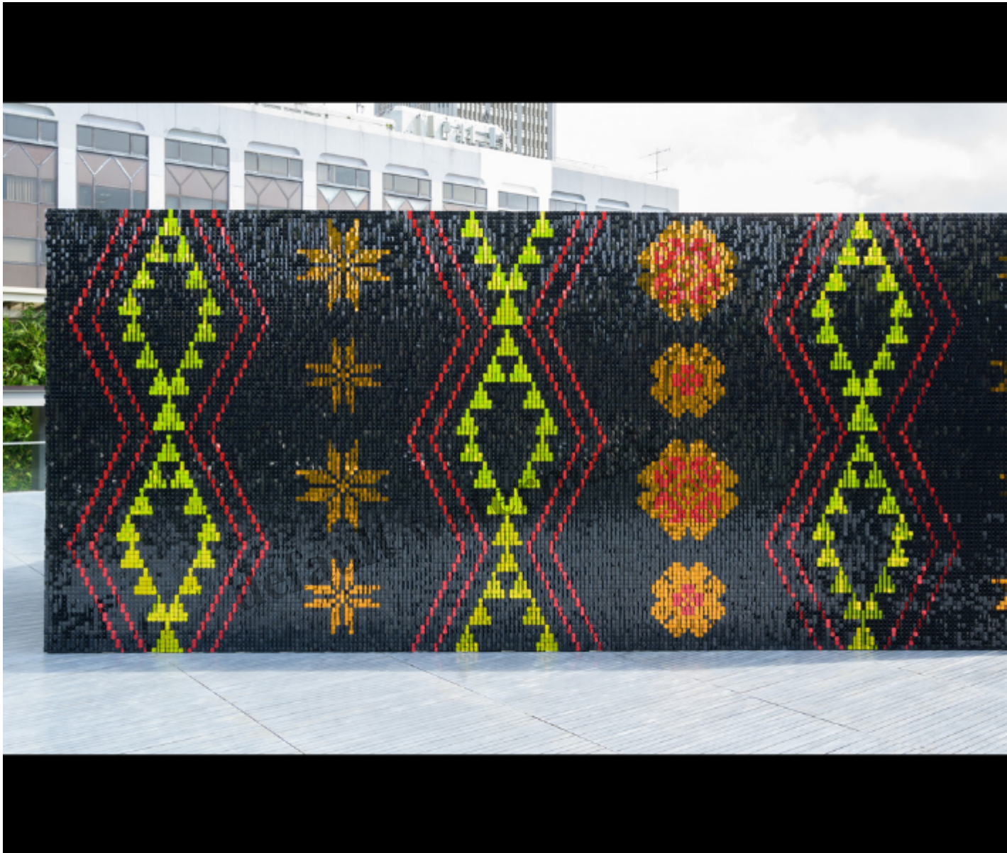
Installation view of GLISTEN wall with Ta?niko patterns, National Gallery Singapore, 2024

Installation view of GLISTEN wall with Ta?niko patterns, National Gallery Singapore, 2024.