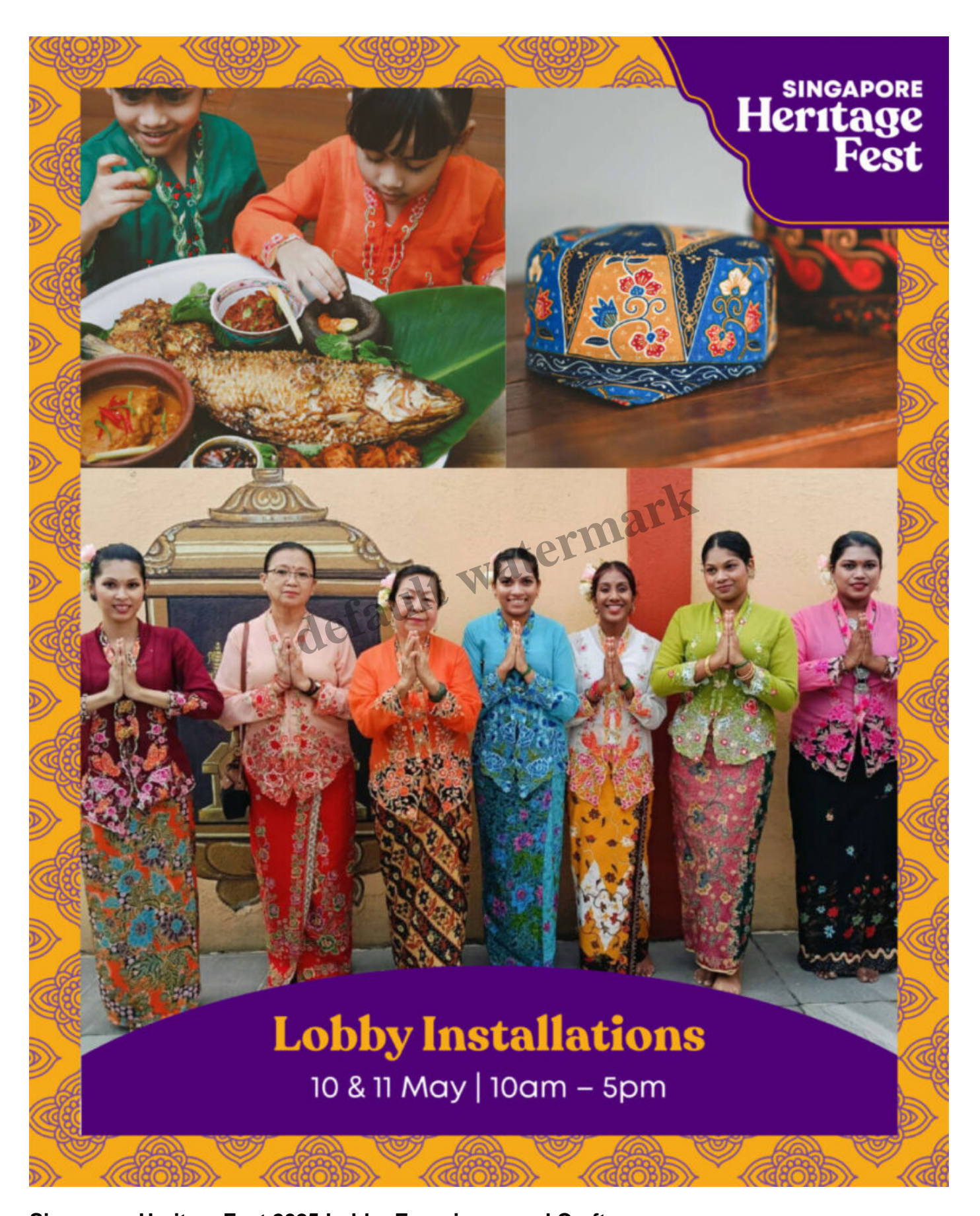
Singapore HeritageFest 2025 Lobby Experience and Crafts