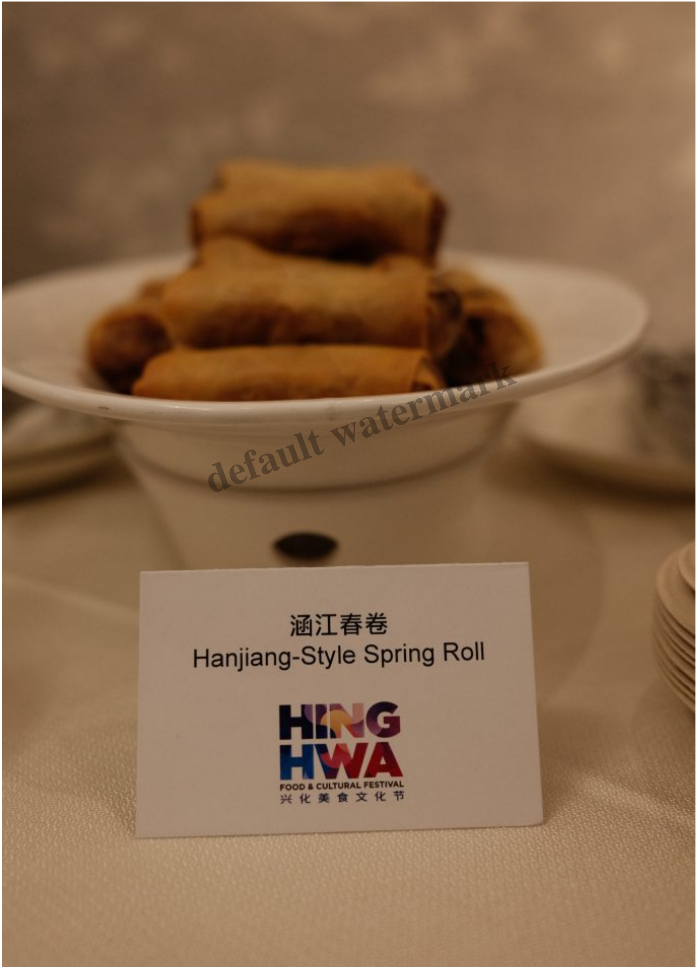
涵江春卷 Hanjiang-Style Spring Roll