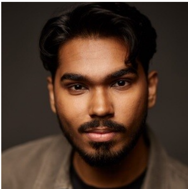
The local cast anchors the show's food and art debate.