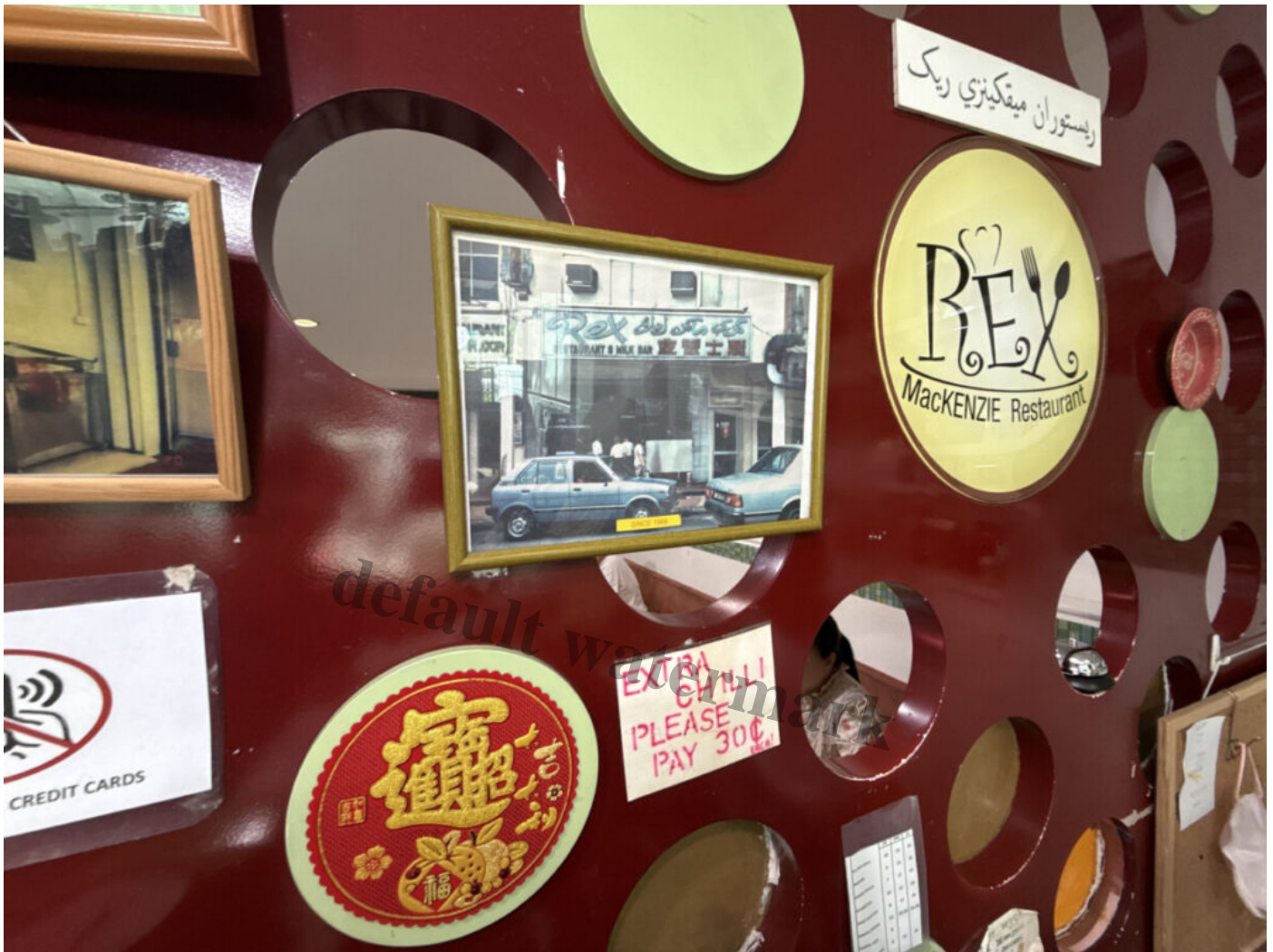
This is how the outlet looks like now. It is located at the roundabout at Prinsep Street.