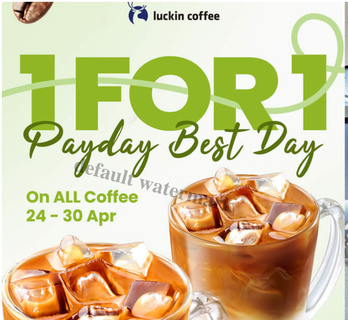
Luckin Coffee's 1-for-1 all coffee promotion was listed for 24 to 30 April 2026.

The Luckin Coffee deal runs from 24 April to 30 April 2026. For Singapore readers, the important point is how the Luckin Coffee 1-for-1 deal changes a real decision this week or this year, not just the headline itself. The promotion is described as a 1-for-1 offer on all coffee beverages, with customers paying for the higher-priced drink when two coffees are selected.