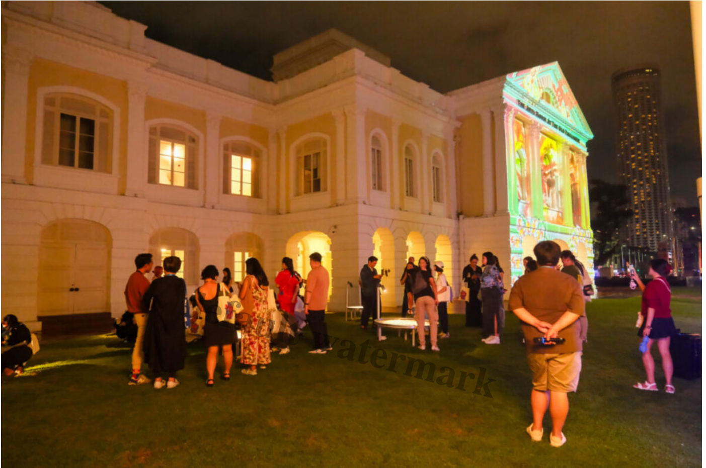
Next up, students from School Of The Arts. Commonly known as SOTA.