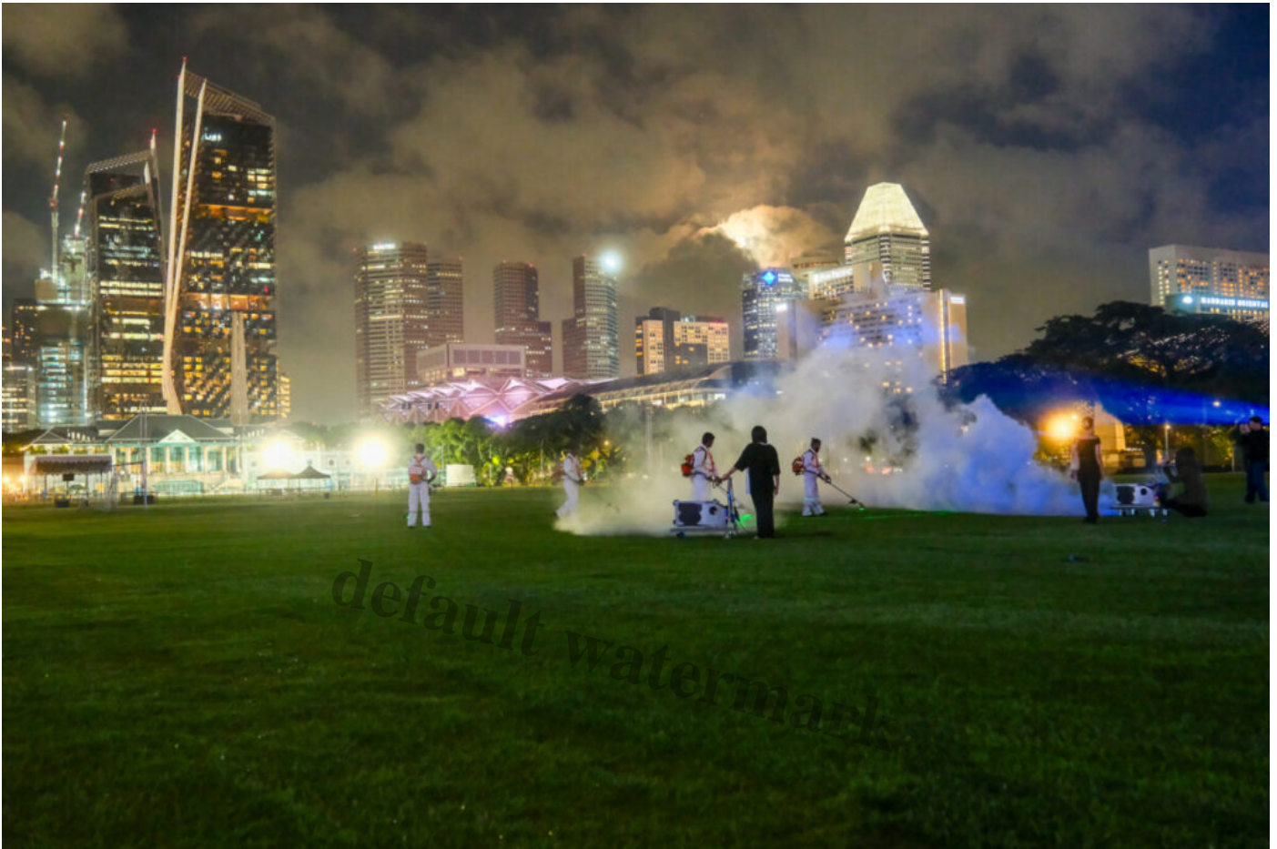
This is the front of the National Gallery. Ready for the event.