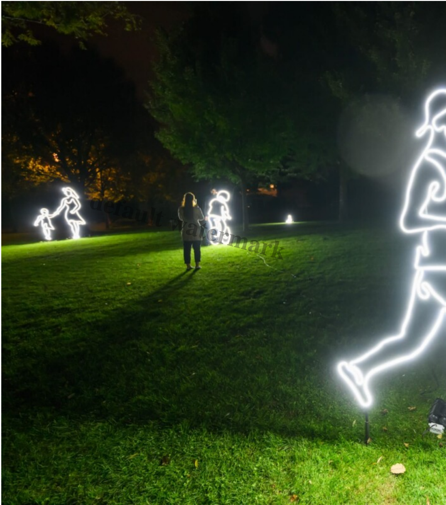
Silent Moments is listed along the Waterfront Promenade beside The Promontory.