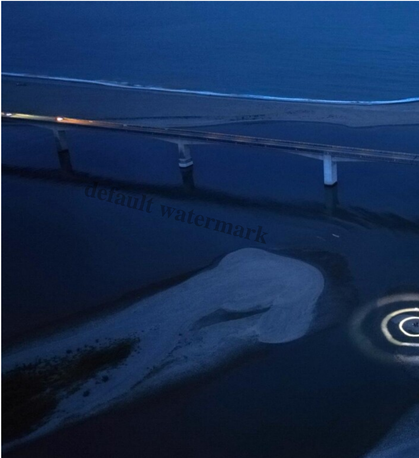
WAVE by Masamichi Shimada sits at The Promontory during i Light Singapore 2026.