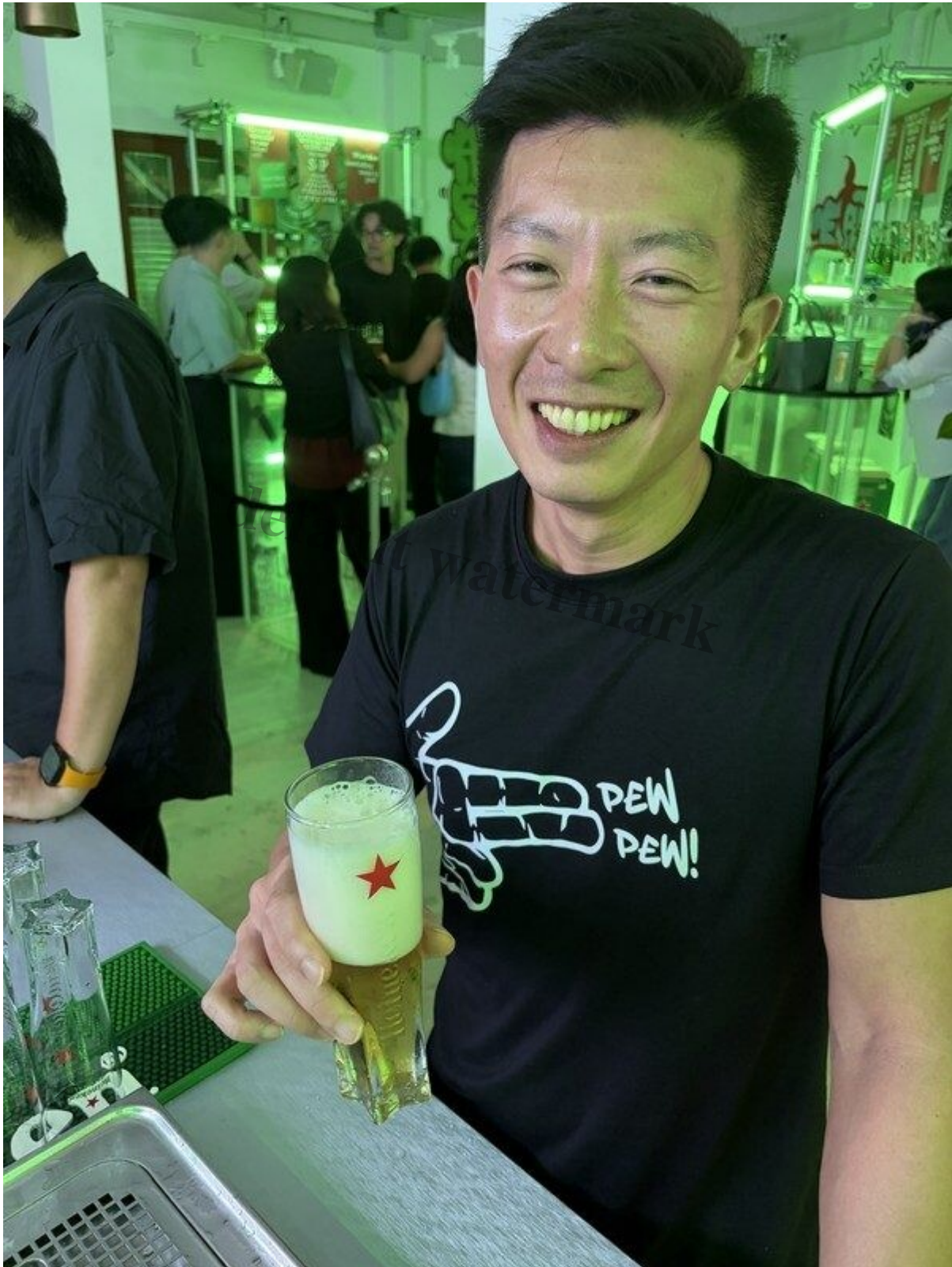
Nailed it. Eventually.