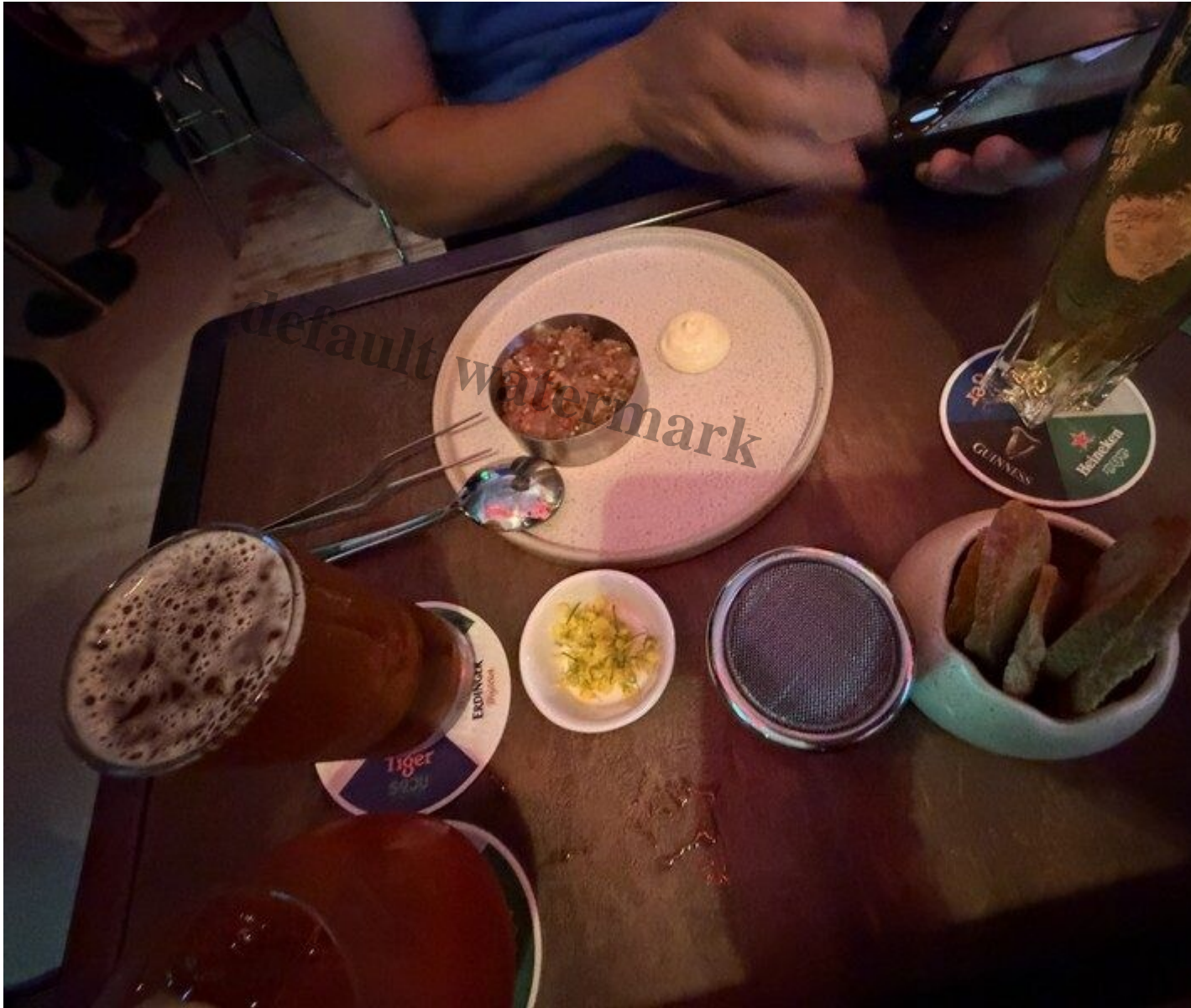
Punched Out: tuna tartare, crostini, the Pure Malt powder you sieve over yourself.