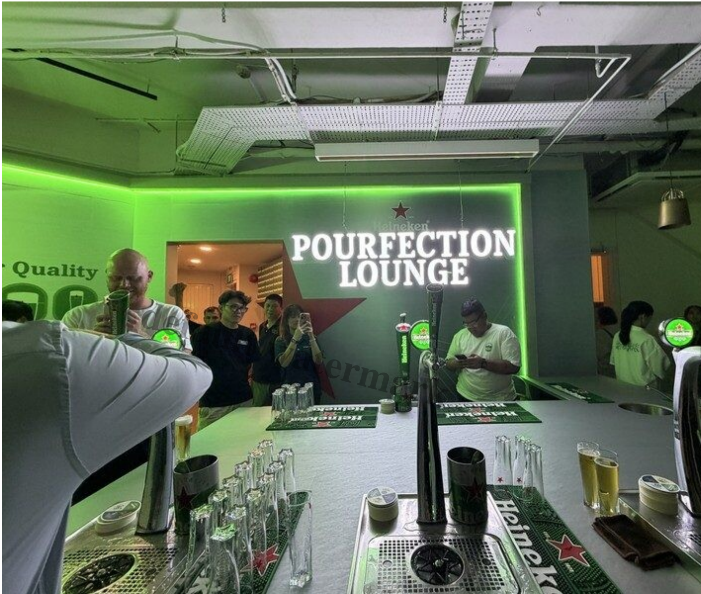
Pourfection Lounge. Bring patience.

This is where you pour your own glass of Heineken over and over again. What? So I get to keep pouring? Well, practice makes perfect. Unless you aspire to be a world-class bartender, this is probably the best place to practise. Being the competitive me, I just had to get it right.