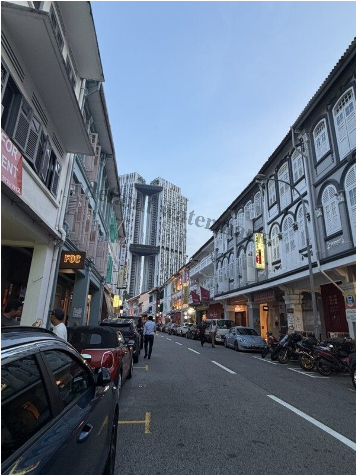
Keong Saik Road in the early evening. Worth getting there before the crowd peaks.