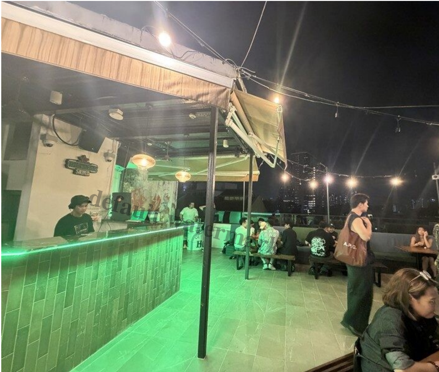
Rooftop bar. String lights. Long-table seating. Worth the climb.