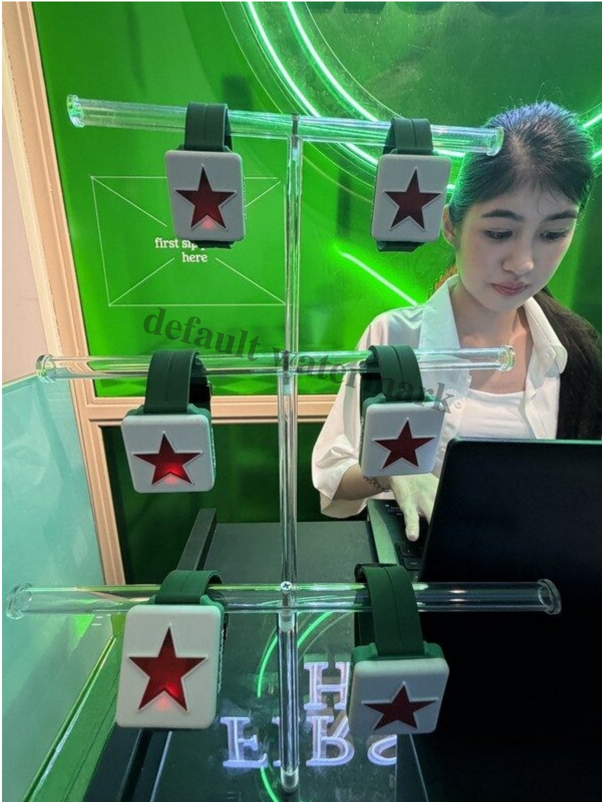
Star Tap bracelets. Every clink is a tap. Every tap unlocks something.

The bracelet is the gimmick that ties the whole house together. Tap your wrist to someone else's, your bracelet changes colour, you climb the live Afterwork Stars leaderboard, and you collect rewards along the way. It's the kind of thing that sounds gimmicky on paper and is genuinely fun once you're three taps in. Strangers actually start strangers-no-more, which is the whole point.