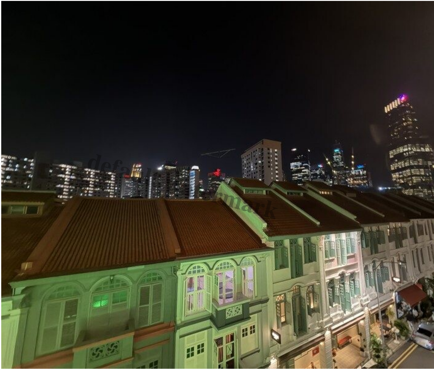
Look down from the rooftop. The CBD behind, shophouses below.

The place was greenly decorated, three levels of neon, and packed with Heineken lovers. The rooftop area was insanely cute with little shophouses below that look like Monopoly houses from the top.