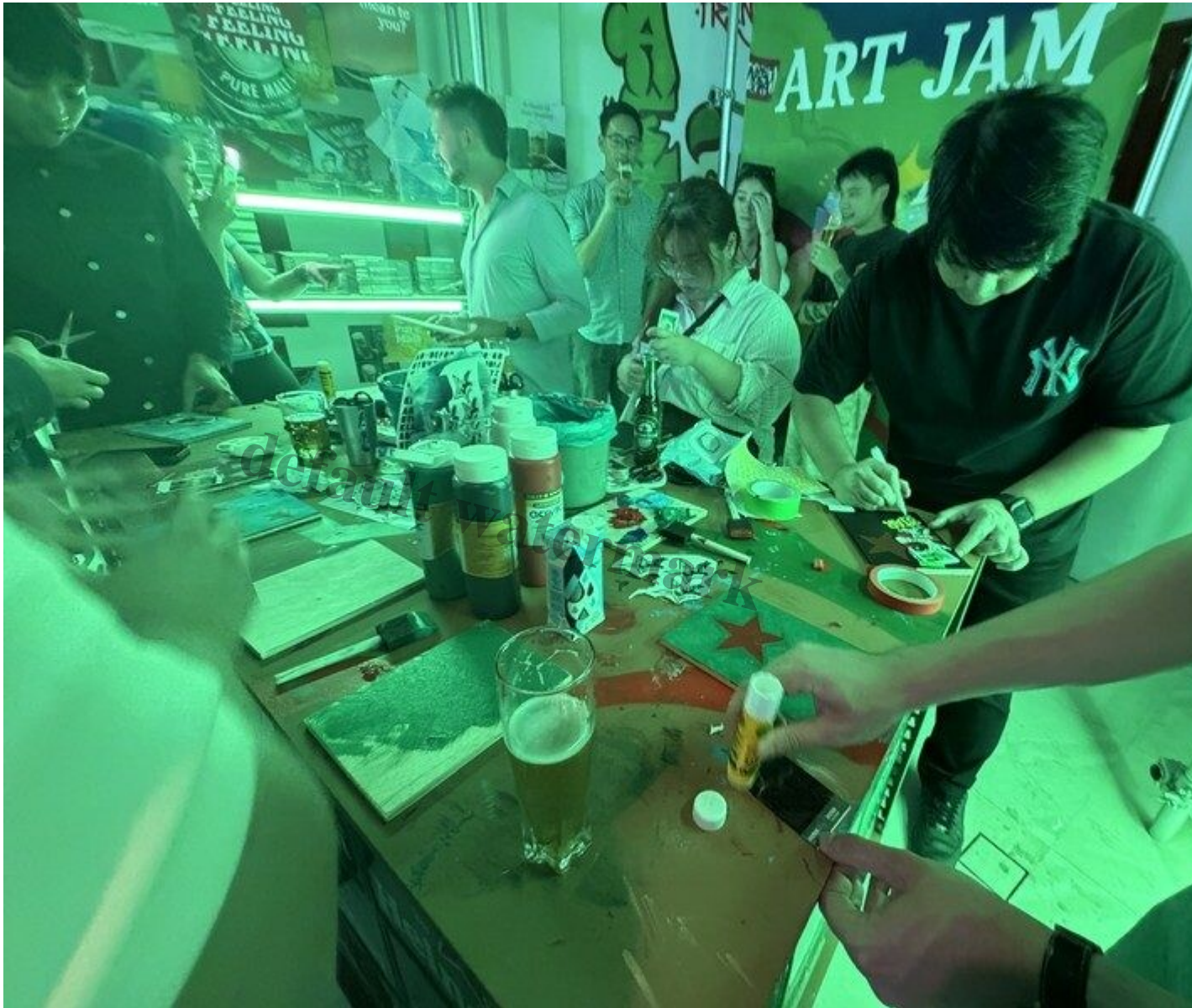
Graffiti-painted bases, lots of glue, even more beer. No rules.

If youâ??d rather make something than scroll something, Art Jam gives you a graffiti-painted base and a table full of cutting, layering and printing supplies. No rules, no pressure. Just a Heineken in one hand and scissors in the other. Iâ??m not an artist (this game begs to differ), but I came away with a piece I was secretly proud of.