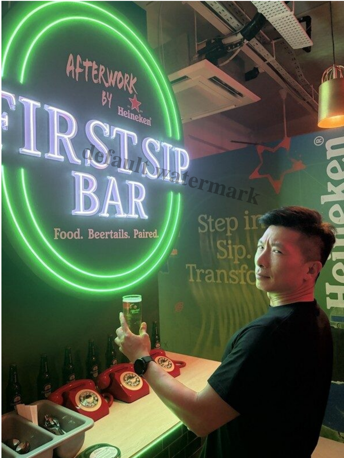
My best attempt. The neon did most of the work.

I tried to get some Instagram-able shots by copying some of these influencers, but my tight muscles proved a challenge to even turn my head into a sexy pose. At least I tried.