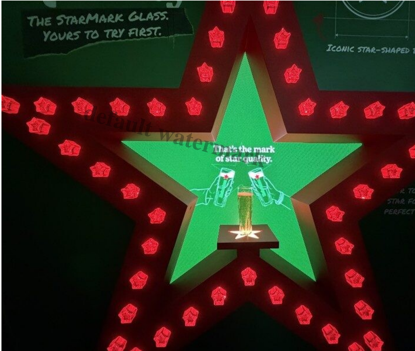
The star base. Thatâ??s the mark of star quality, apparently.

The drill: Rinse, Pour, Skim, Check, Serve. Sounds easy on the wall. Less easy when a Draught Master is watching the foam line. Get it right and the all-new StarMark Glass is yours to take home â?? a precision-engineered glass with a star base designed to lift the aroma, carbonation and taste of every first sip. Exclusive to this event, while stocks last.