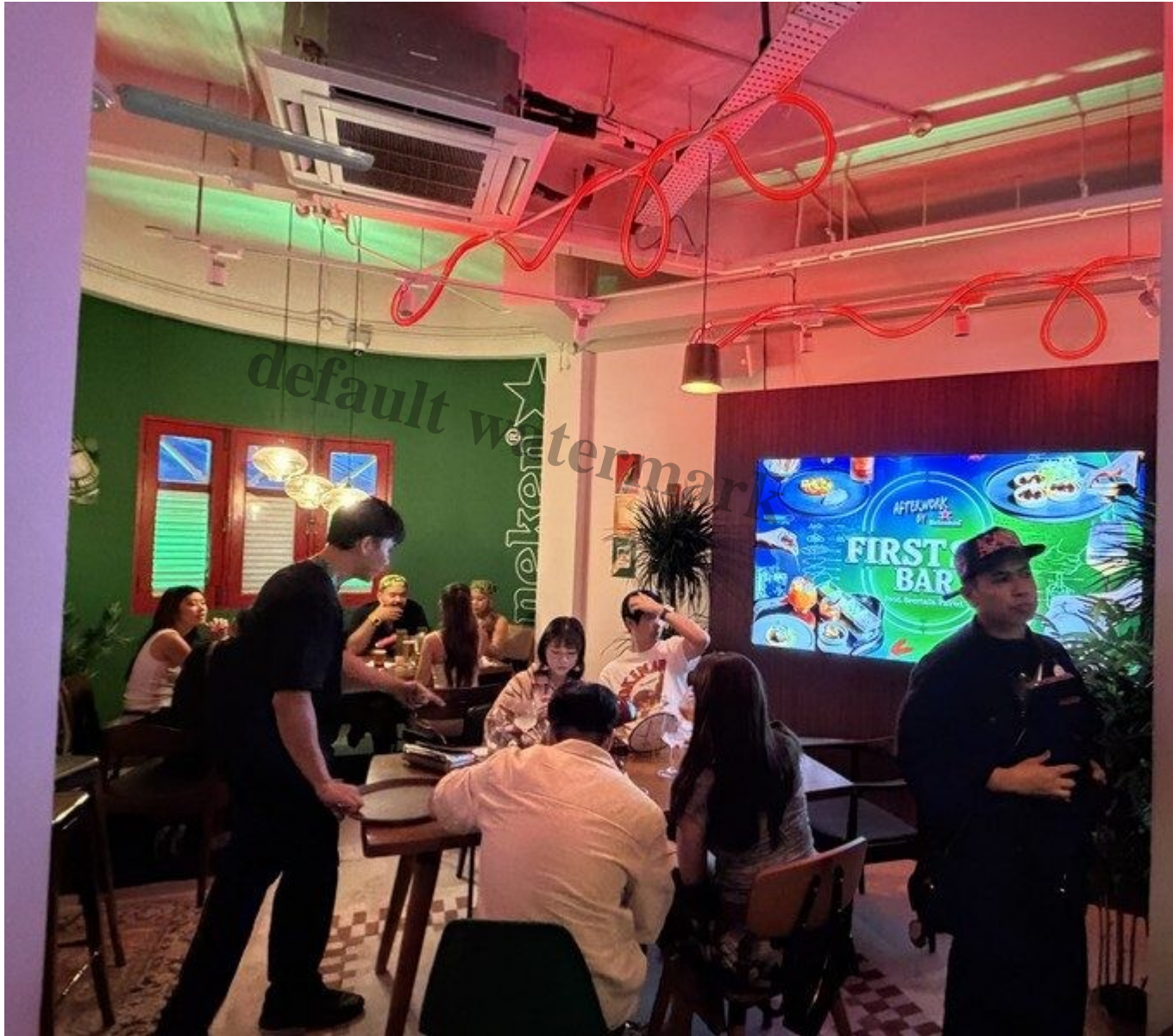
First Sip Bar floor. The pairings menu plays on the screen behind every table.