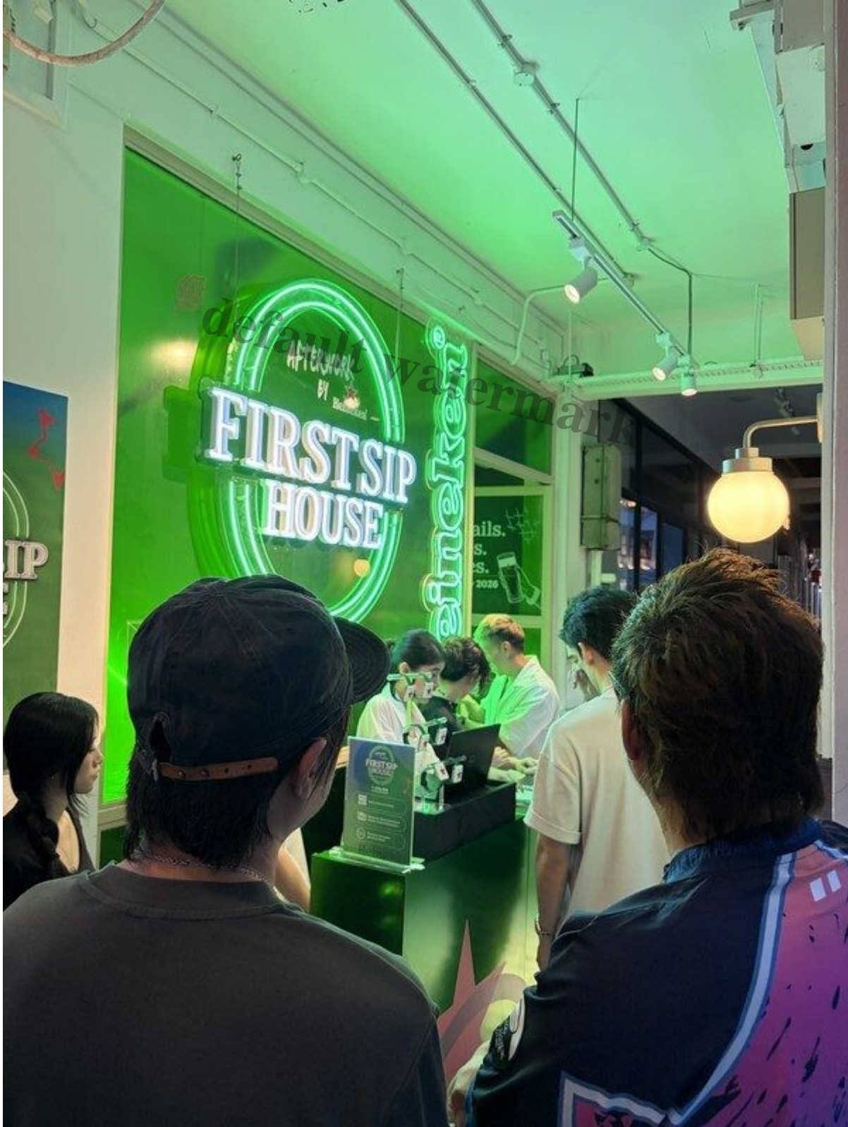
Look for the green neon. You won't miss it.

The address is 36 Keong Saik Road, a five-minute walk from Outram Park MRT (Mass Rapid Transit) exit through the Pearl's Hill end and you're basically there. The street itself does half the work; shophouses lit up in that early-evening way, the smell of dinner from every other unit, the slow shift from suit crowd to bar crowd. A pop-up here makes sense.