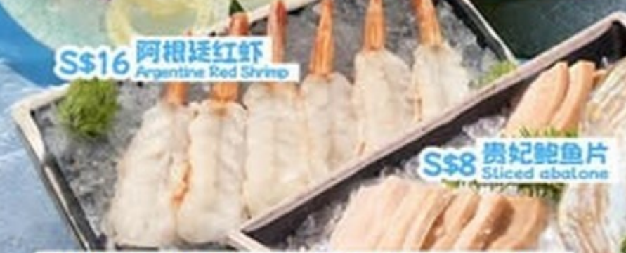
S$8 贵妃鲍鱼片 Sliced abalone