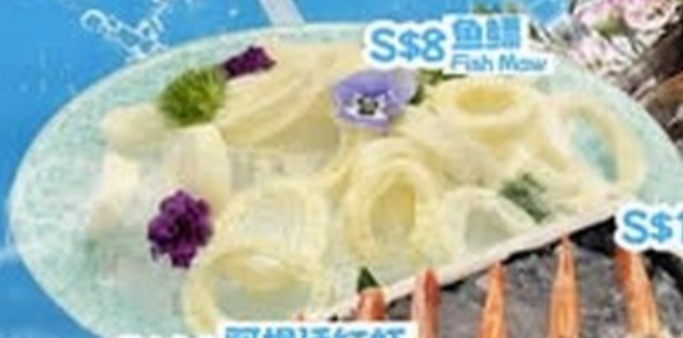
S$8 鱼鳔 Fish Maw