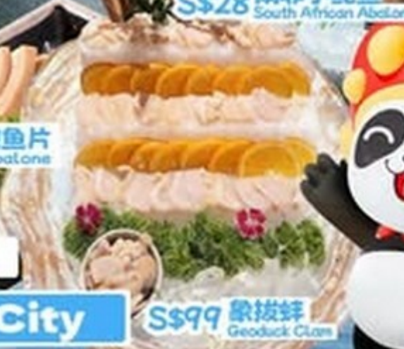
S$99 象拔蚌 Geoduck Gums